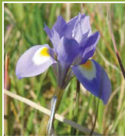
Barbary nut iris