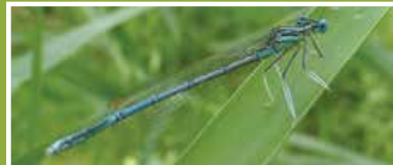
Silver-washed fritillary; white-legged damselfly.

More information visit www.honeyguide.co.uk 11