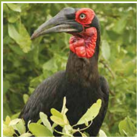
Southern ground hornbill