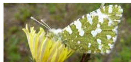
Western dappled white

We hope for warm weather to bring out a few early butterflies such as western dappled white, clouded yellow and Lang's short-tailed blue. As on any Honeyguide holiday we will take a keen interest in early flowers and other wildlife. There's an unusual violet sea-lavender Limonium virgatum and a chance of early orchids.