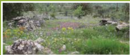
Corinth canal; Aegean coast; spring flowers.