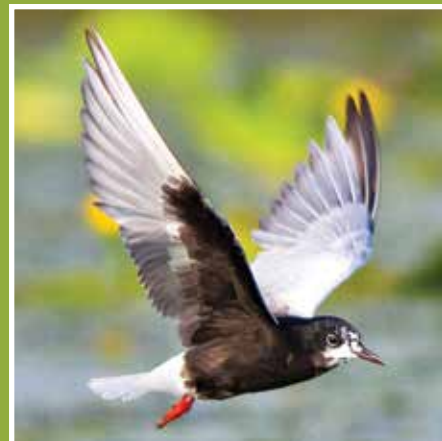
White-winged black tern