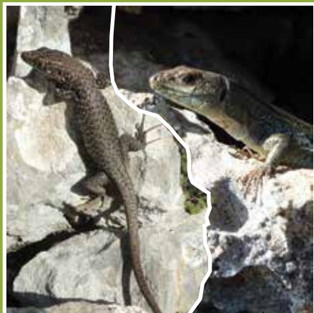
Greek rock lizard (L) and Peloponnese wall lizard (R)