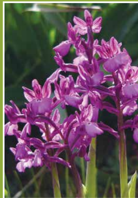
Orchis boryi - Spili