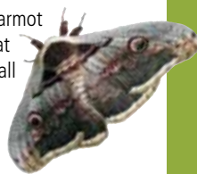
Giant peacock moth

Mammals could include alpine marmot and isard – Pyrenean chamois – at the high tops, and red squirrel. Wall lizards are common and snakes seen with a little luck.