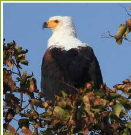
African fish eagle