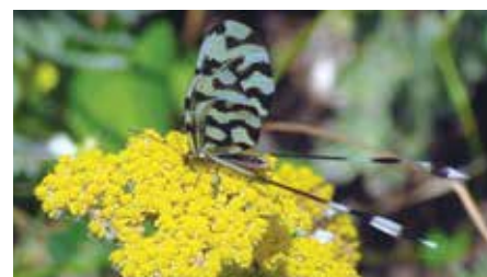
Pennant-winged ant-lion Nemoptera sinuata

The bewildering variety – 72 species on a previous visit – includes many local or unusual species: Balkan zephyr blue, Balkan copper, powdered brimstone and poplar admiral. These mingle with butterflies found more widely in mainland Europe, such as spotted, Queen-of-Spain and Glanville fritillaries, Apollo, chestnut heath, Idas blue and more.