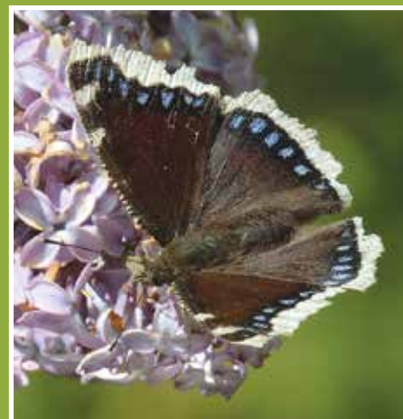
Above: Camberwell beauty, below: Berdún