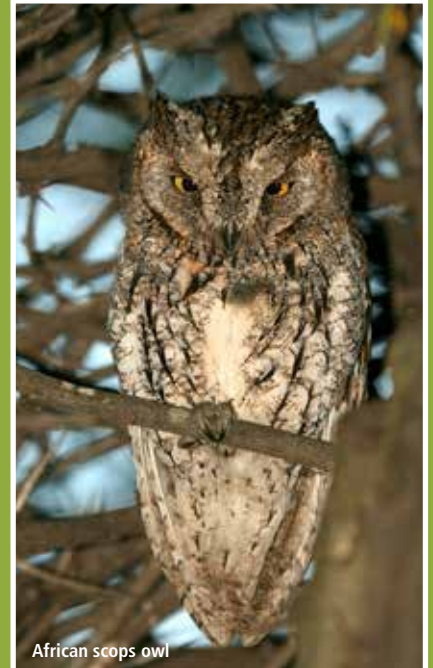
African scops owl