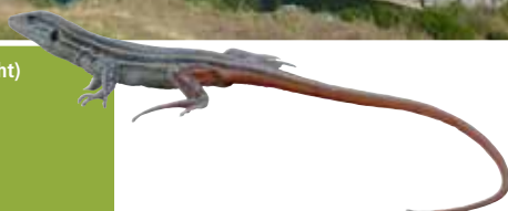
Douro canyon from hotel; spiny footed lizard (right)

SUPPORTING spea Sociedade Portuguesa para o Estudo das Aves