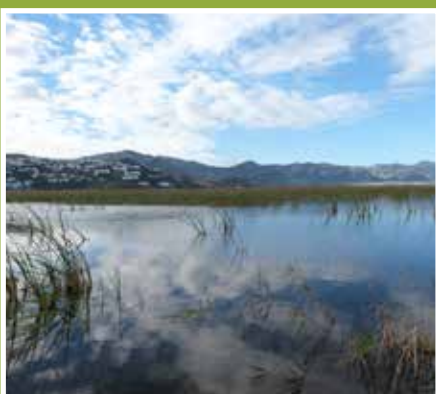
Pego marshes / Steppes of Albacete (below)