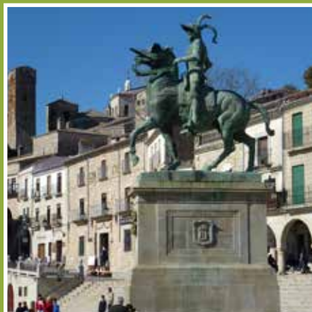
Trujillo Plaza Mayor