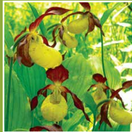
Lady's slipper orchids