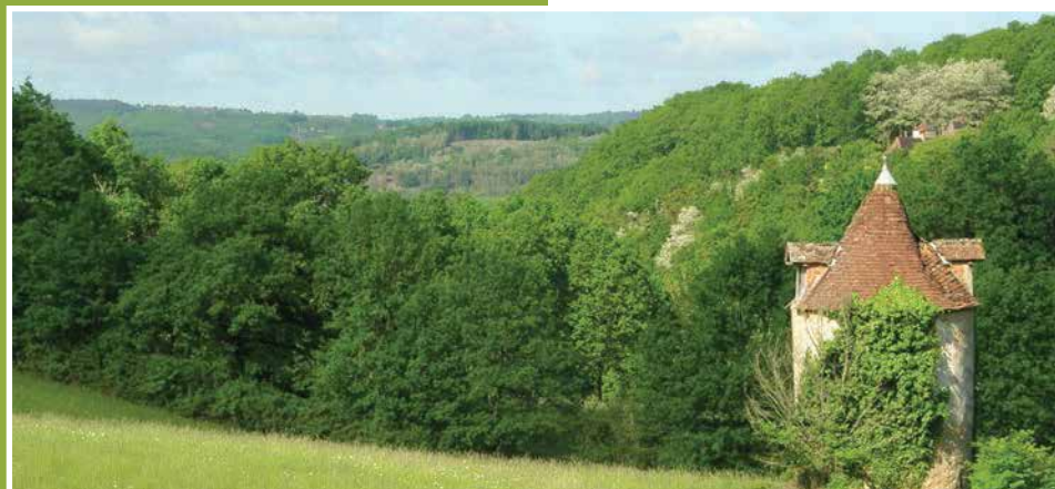
View near Castang

Butterflies on the wing in mid-May include scarce and common swallowtails, black-veined and wood whites, Cleopatra, Glanville fritillary, green hairstreak, large copper and small blue. Elegant yellow and black ascalaphids – something between a lacewing and an ant-lion – hunt over meadows. Other invertebrates include violet carpenter bee and hummingbird hawkmoth. After dark, a short walk away, midwife toads are carrying their eggs.