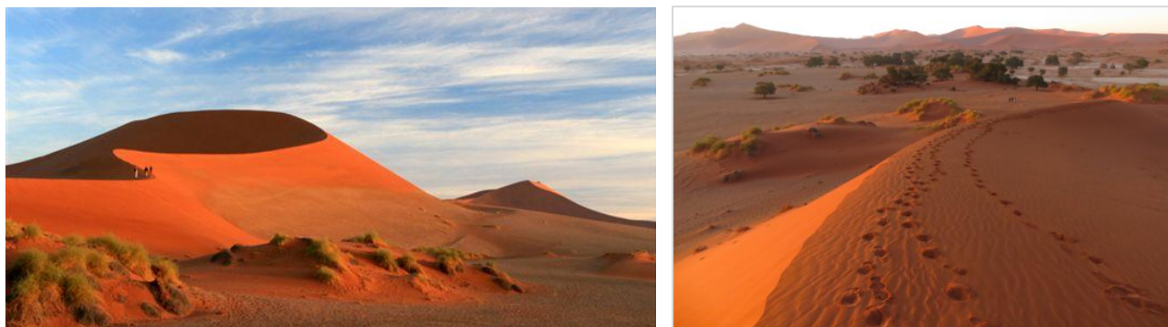
Sand dunes at Sossusvlei, and the view from the top. (KA)

We started the day way before dawn at 04:30 with a cup of coffee and a rusk. The small moon was over the horizon so we had some fantastic stars to look at: the Southern Cross, Orion's Belt, the Milky Way. The plan was to be at the dunes for sunrise to catch the beautiful colours, so the one-hour drive from the lodge to the dunes of Sossusvlei was in the dark. We jumped onto a 4x4 Landrover to take us through the sand to Sossusvlei. We climbed part way up the main big dune to get a better view of the changing light and colours on the red sand dunes, and Karin made it to the top.