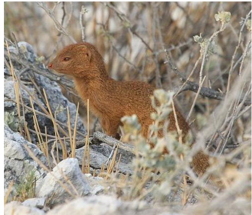
White-bellied sunbird, Damara Dik-dik and slender mongoose.