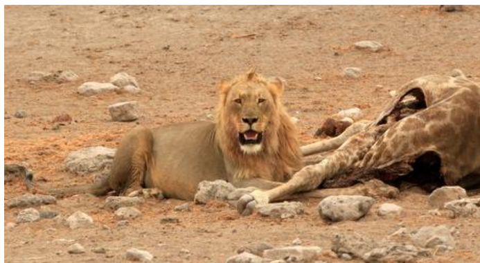
Left: Ostriches, Burchell's Zebras, Blue Wildebeest and Impala at a waterhole in Etosha NP. Right: lion on a Giraffe kill. (GC)

Our late afternoon drive to various waterholes rewarded us with a few new birds: Marabou Stork, Cattle Egret, a beautiful Bateleur drinking at the water's edge, Namaqua Sandgrouse, Banded Martin, Lesser Grey Shrike, Red-backed Shrike and Wattled Starling were new. The Lions at the Chudop waterhole were now three and were still being very lethargic, so we spent some time watching a band of Banded Mongooses searching for food. Later on a Barn Owl and Rufus-cheeked Nightjar were seen at the floodlit waterhole and a Cape Thick-toed Gecko was hunting insects around the outside lights of the rooms.