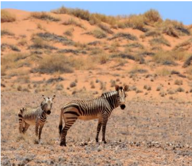
Hartmann's Zebras (GC)

Sossusvlei sand dunes, the big blue skies, Secretarybirds, Spotted Crake, seeing well over 200 bird species and 38 mammal species, reptiles ... the list goes on. Many photographs and thousands of great memories!