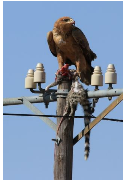
Tawny Eagle finishing off a Small Spotted Genet. (GC)

At 4pm we went out on a game drive to see what we could find. First stop was a couple of Black-backed Jackals, then a small herd of Burchell's Zebra. At the first waterhole (Klein Okevi) we found some Black-faced Impala and Springbok. The next waterhole (Groot Okevi) had a Spotted Hyena lying in the water with four thirsty Giraffes waiting to drink. At the Klein Namutoni waterhole we watched a total of 11 Giraffes, a couple of Spotted Hyenas in the water again and 3 Black-backed Jackals and a herd of 30+ Black-faced Impalas. The Impalas left the waterhole with impressive leaps and bounds. Damara Dik-dik and Slender Mongoose were seen on the Dik-dik Loop and a close encounter with a bull Elephant was had by all on the way back to the camp.