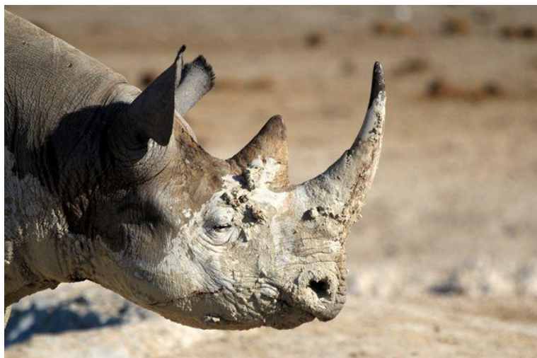
A Black Rhino having a mud bath in the white mud.

Again, we were up at dawn and the first vehicle out the gate. We drove out to Gemsbokvlakte waterhole and then back via the Nebrowni waterhole. We stopped to watch a Red-headed Falcon decapitate a small bird for its breakfast and a Slender Mongoose kept us entertained for a while. Just near to our camp we came across two Lions already sleeping in the shade of a bush.