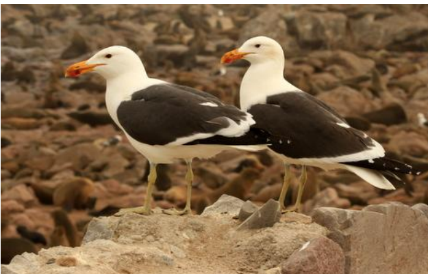
Kelp Gulls (GC)