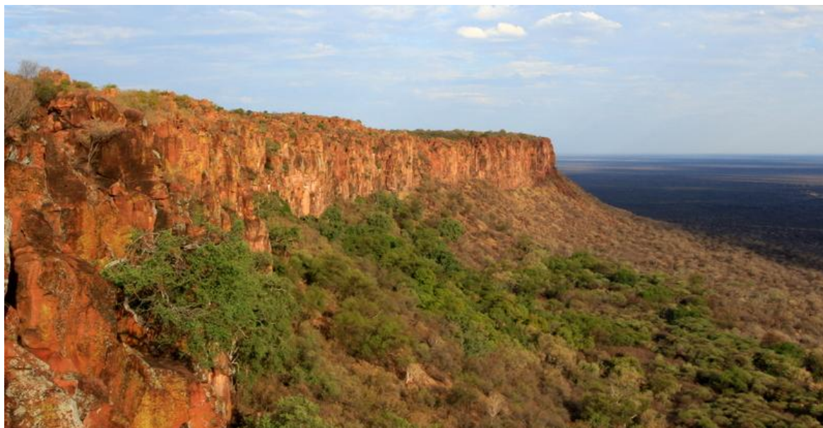
Waterberg National Park (GC)

After some R&R time we went for a walk through the forest below the sandstone cliffs. A group of Water Mongooses were foraging under the thick vegetation and a troop of Baboons was feeding in a huge old fig tree. Ruppell's Parrot, Rosy-faced Lovebirds, African Hoopoe, Fork-tailed Drongo, Red-billed Francolin, Crimson-breasted Shrike, Grey Turaco, Purple Roller, Burchell's Starling, Common Scimitarbill, Greater Blue-eared Starling and Groundscraper Thrush were seen during the course of the afternoon.