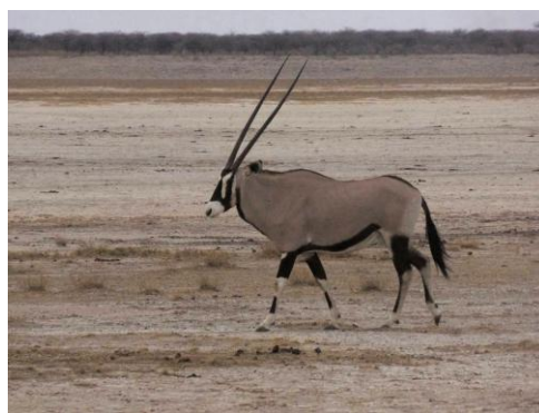
In Etosha NP – a Northern Black Korhaan casts a shadow; and a Southern Oryx (Gemsbok).

We stopped at Springbokfontein, Goas, Rietfontein, Salvadora, Sueda and Nebrowni waterholes on the way to Okaukuejo Camp. Secretarybird, Greater Kestrel, South African Shelduck, Red-billed Teal, Red-crested and Northern Black Korhaan, Black-winged Stilt, European Swift, Black and Pied Crow, Familiar Chat, Rattling Cisticola and Yellow-bellied Eremomela were all new to us. Sociable Weavers had a huge communal nest in the camp by the waterhole.