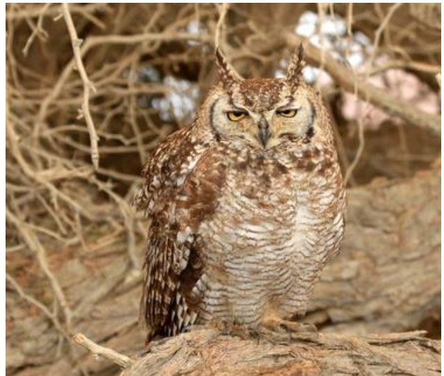
Spotted Eagle Owl (GC)