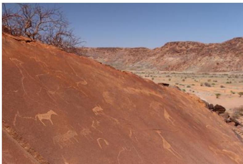
Rock engraving at Twyfelfontein World Heritage Site. (GC)

At the actual spring we saw quite a few birds, with Lark-like Bunting and White-throated Canary both being new for our trip list. We also saw a Boulton's Namib Day Gecko near the spring and Namibian Rock Agamas and Striped Skinks around the rock engravings.