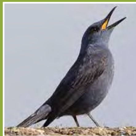
Blue rock thrush