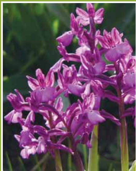
Orchis boryi - Spili

Crete is a magical and mysterious island. Home of Europe's earliest civilisation, influenced by many nations, yet it retains its own identity and culture of which its people are justifiably proud.