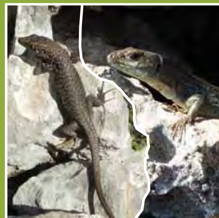
Greek rock lizard (L) and Peloponnese wall lizard (R)