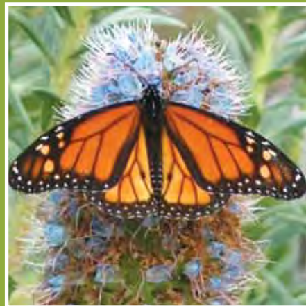
Monarch on pride-of-Madeira