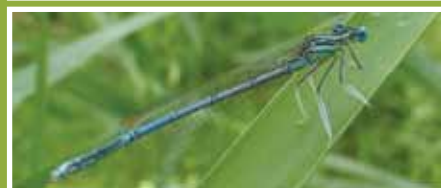
Silver washed fritillary; white-legged damselfly.