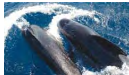
Long-finned pilot whales

The Strait of Gibraltar is a vital migration route for seabirds and cetaceans and, weather permitting, the holiday will include a boat trip into the Strait to look for these. Dolphins and long-finned pilot whales are likely and there's a chance of sperm whale.