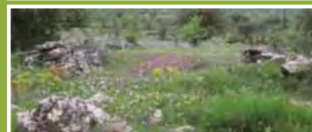
Corinth canal; Aegean coast; spring flowers.

More information visit www.honeyguide.co.uk 7