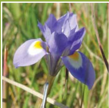
Barbary nut iris