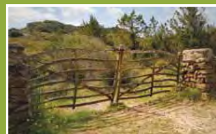
Narcissus serotinus ; Menorcan olive wood gates

More information visit www.honeyguide.co.uk 13