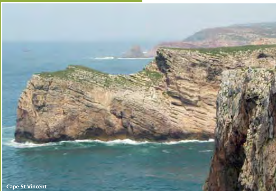
Cape St Vincent