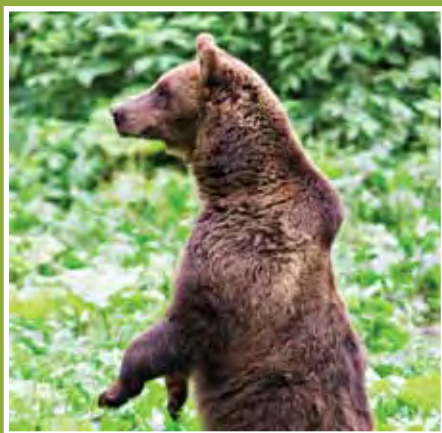
Brown bear, a highlight of the Carpathians