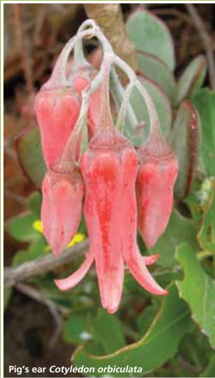
Pig's ear Cotyledon orbiculata