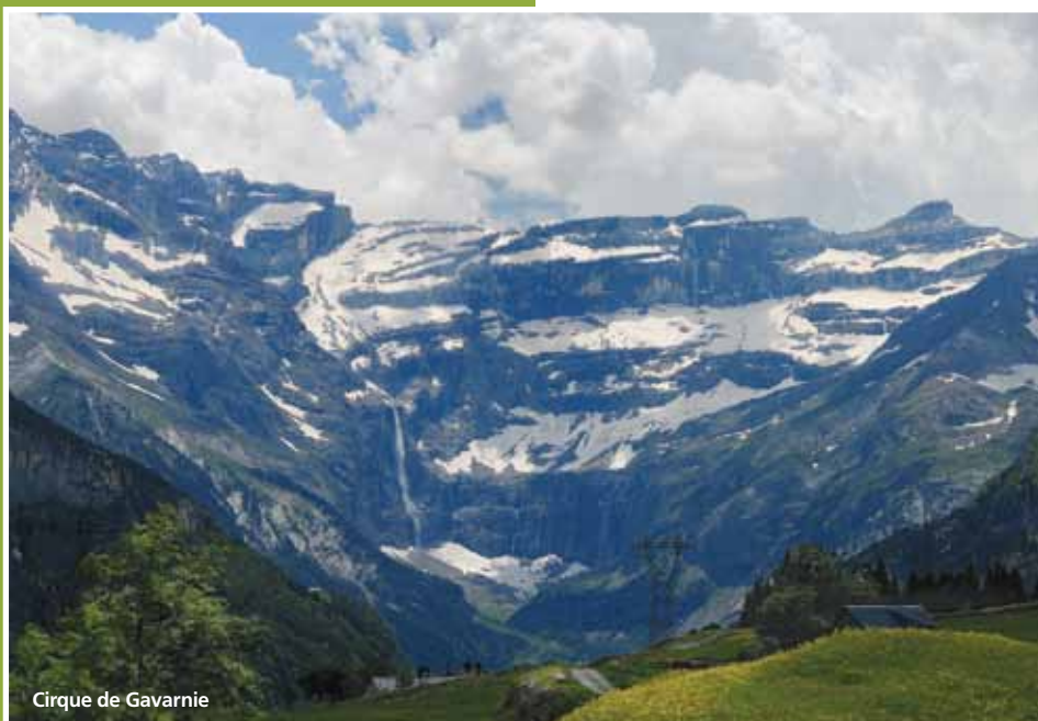
Cirque de Gavarnie