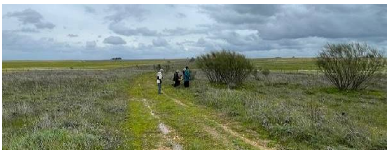
Exploring the drovers' trail (MK).

We returned to the plains to the north and stopped for a walk on a drover's trail "Cañada Real". On this strip of land, established 700 hundred years ago as common land, we found a superb colony of Sawfly Orchids. The fields beside the trail, were ablaze with mayweed flowers, looking like a dusting of snow. We moved southwards towards Trujillo, making a stop in the beautiful berrocal , a landscape dominated by granite outcrops. The flowering plants here were superb with Spotted Rockrose and the delightful Dwarf Pansy. A Merlin was seen perched on a stone in a field.