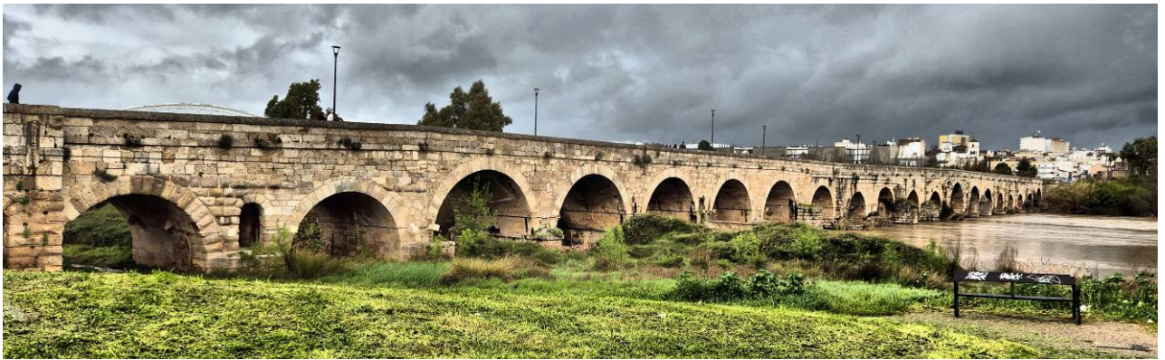
The Roman bridge at Mérida (DB).

More Spoonbills were seen downstream, as well as two flocks of Cormorants and a pair of Little Ringed Plovers. With no obvious break in the weather on the horizon, we returned to base, arriving at 16.00.