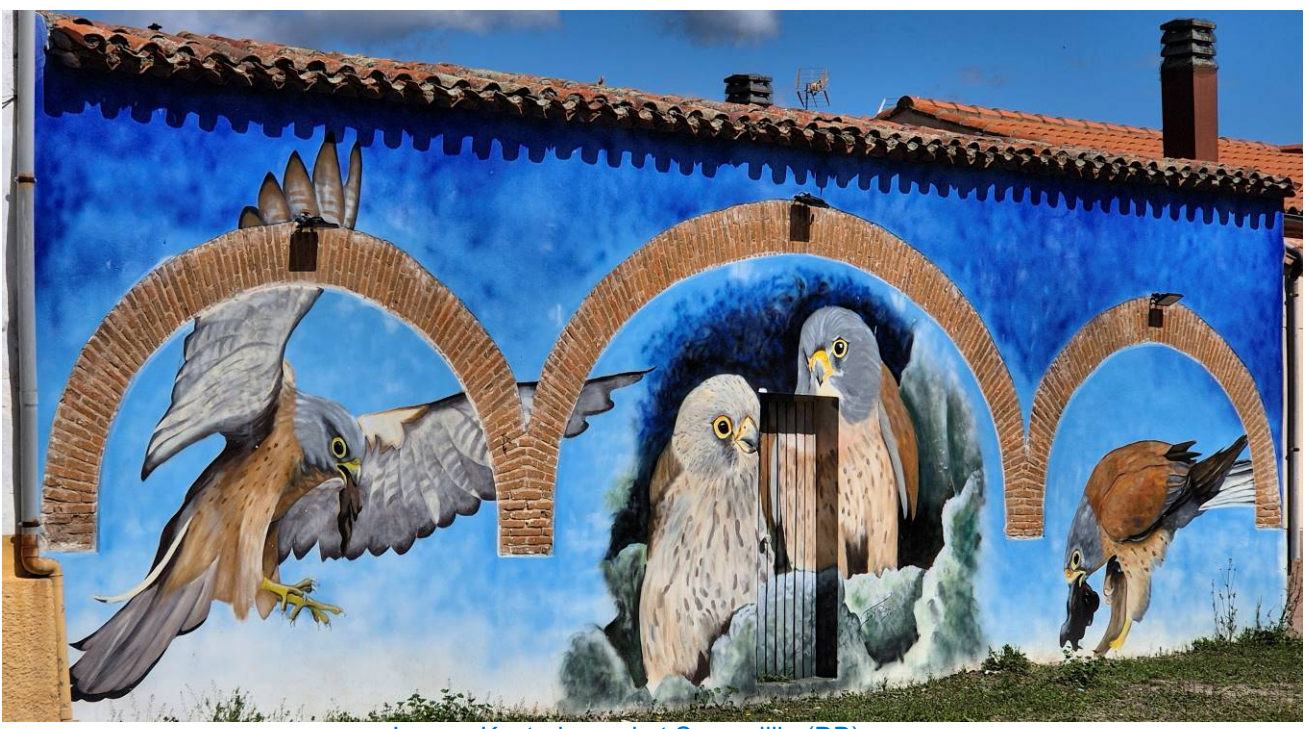
Lesser Kestrel mural at Saucedilla (DB).

In Saucedilla itself, we stopped to admire the beautiful mural of herons and egrets, the old church along with its colony of Lesser Kestrels.