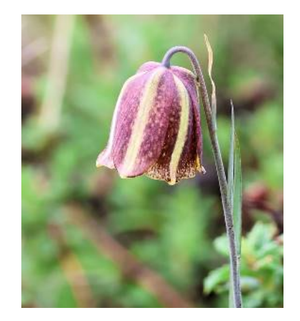
Iberian fritillary (DB).

Fritillaria lusitanica Iberian fritillary (2152)