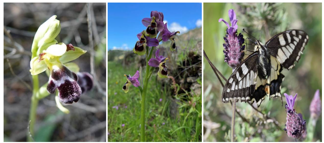
Hairy Bee Orchid Ophrys dyris and a magnificent Sawfly Orchid (MK); Swallowtail on French Lavender (DB).

After coffee nearby, we moved southwards a short distance to the hills beside Sierra de Fuentes. We had a superb walk though dehesa and then into Mediterranean scrub, on limestone, as the presence of Kermes Oak testified. We were not disappointed by the orchids with Sawfly, Conical, Woodcock, Naked Man, Champagne and Hairy Bee Orchid all present. The last is a very localised species in Extremadura and we found it exclusively under thick wild rosemary bushes, possibly as a way to escape the rooting of Wild Boar, which was abundant on the hillside. Butterflies included a Spanish Festoon and Green Hairstreak.