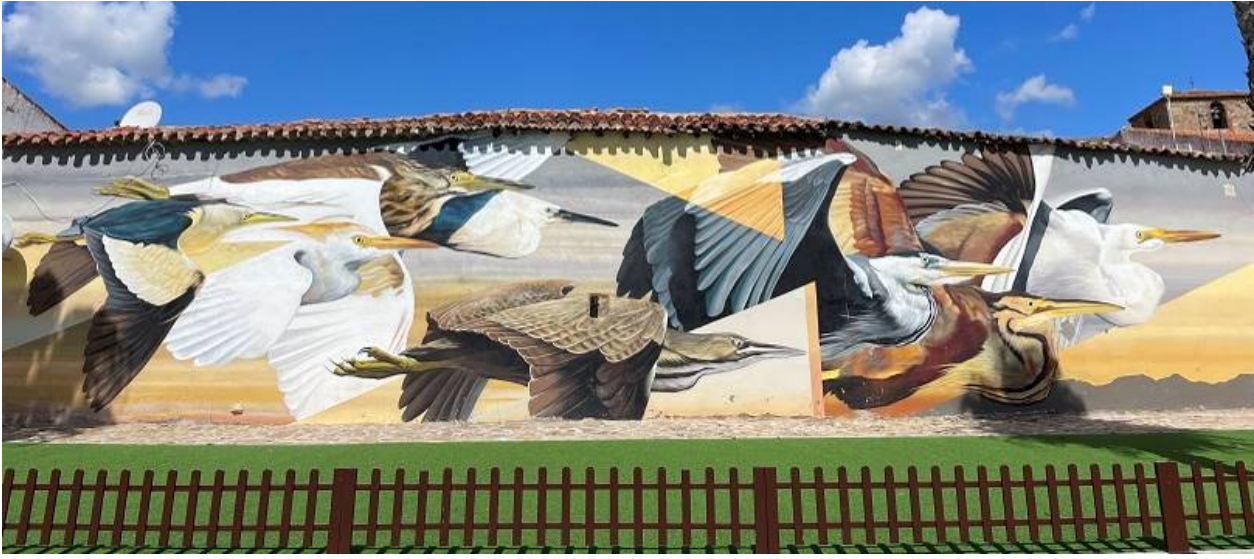
The beautiful mural at Saucedilla (MK).

Above: group photo, taken at Casa El Recuerdo; Stonechat (DB); Spanish Sparrow (DB).