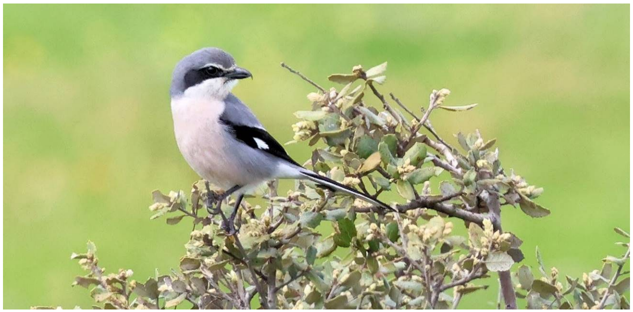
Iberian Grey Shrike.

At Campo Lugar we had our coffee, enjoying the sight of dozens of House Martins around their colony on a silo building.