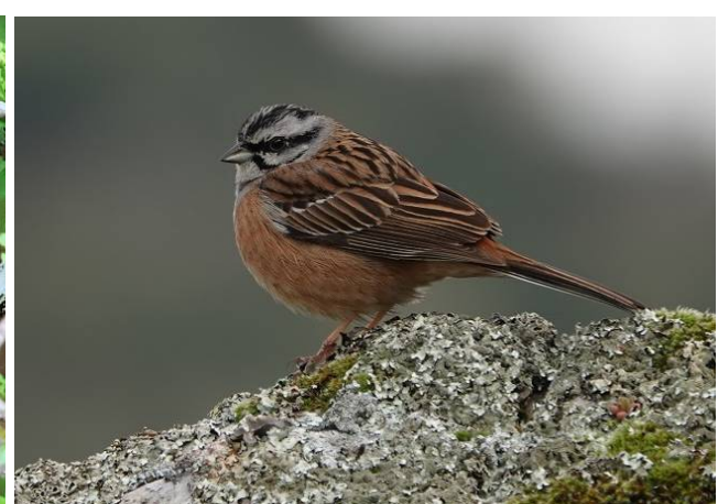
Sardinian Warbler (BD); Rock Bunting (MK).

Small birds also gave us great views, such as a very obliging Rock Bunting and a pair of Blue Rock Thrushes. Three Sardinian Warblers were delightful, while a male Subalpine Warbler generally kept in cover. Crag Martins and Red-rumped Swallows passed close-by. Spanish Adenocarpus was flowering by the road.