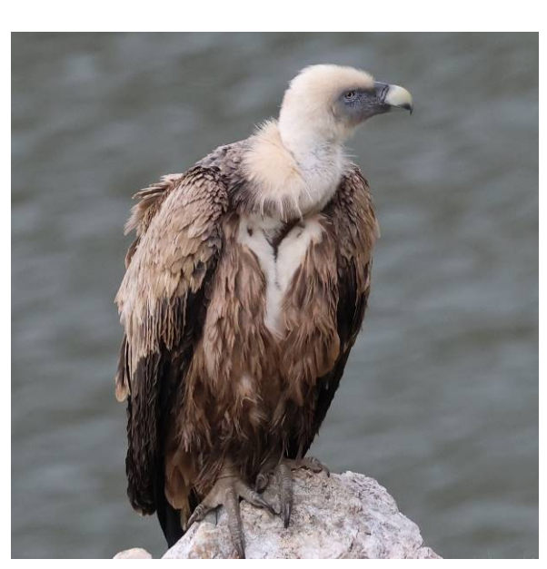
Griffon Vulture (DB)