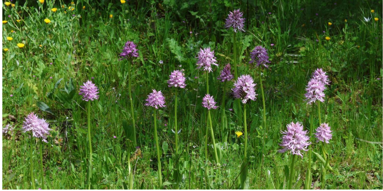
Naked Man Orchids (DB).

We then left the area to visit the hill above the town of Almaraz. On this area of limestone and old olive groves, we had the very special experience to seeing a profusion of orchids at their best, looking proud and vigorous thanks to the recent rains. Naked Man Orchid was the most abundant, but we also found Conical, Yellow Bee, Mirror, Woodcock and Champagne Orchids. This was an ideal spot for a picnic too.