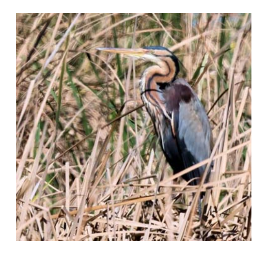
Purple Heron (DB)

Ringed Plover Golden Plover Seen at Arrocampo. Seen on the plains. Seen at Alcollarín.