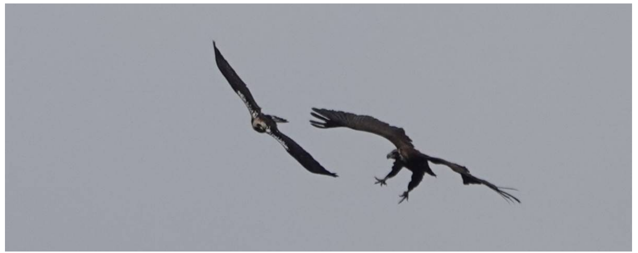
Dogfight between a Spanish Imperial Eagle and a Black Vulture (MK).

There had been some rain overnight, but by the time we set off it was dry and remained so all day. There were periods of fresh south-westerly winds, but also some sunny spells which broke up the otherwise solidly overcast sky. We spent the first part of the morning on the plains west of Trujillo. The expanse of pseudosteppe habitat was bordered by dehesa , which lay to the south of us. The immediate impression was a surround of sound from singing Calandra Larks and Corn Buntings. sometimes joined by Crested and Thekla Larks. We had good views of all of these species. As we were arriving a group of Great Bustards had flown across the road, heading south. Luckily some individuals were still present in the area we had entered, and we had good, if albeit distant, views of a small group feeding in the meadow.