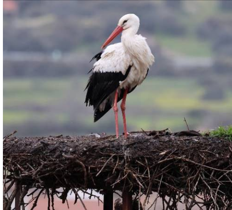
Trujillo; white stork on nest in Trujillo.

There had been heavy rain during the night, but it had abated by breakfast time. As we left the village, we paused at the entrance to watch a party of Hawfinches that were feeding alongside Corn Buntings and Blackbirds, turning over leaf litter in a small plantation of trees. While we were there a Lesser Spotted Woodpecker was seen briefly, as well as Iberian Magpie and Greenfinch. We stopped at the edge of Trujillo to watch Lesser Kestrels at their breeding colony in the old silo building. A few Pallid Swifts were also seen high against the darkening skies. We moved to the old part of town and walked into the Main Square and continued to explore the medieval part of the town, ascending to the Arab fortress and then back to the square. A welcome coffee in a small bar on the square was followed by some holiday shopping.