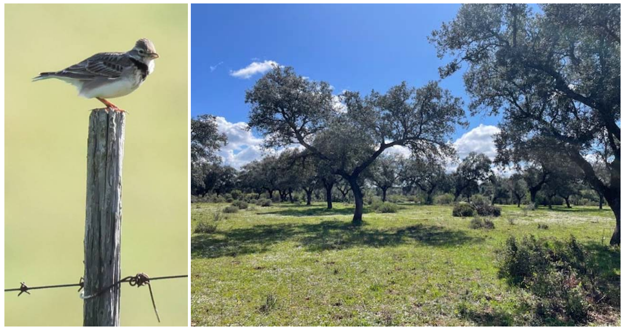
Calandra Lark ; the Dehesa at Sierra de Fuentes.

After coffee nearby, we moved southwards a short distance to the hills beside Sierra de Fuentes. We had a superb walk though dehesa and then into Mediterranean scrub, on limestone, as the presence of Kermes Oak testified. We were not disappointed by the orchids with Sawfly, Conical, Woodcock, Naked Man, Champagne and Hairy Bee Orchid all present. The last is a very localised species in Extremadura and we found it exclusively under thick wild rosemary bushes, possibly as a way to escape the rooting of Wild Boar, which was abundant on the hillside. Butterflies included a Spanish Festoon and Green Hairstreak.