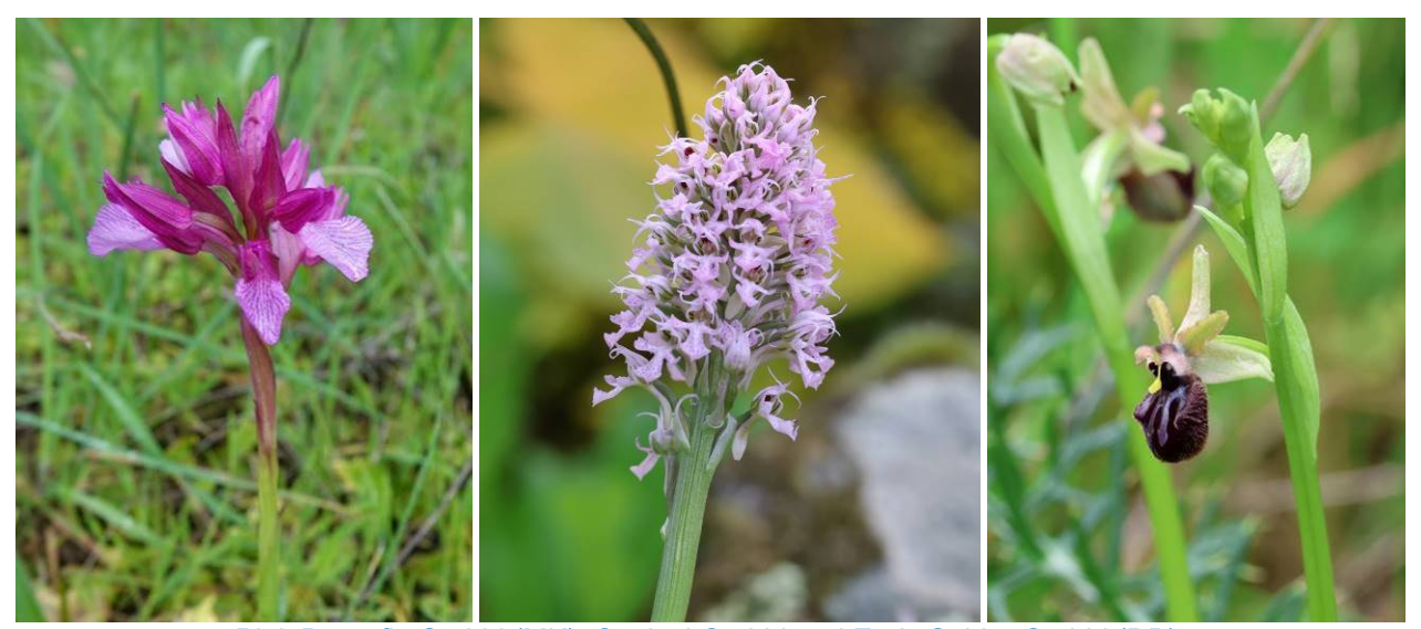
Pink Butterfly Orchid (MK); Conical Orchid and Early Spider Orchid (DB).

We then attempted to start a walk on the southern side of the rock but soon turned back because of the rain. A Quail calling close to us was the only thing of note. We moved to the Jabata Valley, a beautiful spot with dozens of Green-winged Orchids and Lusitanian Fritillaries, as well as several species of rock rose. Sadly, we had little more than a quarter of an hour to take them all in before the rain started again.