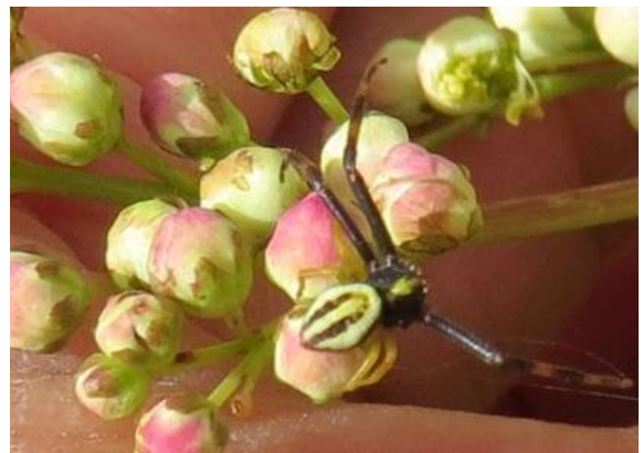
Misumena vatia (male)