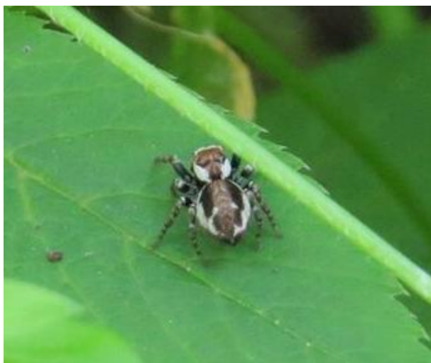
Evarcha falcata - a jumping spider