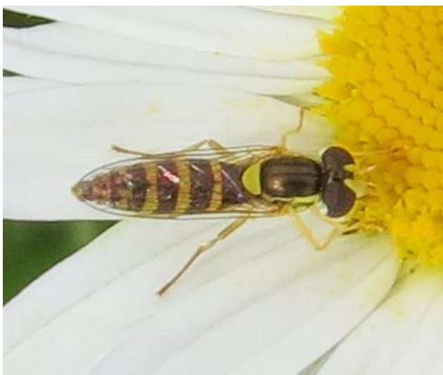
Sphaerophoria cf. scripta