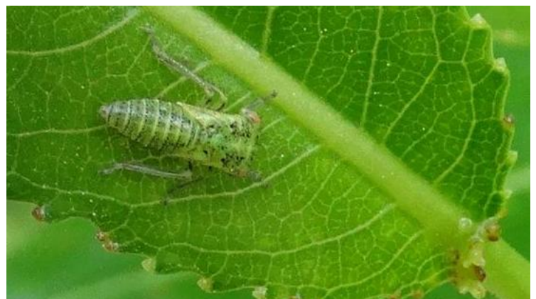
A cicadellid nymph

While leafhoppers often have distinctive dark markings on the head, thorax or wings, there are no readily available guides to the huge number of European species.