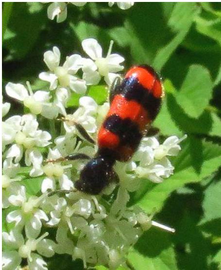
Trichodes aparius (Cleridae)