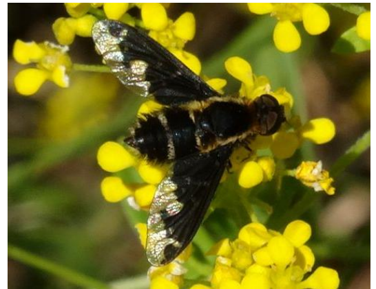
Right: Hemipenthes maura