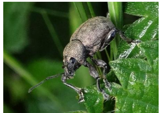
Right: Weevil sp.