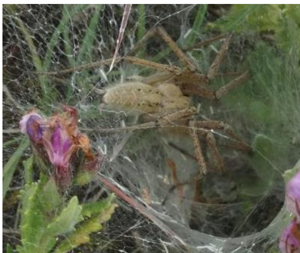
Agelena orientalis – a funnel-web spider

The rest of the spiders here are single species from a diverse range of families, characterised by different hunting or feeding habits: