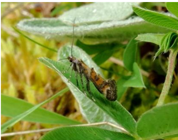
? Mompha sp. ?

Finally, a couple of attractive micros which have hitherto evaded our effort at identification: