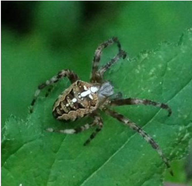
Garden Spider Araneus diadematus

Another well-known family, masters of the art of web construction, are the orb-web spiders :