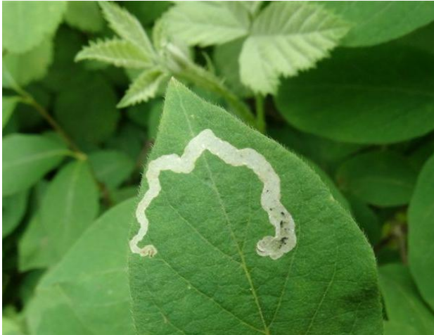
Aulagomyza cornigera on Honeysuckle

Leaf-miners come from several Orders of insects, including Lepidoptera, Coleoptera and Diptera: the ones shown here are all fly mines.