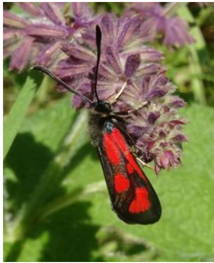
Slender Scotch Burnet Zygaena loti