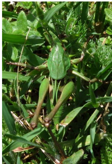
Wart-biter Decticus verrucivorus