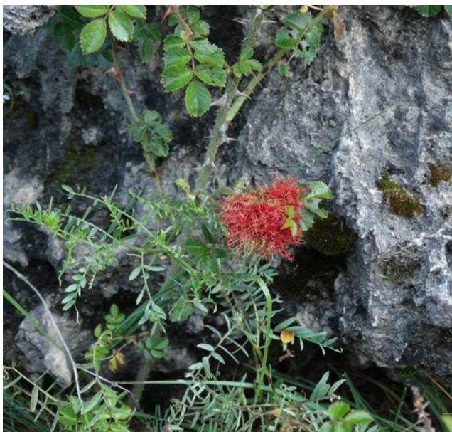
Robin's-pincushion Diplolepis rosae on Rose