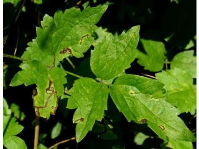
Phytomyza fulgens on Wild Clematis