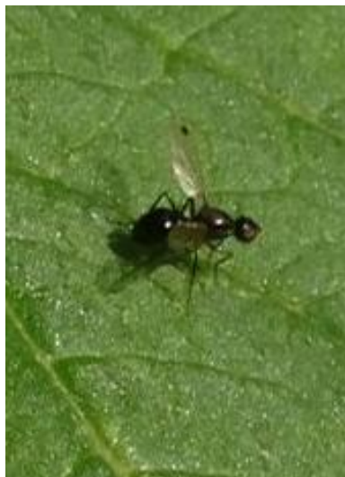
Sepsis sp. an Ensign-fly ( Sepsidae )