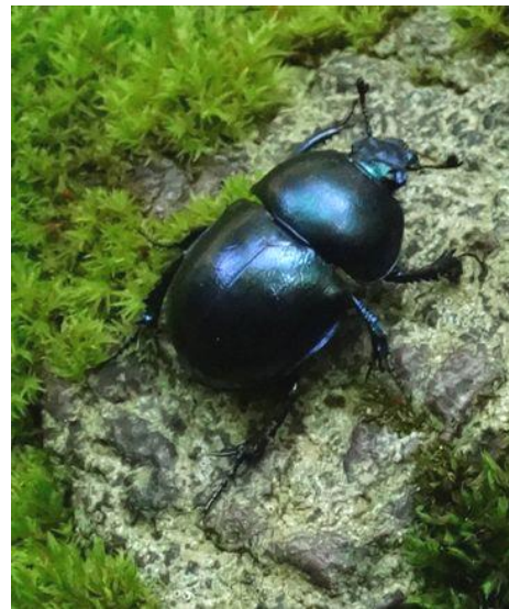
Trypocopris vernalis (Geotrupidae)