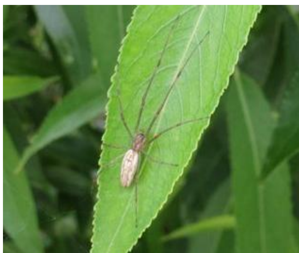
Tetragnatha extensa – a stretch-spider