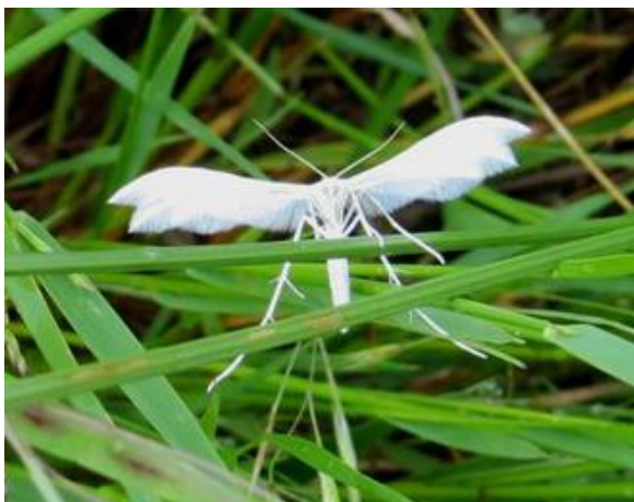
Large White Plume Pterophorus pentadactylus