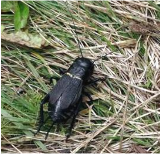
Field Cricket Gryllus campestris

Field Crickets are ubiquitous, although more often heard than seen: