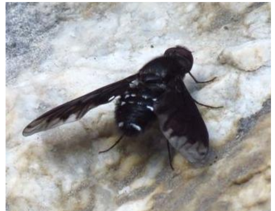
Right: Anthrax anthrax