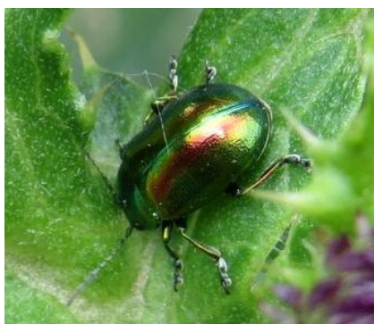
Chrysolina graminis Tansy Beetle

Sometimes large, with often bright or metallic colours, but there are very many of them. Food plant is a good clue to identity. Flea-beetles have swollen, muscular hind-legs, allowing them to jump well.