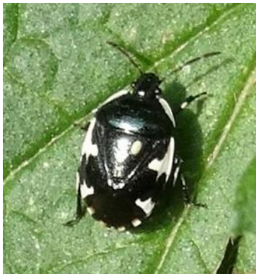
Tritomegas sexmaculatus Rambur's Pied Shield-bug