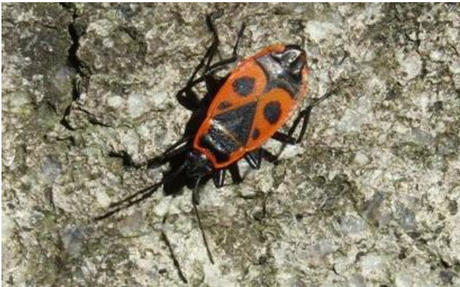
Pyrrhocoris apterus Firebug (adult)