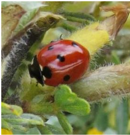
Coccinella septempunctata 7-spot ladybird

Well-known beetles, usually feeding upon aphids and other insects. Some species are notoriously variable in colour and spotting.