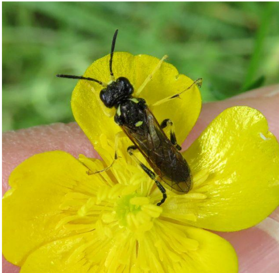
A sawfly Tenthredo cf. mesomela