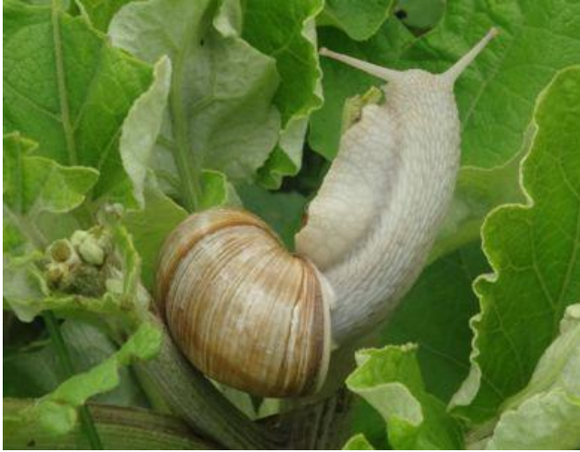
Roman Snail Helix pomatia

Just a couple of species we were able to identify, one very familiar and readily recognisable by virtue of its size.