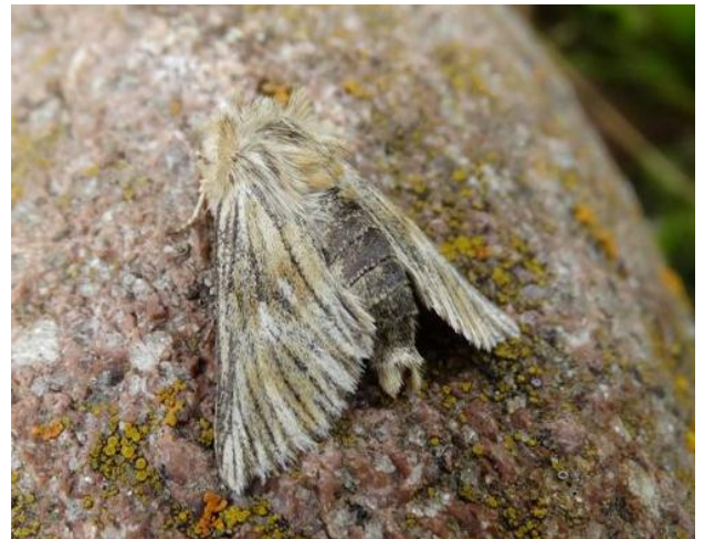
Right: Carnation Cleophane Teinoptera olivina