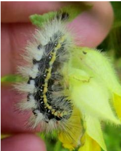
Left: Acronicta cinerea

Likewise many of the Macromoths are to be found in the British and western European guides, so the ones shown here are those which are not. That is, apart from the burnets (including foresters) and superficially similar nine-spotted, which are notoriously variable and often difficult to identify – all of those we photographed are shown.