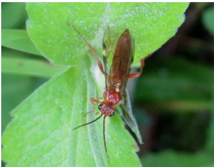
? A solitary wasp ?