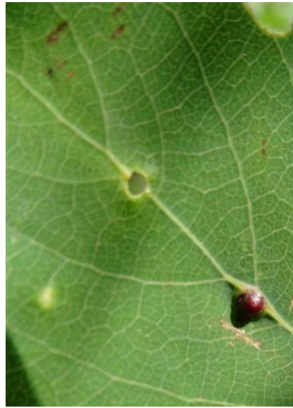
Phyllocoptes populi on Aspen