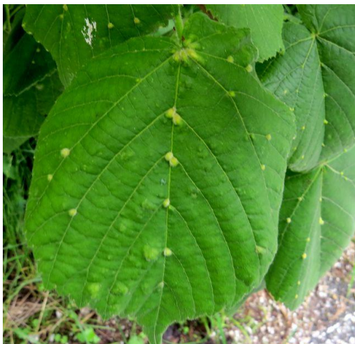
Aceria exilis on Lime