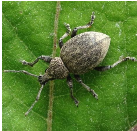
? Otiorynchus sp.