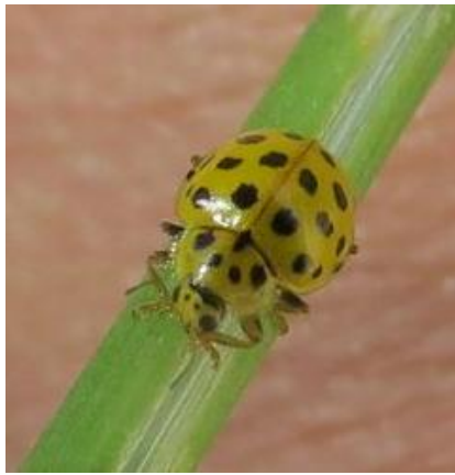
Psyllobora vigintiduopunctata 22-spot ladybird