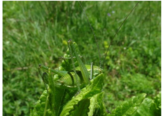
Leptophyes cf. albovittata