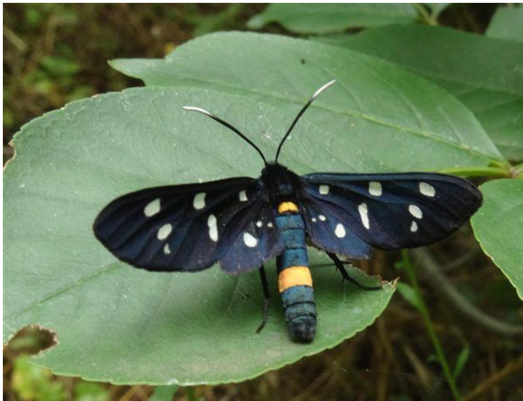
Nine-spotted Moth Syntomis phegea