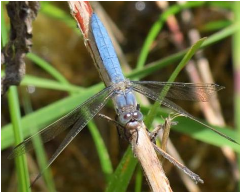
Southern Skimmer Orthetrum brunneum

Although well covered in several books, the Odonata of the region include several less familiar forms and species among those we see at home.