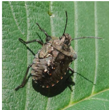
Pentatoma rufipes (nymph) Forest Bug