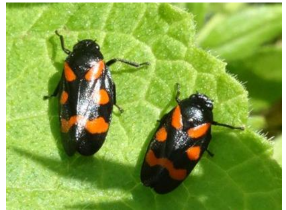
Cercopis vulnerata ( Cercopidae )

Froghoppers in the Aphrophoridae are often conspicuous as nymphs: they secrete the surplus plant fluids as 'cuckoo-spit', defence for the soft-bodied nymphs against environmental extremes. Those fluids are considered to be surplus as they need to process large volumes of the sap in order to gain sufficient nitrogenous compounds for growth.