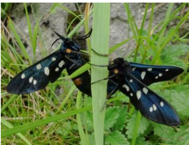
Krueger's Nine-spotted Moth Syntomis kruegeri