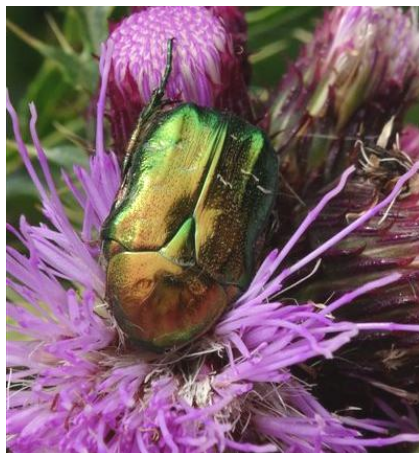
Cetonia aurata Rose chafer

Rather dumpy, sometimes quite large beetles, chafers are distinguished by their antennae, the end segments of which are expanded into flattened plates which lie together, giving the appearance of a terminal club. Chafer larvae are generally subterranean grubs, feeding on roots.