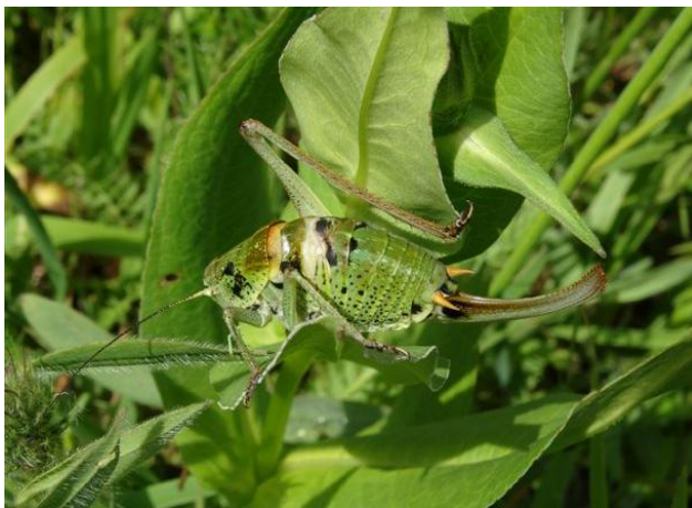
Saw-tailed Bush-cricket Polysarcus denticauda