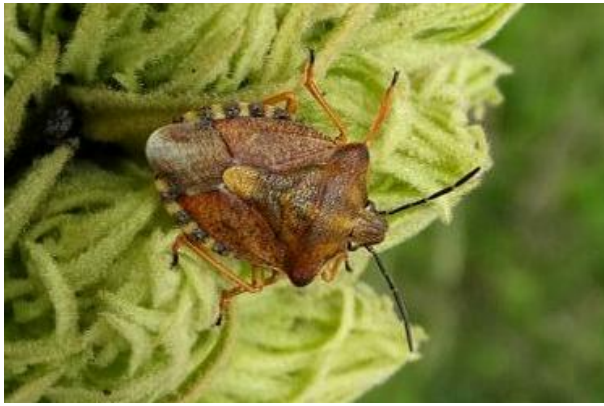
Carpodis purpureipennis (adult)