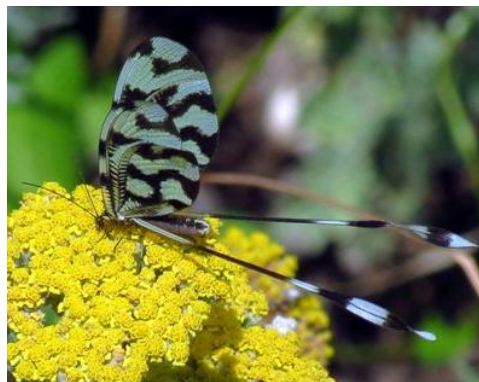
Pennant-winged Ant-lion Nemoptera sinuata