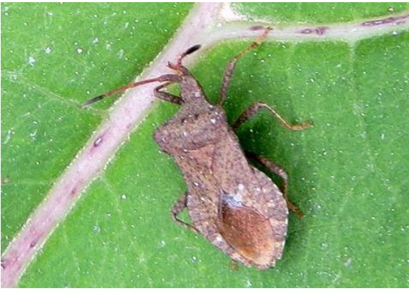
Coreus marginatus Dock Bug