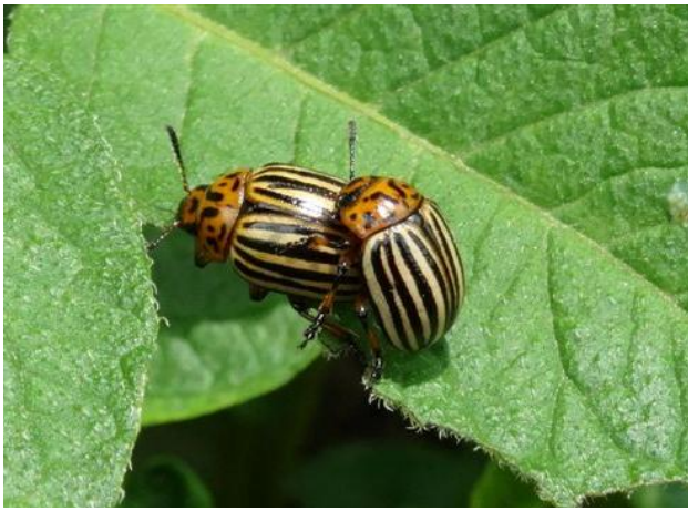
Leptinotarsa decemlineata Colorado Beetle