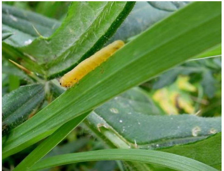
A sawfly larva