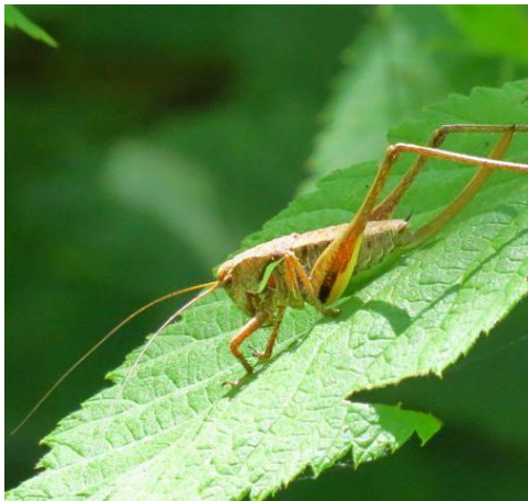
Pholidoptera aptera female

But the bush-crickets are most noticeable, and most easily photographed: