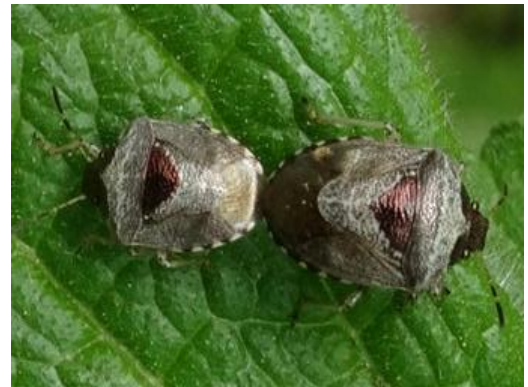
Eysarcoris venustissimus Woundwort Shield-bug