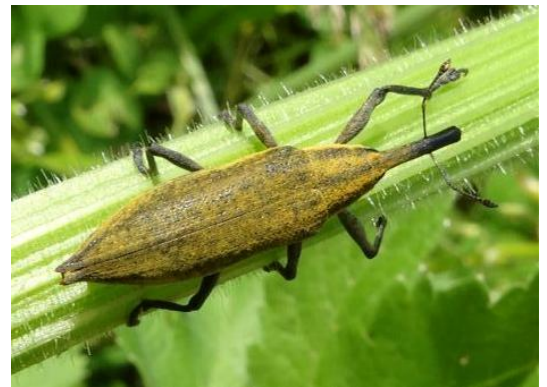
Right: Another Lixus sp.