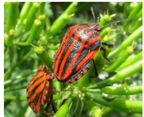
Graphosoma italicum 'Millwall Bug'

The two species above are example of insects which show typical red-and-black warning colouration, alerting potential predators to their noxious defensive chemicals. There are also several examples of this in other bug families (see next page).