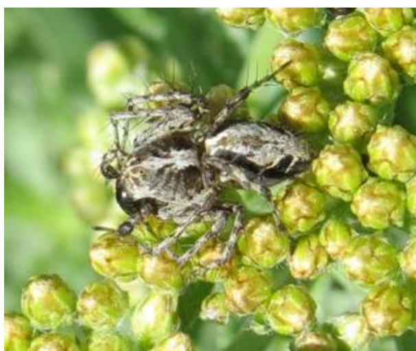
Oxyopes heterophthalmus – a lynx-spider