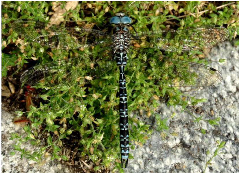
Eastern Spectre Caliaeschna microstigma