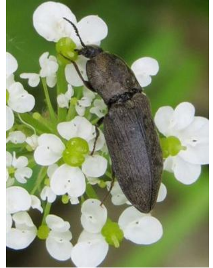
A click beetle (Elateridae)