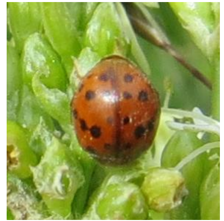
Subcoccinella vigintiquatuorpunctata 24-spot ladybird