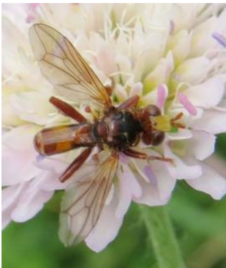
Sicus ferrugineus a Thick-Headed Fly ( Conopidae )