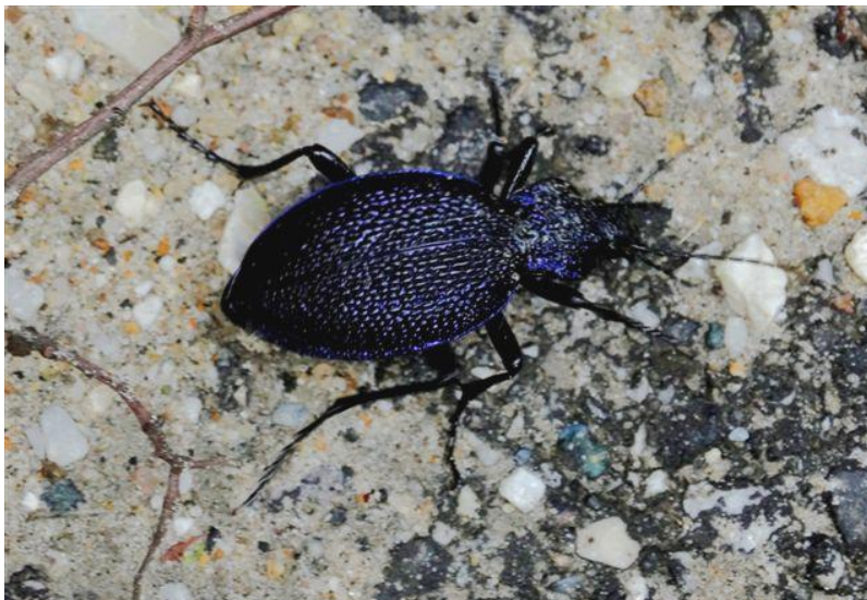
Carabus intricatus (Carabidae)