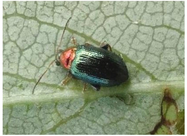
Crepidodera aurata Willow Flea-beetle