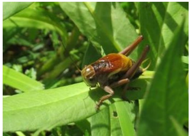
Psorodonotus fieberi Abundant in the Rhodope Lily field at Stoykite