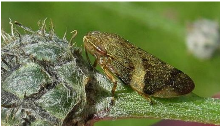
Aphrophora alni Alder Spittle-bug ( Aphrophoridae )

All of the families above are members of the Sub-Order Heteroptera , in which the front wings of the adult are partly leathery and partly membranous. The remaining families are in the 'Homoptera', in which the front wings are either all hardened or all membranous. 'Homoptera' consists of two Sub-Orders: Auchenorrhyncha (cicadas and hoppers, as below, whose forewings are usually leathery and pigmented) and Sternorrhyncha (aphids, plant lice, white-flies and scale-insects, which, if they have wings, are all membranous, and often lack significant pigmentation). Also, the Auchenorrhyncha have short, bristle-like antennae, whereas those of the Sternorrhyncha are longer, and hair-like.