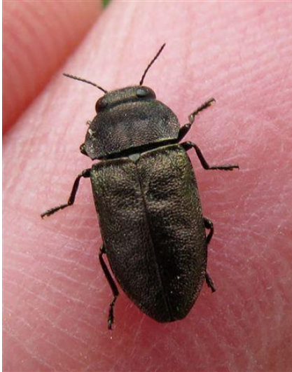
Anthaxia helvetica (Buprestidae)

The ground-beetle Carabus intricatus was one of the largest beetles we have ever seen, being around 4cm in length, with lovely purple reflections.