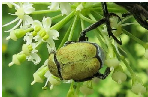
Left: Hoplia argentea