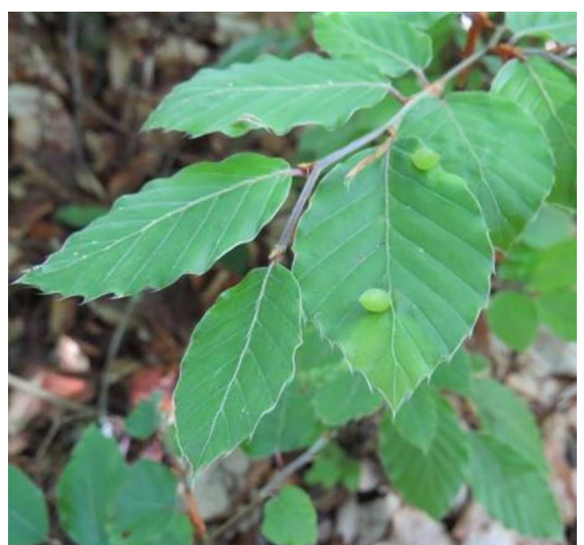
Mikiola fagi on Beech