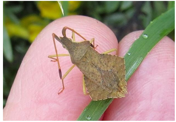
Syromastus rhombeus Rhombic Leather-bug