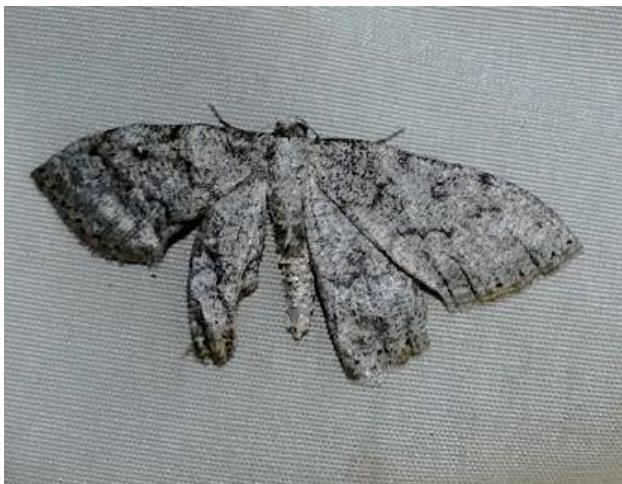
Mountain Marble Elophos dilucidaria