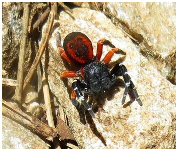
Ladybird Spider Eresus cinnaberinus