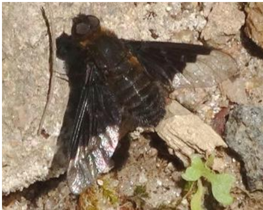
Left: Hemipenthes morio