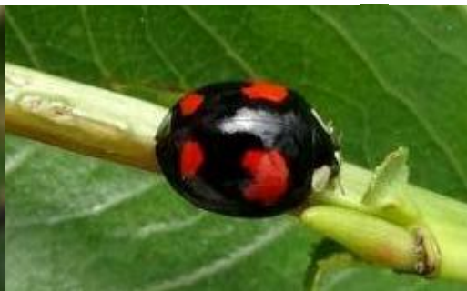
Left: Harmonia axyridis Harlequin Ladybird (two colour forms)