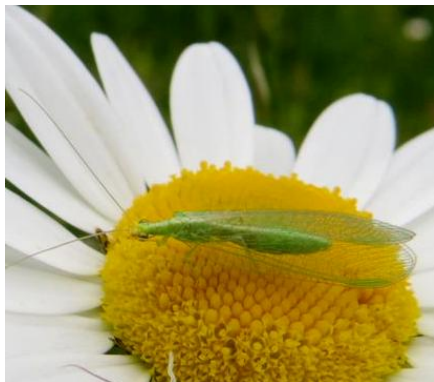
Chrysopa carnea a green lacewing

Species in the Order Neuroptera (lacewings and allies) range from the familiar (though very similar) green lacewings to the often colourful and dramatic ant-lions and ascalaphids. Ascalphids are most often seen whizzing around in sunny weather and rarely at rest. The unfortunate individual below right was dead and being demolished by ants, the ultimate act of revenge, given that its larvae are predators of ants.