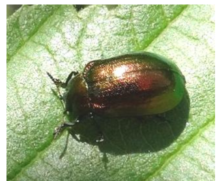
Chrysomela aenea Alder Leaf-beetle