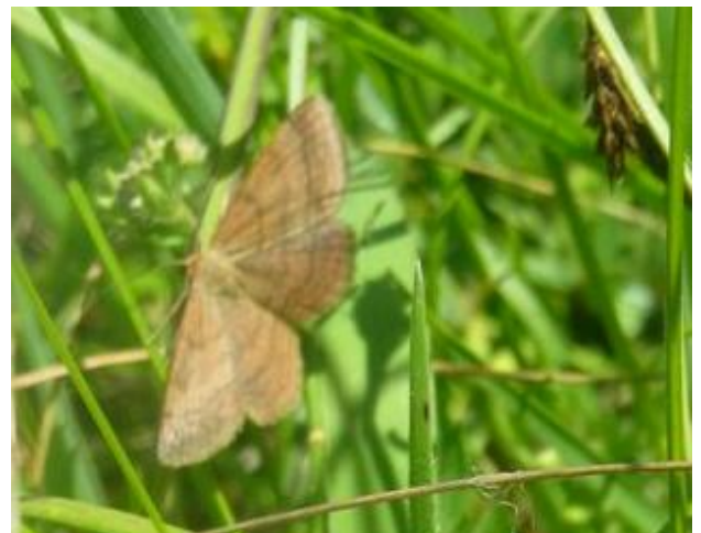
Dotted Wave Idaea rufaria