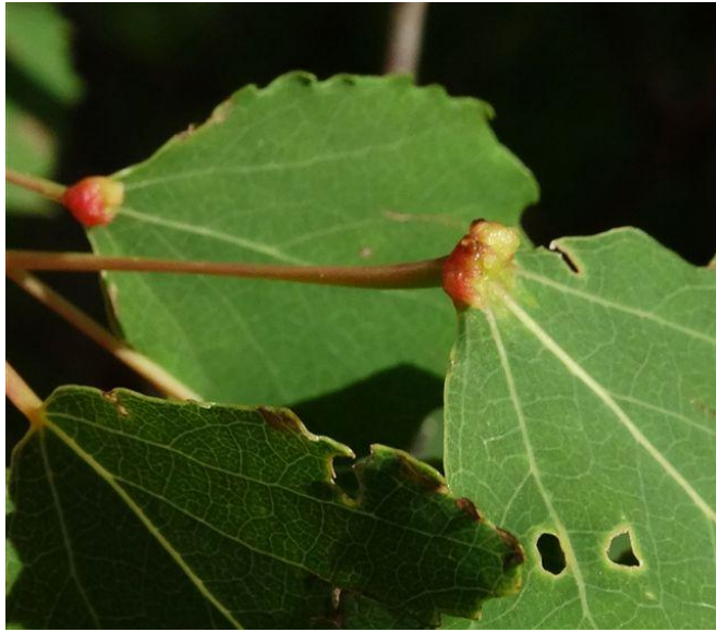
Eriophyes diversipunctatus on Aspen