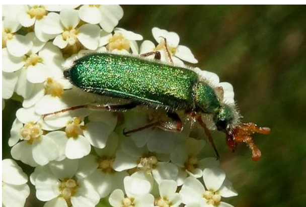
Cerocomma cf. schaefferi

A family named after the pungent oily liquid within their body, which can be secreted in defence against predators.