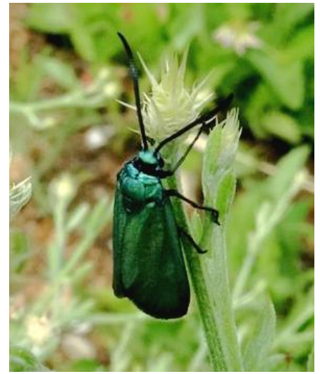
Scarce Forester Adscita globulariae