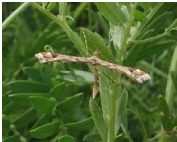
Triangle Plume Platyptilia gonodactyla