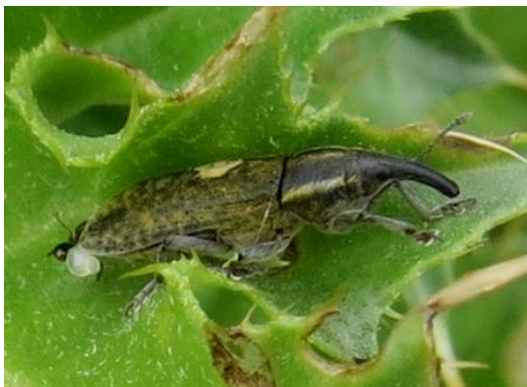
Left: Lixus sp.