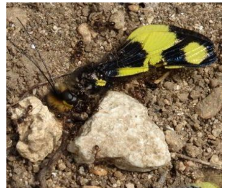
Libelloides macaronius an ascalaphid

Raphidioptera is a small Order of woodland insects which share a distinctive adult characteristic of an elongate thorax which can be held upright, resembling a striking snake, hence the name snake-flies.