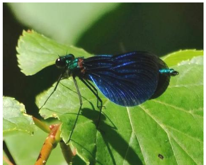
Southern Beautiful Demoiselle Calopteryx virgo meridionalis