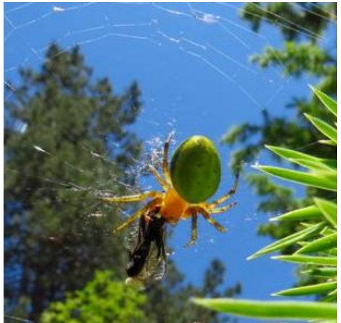
Cucumber Spider Araniella cucurbitina