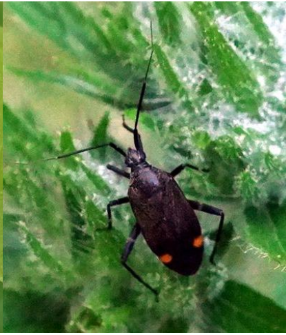
Deraeocoris ruber (two of several colour forms)