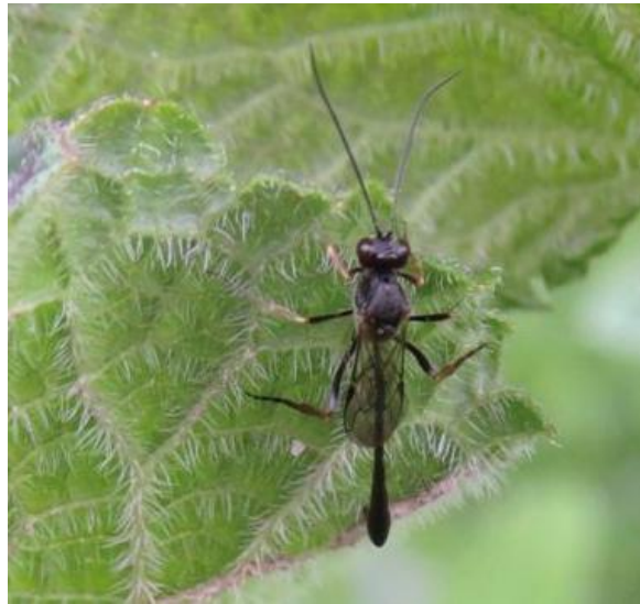
A parasitic wasp

Otherwise, there were numerous parasitic wasps, sawflies and solitary bees and wasps, all of which require considerably greater expertise than ours for identification.