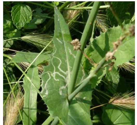
Right: Chromatomyia syngenesiae on Sow-thistle