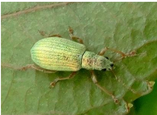
Left: Phyllobius sp.