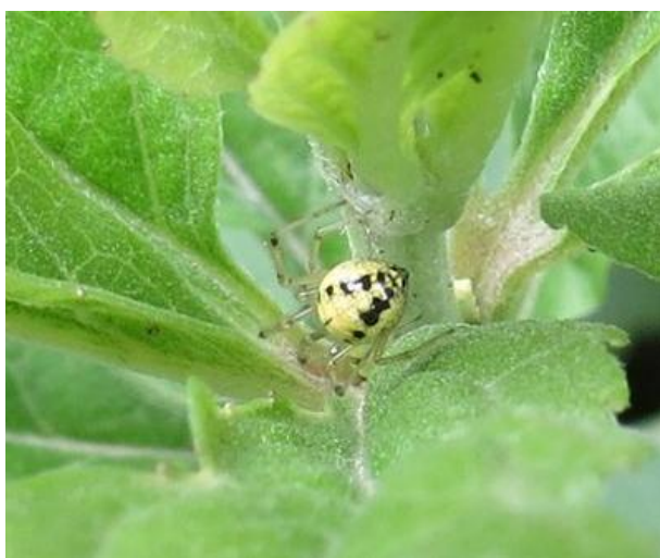
Enoplognatha ovata – a comb-footed spider. Also comes in white, red and striped forms.