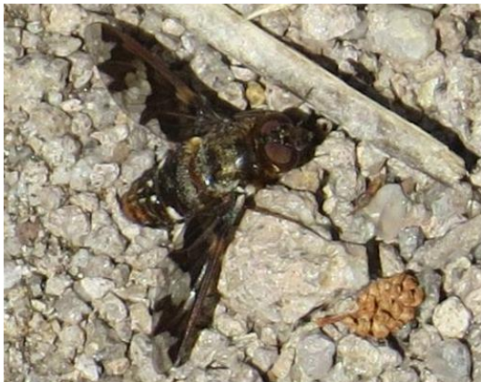
Left: Exoprosopa capucina