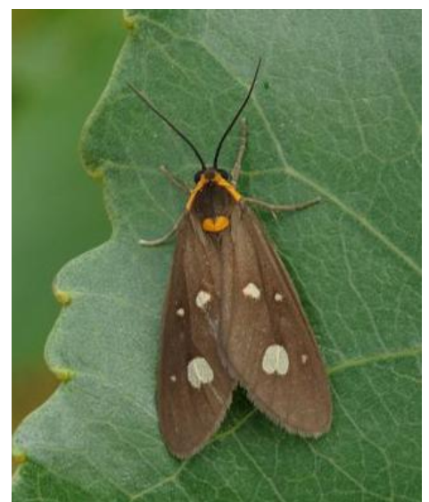
Hyaline Brown Burnet Dysauxes famula