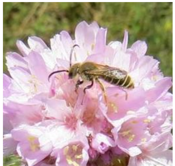
A long-horned bee Eucera sp.