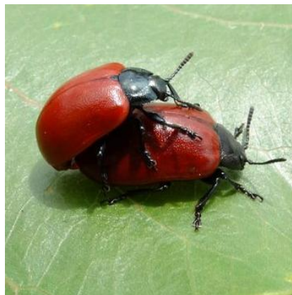
Chrysomela populi (adults) Red Poplar Leaf-beetle