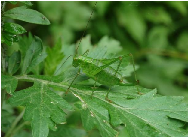
Speckled Bush-cricket Leptophyes punctatissima