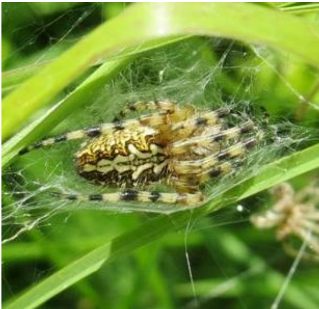
Oak spider Aculepeira ceropegia