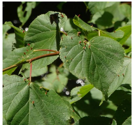
Nail-gall Eriophyes tiliae on Lime