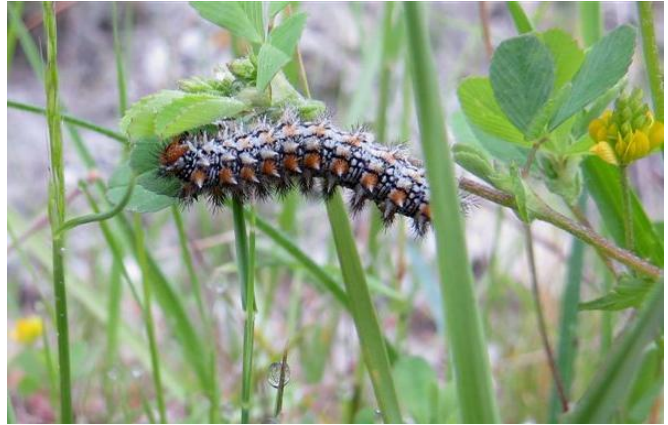
Above: Twin-spot Fritillary on Medick