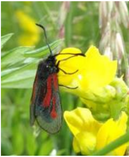
Woodland Burnet Zygaena osterodenis