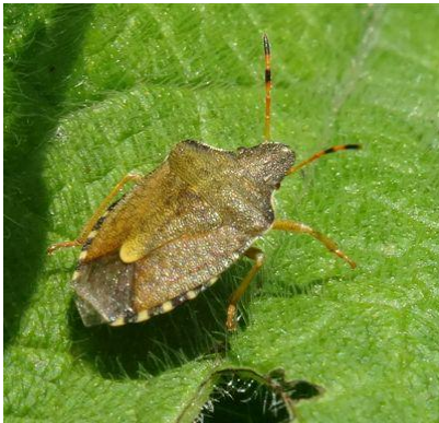
Peribalis strictus Vernal Shield-bug