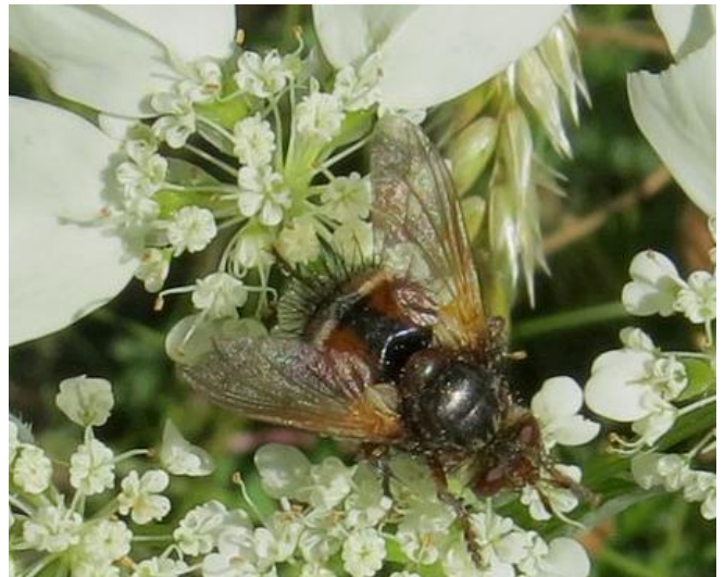
A couple of Parasitic-flies ( Tachinidae ) – usually parasitic upon lepidopteran larvae