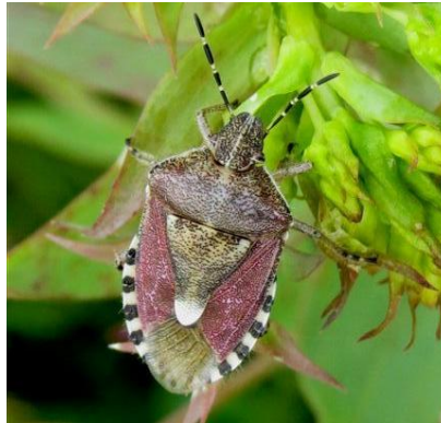
Dolycoris baccarum (adult)