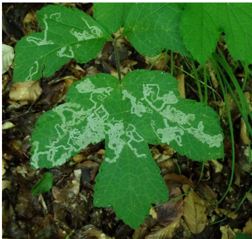
Left: Phytomyza spondylii on Hogweed