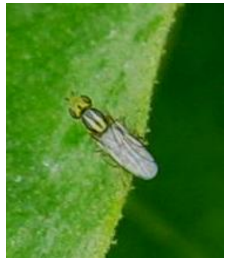
A Grass-fly ( Chloropidae )