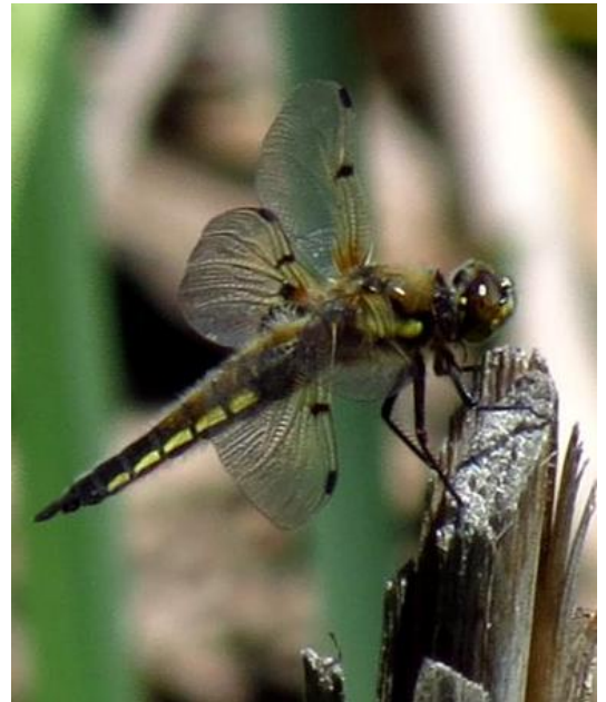
Four-spotted Chaser Libellula quadrimaculata