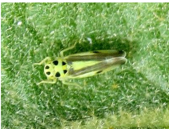
A leafhopper ( Cicadellidae )

Froghoppers in the Aphrophoridae are often conspicuous as nymphs: they secrete the surplus plant fluids as 'cuckoo-spit', defence for the soft-bodied nymphs against environmental extremes. Those fluids are considered to be surplus as they need to process large volumes of the sap in order to gain sufficient nitrogenous compounds for growth.