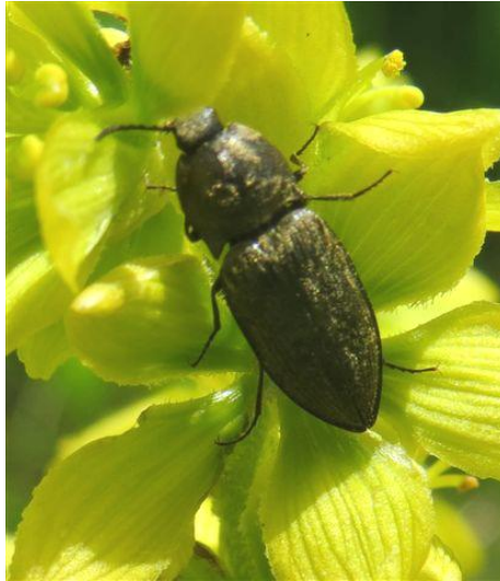
Prosternon tessellatum (Elateridae)