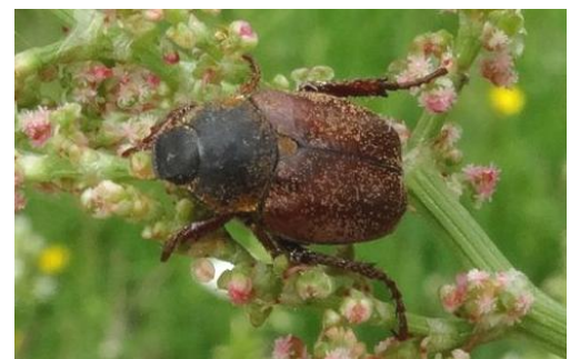
Right: Hoplia graminicola