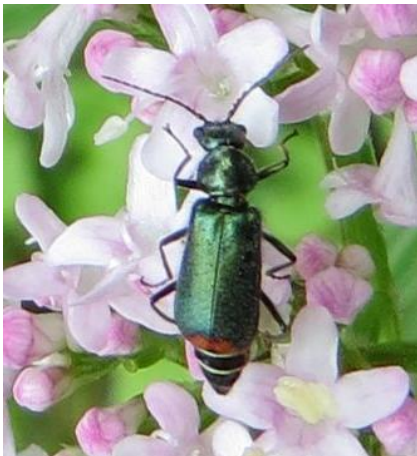
Malachius bipustulatus Common Malachite Beetle

Often to be seen sitting on flowers, where they eat pollen, nectar and other visiting insects, Malachite Beetles are often brightly coloured and/or metallic. Typically the abdomen protrudes beyond the end of the wing-cases. The unidentified species has some resemblance to Malachius aeneus (Scarlet Malachite-beetle), a rare British species, although the scarlet colour is not extensive enough.