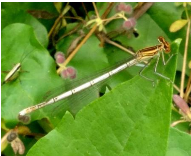
White-legged Damselfly Platycnemis pennipes