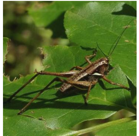
Pholidoptera cf. femorata