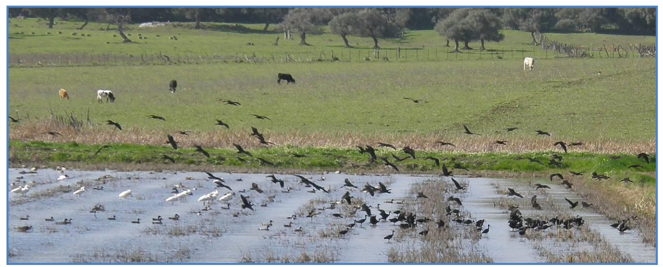
Glossy ibises, spoonbills and mallards on a rice paddy at La Janda.

Seeing migrating griffon vultures over the car park was a good start for the first few to assemble after breakfast before we headed west, beyond Tarifa, to the once extensive wetland of La Janda. Despite being 'improved' in Franco's time it remains a great magnet for birds with its mix of rice paddies, ditches and arable. Dropping down the hill there were immediately stonechats and corn buntings and a lucky few caught sight of a calandra lark as well as crested larks. Most of the group walked the short last stretch, past some paperwhite narcissi and many squirting cucumber plants on the other side of a ditch. At the corner, Frank walked some down to the ditch edge where otter footprints were found. But the main action was all round us with the birds. Inevitably there were many white storks and cattle egrets, but more notable were groups of glossy ibises feeding in a rice paddy. When they all flew there must have been 150 of these, and at one point groups of spoonbills joined them in the air. Surprisingly, to me, a few late wintering cranes were still present, small groups flying and a couple of family parties on the ground. Most of the waders were green sandpipers but snipe buzzed away a few times and half a dozen little ringed plovers fed alongside white wagtails.