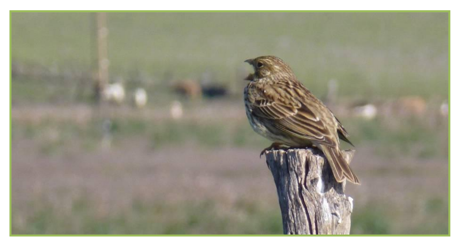
One of the many corn buntings at La Janda.

... and a general consensus in favour of Huerta Grande and its team, and that the Andalusian birthwort Aristolochia baetica was the memorable plant of the week.