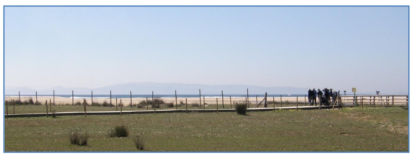
The long beach at Tarifa, with the Atlas mountains of Morocco across the water.

For the remainder of the afternoon, we visited the historical site of the Roman port and fish-processing factory at Bolonia. The stark, modern visitor centre isn't attractive but it tells the story well. You had to admire the organisation and civilisation of the Romans. The excavated and restored ruins are also a nice place to wander round, with black redstarts, stonechat and a charm of some 40 goldfinches, among other passerines, plus black kites arriving from Africa over the adjacent sea. Malcolm and Helen found our first small copper and there were clouded yellows and a hummingbird hawkmoth. Looking down, despite vegetation having been cut recently, among the wild flowers there were several examples of Centaurea pullata and you couldn't fail to be impressed by the spreading trunk of a big ombú tree with 'feet' reminiscent of a hobbit's. Three of us were lucky enough to see a green ocellated lizard – and by coincidence Shevaun and Helen took the idea of 'been there and bought the T-shirt' literally, choosing T-shirts from the museum shop with an ocellated lizard design.