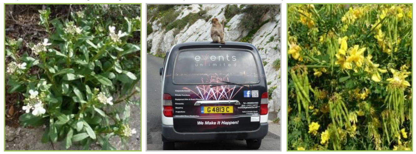
On the Rock: Gibraltar candytuft, an aspirational macaque, and shrubby scorpion vetch with an upended 'tail' at the end of each seedpod, which gives the plant its name.

Another day that was dry yet overcast and windy to start with, but warmed up nicely. Handily, being Sunday, we could park for free at La Linea on the roadside just past the frontier. We waved passports at border officials as we walked into Gibraltar, then caught the number 5 bus from the frontier, over the runway and as far as Casemates Square, from where we walked along Main Street and to the cable car. The wind was a strong levanter – from the east – so it was a smooth cable car ride to the top of the Rock. Looking down, and braving the gusts of wind, we could see the large conical flowers of Scilla peruviana and, through binoculars, some Gibraltar candytuft on the east-facing slope. Most then braved the machine-made hot drinks in the café atop the Rock, heeding warnings not to show any hint of food to the Barbary macaques outside.