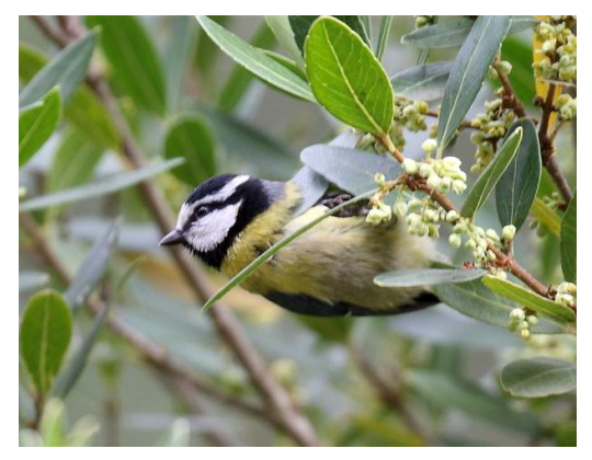
Long-legged buzzard and African blue tit - two north African specialities (Rob Carr).