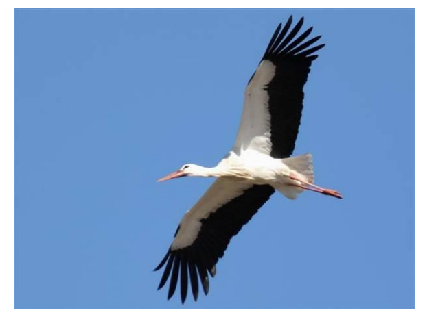
Iberian chiffchaff, ringed at Huerta Grande; white stork (Rob Carr).