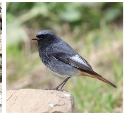
Little owl, a pair of lesser kestrels and black redstart (Rob Carr).

A short walk through the delightful plazas and winding streets of the Old Town took us to the Castillo de Guzman, Tarifa's 1000-year-old fortified castle by the sea. This imposing structure is not only impressive to visit but also hosts a colony of lesser kestrels, seven or eight pairs of which had already returned, and were super-active overhead as they rekindled their relationships and rebuilt nests in the holes and features of the fort's stonework. Lots of spotless starlings were also on show doing much the same thing, and there was also a beautifully crisp black redstart happy to pose for photos!