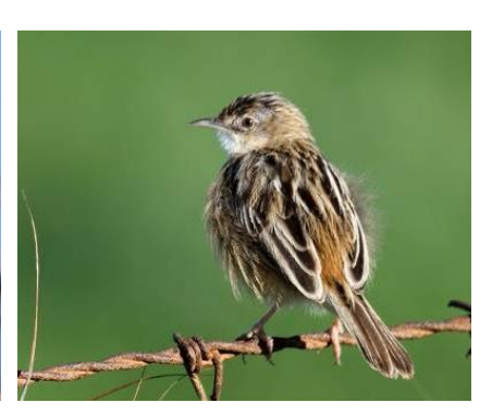
Corn bunting, Sardinian warbler and zitting cisticola.

Some of the day's more glamorous birds were purple swamphens, which were very active today. We saw a total of five birds moving around the bulrushes fringing the main ditch, iridescent in the sun. They were not to be outdone by a particularly flirty hoopoe, which teased the group by giving great views from the minibus but continually darting a bit further away before it could be photographed!