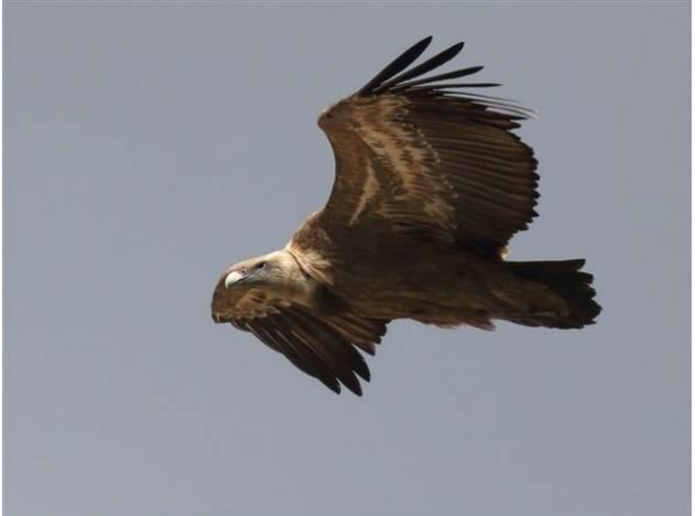
A flock of migrating black kites; griffon vulture (Rob Carr).

After a celebratory ice cream at the Mirador del Estrecho, we headed off for some mountain birding at Sierra de la Plata, near Bolonia. Simon and Niki took the group along winding tracks through remote countryside covered in wizened, wild olive trees and newly flowering cistus scrub to a beautiful viewpoint overlooking the village of Bolonia and Baelo Claudia roman ruins.