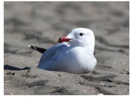
Whimbrel, curlew and Audouin's gull (Rob Carr).

The wetlands and mudflats teemed with life and Hassan pointed out hundreds of grey and ringed plovers, bar-tailed godwits, whimbrels, Eurasian curlews, common redshanks, greenshanks, green sandpipers, ruddy turnstones and dunlins. We had a surreal few minutes birding from an isolated sandbank in the middle of the lagoon, from where we were able to watch a large group of greater flamingos promenading together.