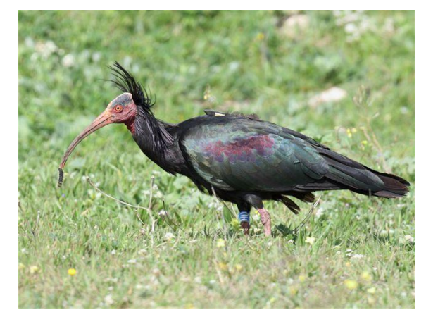
Black-eared wheatear; radio-tagged bald ibis with grub (Rob Carr).

After a reviving coffee we headed for our next site at the nearby salt pans at Barbate. To our delight a confiding group of northern bald ibis were foraging on the farmland around the entrance to the site, so Niki and Simon left the group to wander among them while the final trademark picnic of the trip was prepared, overlooking a close-by group of Audouin's gulls.