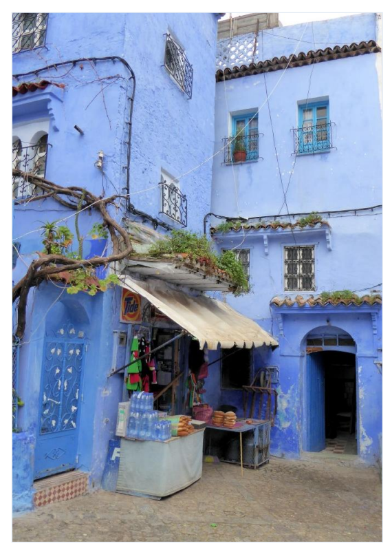
Chefchouen (David Bennett)

We were surprised by the incredible numbers of marsh harriers present, with probably half a dozen being visible in the air at any given moment, and a total of 20+ for the day. We also enjoyed picking through a large flock of yellow wagtails which included flava , flavissima and iberiae races, a real treat to see these different markings together and be able to compare them.