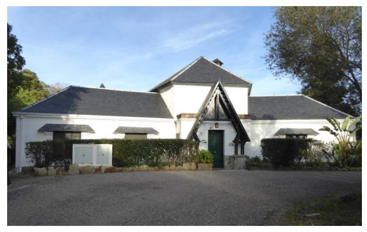
Casa del Espía (David Bennett)

The small but perfectly-formed group was met by Simon and Niki at Gibraltar airport, from where we made the short walk across the border to arrive in Spain. The minibus swiftly took us on the short journey to our first base at Huerta Grande Ecolodge, and the mood was good as the outskirts of Algeciras, peppered with huge white stork nests, gave way to the rugged hills and cork oak forests of Los Alcornacales Natural Park.