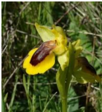
Yellow bee orchid.