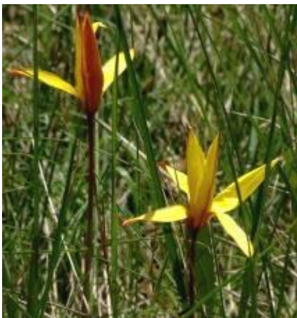
Wild tulips, Tulipa sylvestris .

After lunch, a short drive then took us into the main Aragón valley, turning west on the north side of the river and heading on (reasonably) comfortable unmade tracks towards the confluence with the Veral. But immediately we drew to a halt as dark shapes scythed over the rushing waters. Two hobbies were making inroads into the local insect populations, catching and eating them on the wing, in a wonderful display of aerobatics, and even a couple of kingfisher flypasts were unable to unrivet our attention from the hobbies. Our main purpose of this route was to see if some of the special flowers were out, and we were not disappointed. Purple gromwell was a strikingly-blue feature of the shaded verges; wild tulips were just opening their starry yellow flowers further along; and the Lusitanian fritillaries on a Badlands spur were flowering with an abundance that I have never seen before. A scarce swallowtail performed admirably, resting in front of and on the photographers, and several iridescent green tiger-beetles scurried and flew out of our way as we walked along the old river bed gravels among the yellow ground-pine.