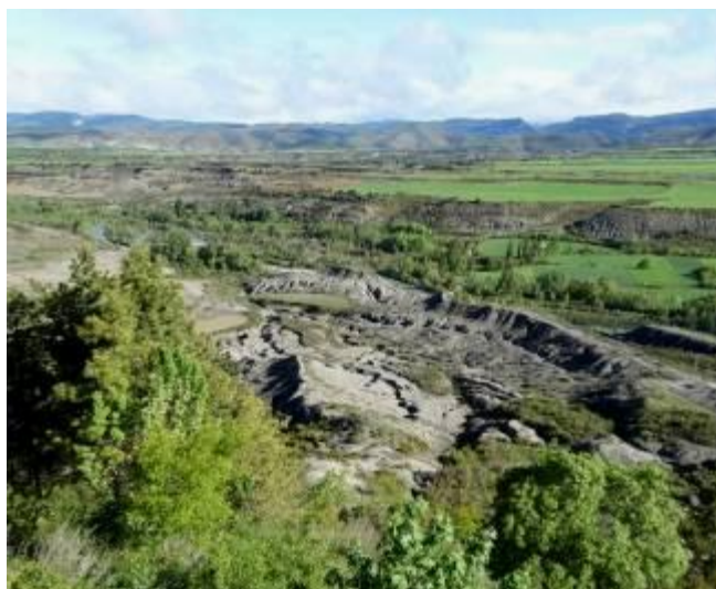
Badlands in the Veral valley.

Walking slowly down onto the Badlands, the skeletal, eroded marl landscape was at first glance lifeless but far from the case in reality: bold splashes of yellow from Berdún broom and barberry; white-flowered snowy mespilus; pink shrubby thyme; and the bronze-tinged foliage of box. Between the shrubs, there were white rock-roses, red Montpellier milk-vetch, bright blue shrubby gromwell and acid-green serrated spurge, and lady orchids just coming into full flower, mostly gaining protection against browsing by growing in and around the spiny shrubs. The wind was keeping all small birds out of sight and earshot, but an unfamiliar yelping call drew our attention to a superb displaying booted eagle, although the object of its attentions never appeared.