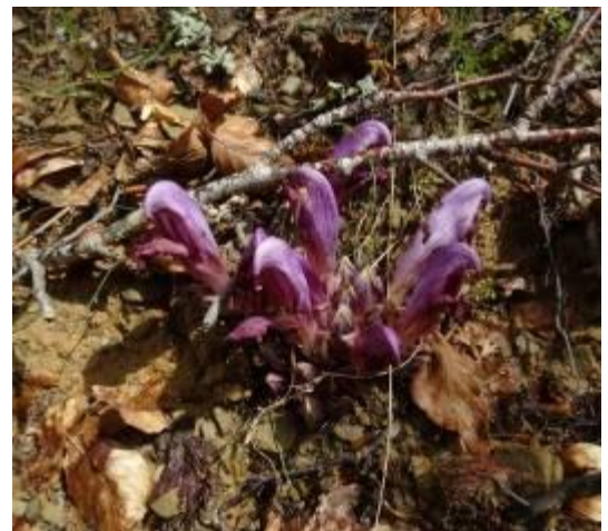
Decorating the forest floor: Pyrenean squill and purple toothwort.

And so to lunch, taken at a convenient stopping point on the forest road between Zuriza and Isaba. Although most attention was on the delightful spread, we did lift our eyes long enough to see a stack of griffons above, and having seated himself away from the noise of the tumbling stream, Peter managed to pick up a couple of crossbills flying over.