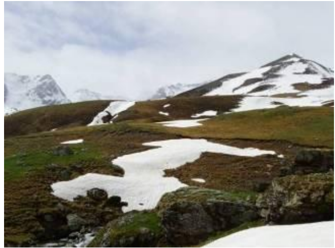
The slopes below Portalet.

It isn't often that 'beautiful' is used in the same sentence as 'pipit'! A little further down, a vantage point among the wild daffodils was ideally placed to watch a splendid male rock thrush, typically perched atop a jumble of boulders. And Steph, in an attempt to get closer to the daffodils, drew our attention to several bundles of fur waddling across the slopes – alpine marmots, no doubt just emerged from hibernation. Indeed, after a short while a number of the prominent 'rocks' started to move and whistle, as the marmots set about establishing territories while keeping watch for hungry predators. With good reason, it turned out, as an immature golden eagle swept along the opposite slopes, its wingtips almost brushing the ground. Still further down, spring was more advanced, and even in the overcast conditions, the spring gentians were blooming profusely, their intense blue complementing the yellow kingcups, orange-yellow Gouan's buttercups, and elder-flowered orchids of both cream and purple colour forms. However, spring clearly still had some way to go: rock buckthorn was still to come into leaf, its bare twigs closely adpressed to the south-facing rocks, trying gecko-like to get the maximum heat from this extreme environment.