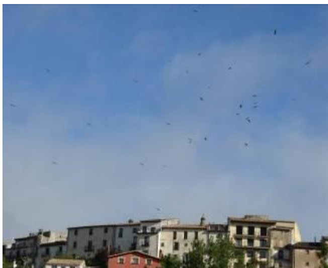
Griffon vultures over Berdún.

After breakfast, with freshly-baked local bread and croissants, we got no further than the car park before the griffons rose up above the village in wave after wave, more than fifty in total, taking advantage of the updraughts from the wind hitting the hill. We drove up to the village for an orientation session, consisting of stops at each of the lookout points, necessarily brief because of the increasingly blustery wind making it very cool despite the welcome sunshine. The views were spectacular: up to the high Pyrenees (although the very high tops were shrouded in cloud), either way along the Canal de Berdún, and south to the Pre-Pyrenees, the Tolkeinesque triangular peak of Oroel rapidly becoming a familiar landmark. Although most of the vultures had moved on (or been blown away) by the time we reached the top, a few remained and were joined by black kites, a pale morph booted eagle and a couple of Egyptian vultures, over the rubbish dump.