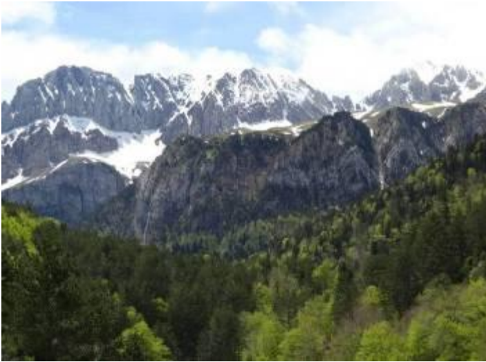
The upper Hecho valley.

Another windy start, so we headed before breakfast down to the marsh, to try and find some shelter. And wherever a little shelter was to be found, we came up with new migrant birds, including grasshopper warbler, olivaceous warbler and several sedge warblers. The wryneck was in its usual area, and singing much more prominently than on previous days. Mindful of the dodgy forecast for the rest of the week (not that we believed in forecasts any more!), another re-jig of the planned programme saw us heading, via a refuelling stop, up the Hecho Valley, and through the dramatic rocky gorge, the Boca de lo Inferno (the aptly-named Hell's Mouth). We stopped first at a reported site for Pyrenean desman, but (as ever) no sign, although there was a dipper in the river and goldcrests in the fir trees. Green hellebore was just past flowering, and both yellow and wood anemones provided colour to the woodland floor. Onwards, beyond