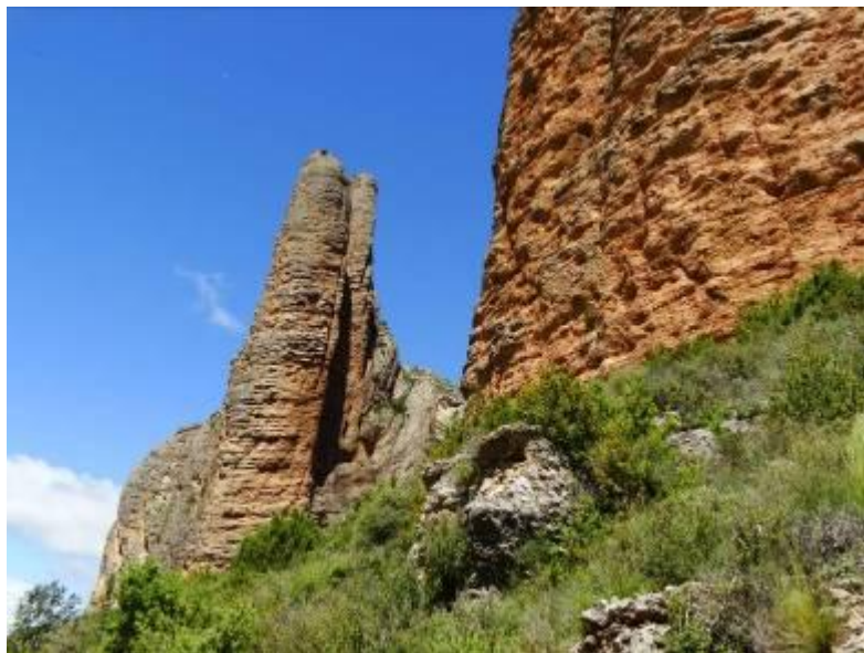
Los Mallos at Riglos.

If yesterday had been characterised as a day of gorges, valleys and hairpins, perhaps the theme of this day had been the immense power of nature – the geological processes which created and deformed the Pre-Pyrenees into their majestic form; the power of water which eroded them into the shapes we now see, and which was so obvious at the dam; and the power of wind which could quite easily have seen us merging with the landscape a little too closely.