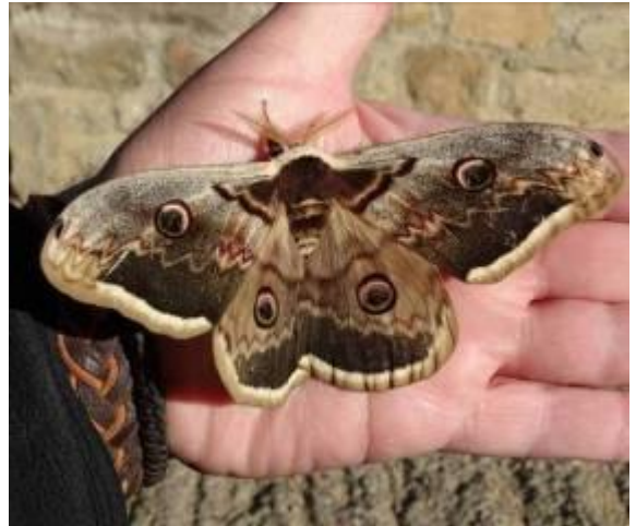
Giant peacock moth.

On with the planned day, to the southernmost reaches of the pre-Pyrenean range, the first stop was next to the Peña Reservoir. It was cold, with a strong wind and heavy cloud as we crossed the reservoir on a wobbly concrete slab bridge, and water birds were restricted to a very distant great-crested grebe. Greater yellow-rattle was flowering well in the meadow on the far shore, and out of the wind, a burnet companion moth put in an appearance.