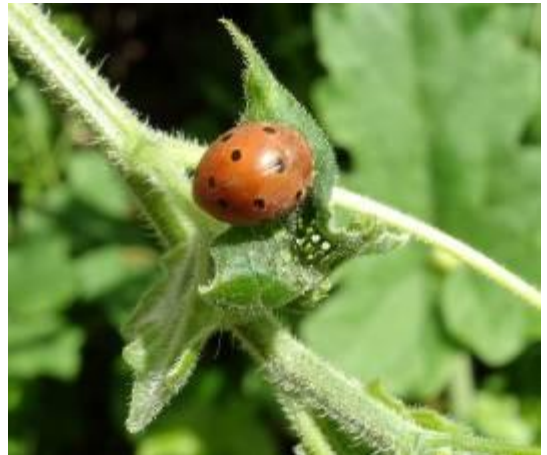
Biniés Gorge, where a bryony ladybird was found on white bryony.

For the afternoon, we then headed out (via a splendid short-toed eagle hovering over a Badlands slope) to the nearby Foz de Biniés, where I left the group, before moving the van down to the bottom of the gorge. By the time we regrouped in mid-gorge, they had seen numerous griffon vultures low overhead, including several on nest ledges, as well as grey wagtails. But no dippers in the river; once a very reliable site for this species, the population in the gorge seems to have declined substantially in recent years, much as it has in the uplands of Britain. The rosettes of Ramonda , clinging to the north face of a large rock, were showing no signs of flowering, nor indeed most of the rosettes of Pyrenean saxifrage, and the patches of yellow garlic were still in bud, pregnant with the promise of golden stars in a few days' time. But some of the botanical specialities were flowering well, including rock petrocotilis, rock soapwort, Nottingham catchfly, Pyrenean hyacinth, bedstraw broomrape, bastard-balm and large Mediterranean spurge.