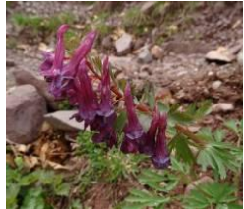
Spring gentians and Corydalis solidida .

12cm or so long, thickly cylindrical, and stuffed full of plant fibres. After due deliberation we realised it could only have come from a brown bear – the area is used by a small number of wanderers from the reintroduction scheme in France – and it was certainly very fresh.