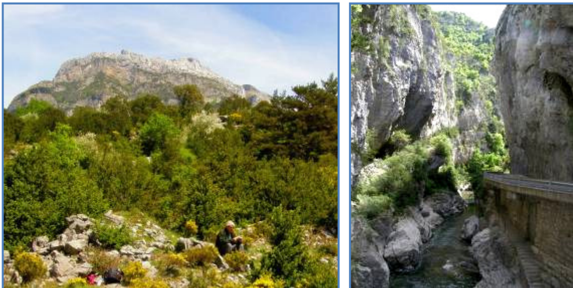
Enjoying lunch and an intriguingly-shaped local cheese in the Hecho valley; and Binies gorge.