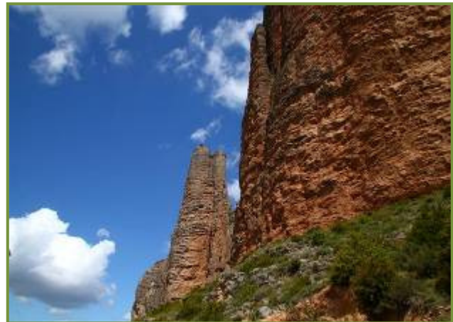
Male black wheatear in Riglos village. The rock stacks of Los Mallos de Riglos are up to 300m high.

A short drive across the main road then took us to Agüero, the smaller but quieter counterpart of Los Mallos de Riglos. Initially quiet, a couple of Egyptian vultures eventually appeared, probably close to their nest cavity, and we were treated to the sight of a crag martin mobbing a kestrel mobbing a chough mobbing a raven! Which sailed on serenely as if oblivious to the fracas around it. A dot on the skyline eventually resolved into another black wheatear; much closer two hummingbird hawk-moths were feeding on the wild jasmine and perfoliate honeysuckle flowers; and new plants included bloody crane's-bill, Osiris alba and the beautiful shell-pink rose garlic.