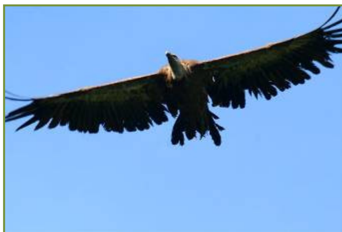
A nightingale singing in the early morning light; and a griffon vulture drifting over the Badlands.

Red and black kites floated around as we spotted the spotless starlings, and the twittering of house sparrows (not Spanish, just 'ordinary' house, although altogether more smart than many of our grime-encrusted city birds) mingled with the buzzing notes of rock sparrows, a pair of which perched for cracking 'scope views by the churchyard. Overhead a few newly-arrived swifts flew around with hordes of house martins and swallows. From the northern slopes, nightingales, melodious warblers and serins were in fine song, and display 'soaring' in the case of one serin – 'look at me ladies, I'm as big as a griffon vulture!'. Talking of which, at the eastern lookout, no sooner had I uttered the words 'I think it is now warm enough for the griffons to be roaming' than the skies darkened as the first one appeared. In the three years since the last Honeyguide trip, it appears the local griffon population has become much reduced: Peter tells me that new animal