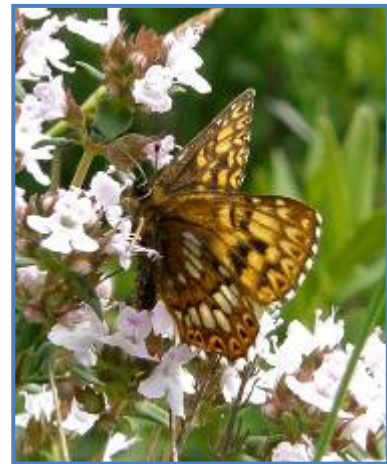
Purple gromwell; and Duke-of-Burgundy on flowering thyme.

Driving uphill was going back in time, with Amelanchier springing into flower. A brief stop at the viewpoint gave tremendous views across to the high Pyrenees, usefully interpreted (in understandable Spanish) on the geological trail boards provided. Ever onward and upward, we drove then to the car park by the new monastery at the top. Being Sunday and sunny it was busy, but our chosen picnic table location soon produced a noisy black woodpecker in the treetops, albeit seen only in flight.