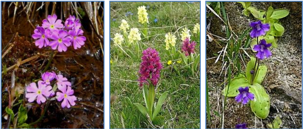
Bird's-eye primroses on the bank of a stream in the kingcup meadow; elder-flowered orchids big as hyacinths and in their thousands at Formigal; large-flowered butterwort at Escarilla.

And then it was back into the bus, dropping downhill into spring, and stopping by a blazing patch of kingcups for lunch. Closer investigation soon added bird's-eye primrose, horned pansy, and alpine forget-me-not to the list, along with an array of bold flowers on the road verges and rocks: Euphorbia flavicoma , globularia, Pyrenean vetch, rock cinquefoil, and both main colour forms of elder-flowered orchid together with a single salmon-pink intermediate. Common wall lizards, with a few Pyrenean rock lizards, basked on the rocks, and a Pyrenean frog just avoided being knelt upon in our quest to photograph the orchids. Lower down still, below Formigal, the roadside pastures were a visual delight, in particular the intensely blue gentians mingling with the yellow and purple of elder-flowered orchid, in their thousands. So much so savour at our feet that most missed the common buzzard, honey buzzard and Egyptian vulture overhead, flying in advance of a heavy squall moving up the valley. Passing through the worst of the rain in the comfort of the van, it was only drizzling gently as we reached our final stop at Escarilla, a short potter around a side valley, with jay and grey wagtail, bright cushions of rock soapwort, and a vertical, dripping wall of large-flowered butterwort in full bloom.