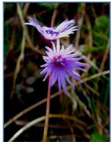
Primula hirsuta , trumpet gentians, alpine snowbells.

Overhead, small parties of swallows heading into France provided signs of ongoing migration, along with a chiffchaff resting and feeding around the rocks. A pair of kestrels was nesting on the cliffs, alongside the dramatic song flights of a rock thrush, a flurry of orange and blue with a prominent white rump, fluffed up in the descent. Northern wheatears and black redstarts perched prominently on the rocks, while a little further away, alpine marmots sat atop their rocky mounds, which presumably formed their winter hibernation homes, and the slopes echoed with their strange wader-like piping cries. A few water pipits, in subtle shades of blue and pink about as 'pretty' as any pipit can ever be, were singing in their parachute song-flights; choughs (mainly red-billed) sky-danced noisily, and a short-toed eagle which drifted over us was followed even more leisurely by an adult lammergeier, barely flicking its wing-tips as it traversed the valley.