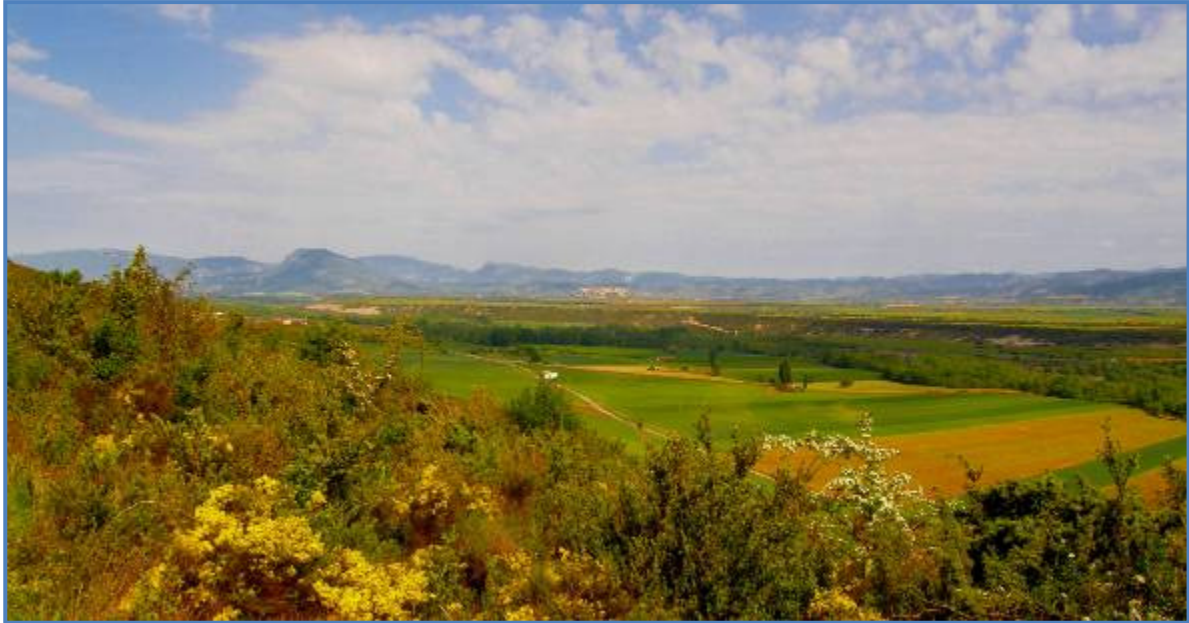
View from the hillside walk to Arrés, looking towards Berdún across the Canal , a geological depression or channel extending from Jaca in the east to Yesa in the west.