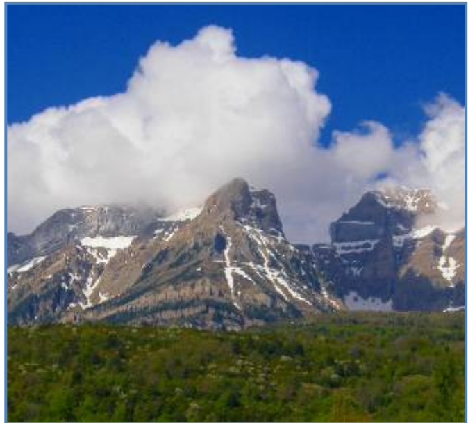
The high Pyrenees from our stop by Gallego reservoir.

With the tops largely clear of cloud, our first foray into the high Pyrenees took us towards Portalet in bright sunshine, passing a sadly freshly-dead pine marten on the road. Typically the high level reservoirs were birdless, but a short stop there gave us some splendid views of the mountains. Higher and ever higher, towards Formigal, then Portalet, was like peeling back the seasons: early summer in the lowlands, to the first inkling of spring at five thousand feet, although lying snow remained well above us, in stark contrast to many previous trips. After a coffee stop, we explored the local rocky grassland, a natural alpine garden, to Barry's evident delight. Most dramatic of all were the bold pink splashes of Primula hirsuta , together with wild daffodil, oxlip, Pyrenean violet and green hellebore. Gentians, both spring and trumpet, were opening their first flowers in the sunlight, a glimpse of the riches to come lower down, and rock buckthorn clung gecko-like to the rock-faces with a southerly aspect, to make the most of the sun's heat. In a rather unprepossessing corner behind one of the shops – actually, a rubbish dump – Sue found our only examples of snowbells on the trip.