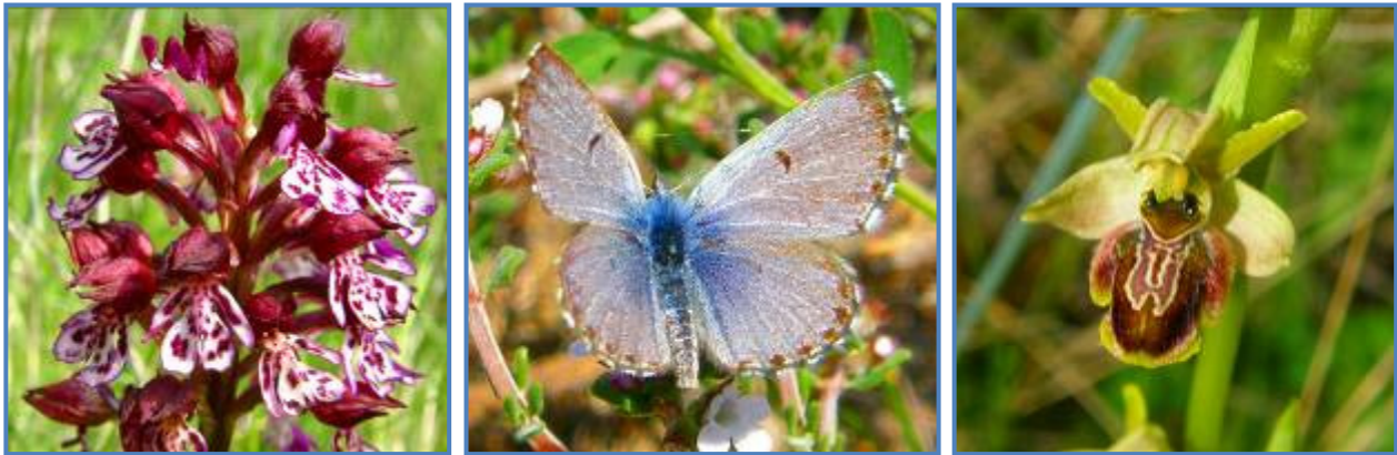
Lady orchid; panoptes blue showing discal mark on forewings; early spider orchid.

After lunch, a short drive took us into the main Aragón valley. From Martés bridge, common sandpipers, little ringed plovers and a Spanish yellow wagtail fed on the water-washed rocks, and a wander along the south bank produced several orchids, including early spider, yellow bee and woodcock, pink Pyrenean rock-rose, white Arenaria aggregata , and yellow ground-pine and dragon's-teeth Tetragonolobus maritimus . A liquid bubbling drew our attention to a party of 15 bee-eaters overhead, while for us on the ground, a distant hum turned into a loud buzz as a swarm of bees passed over. If only the two could have met up! Insects were everywhere and active in the heat, green tiger-beetles hunting and red-winged grasshoppers displaying on the track, and many butterflies, including the delightful Moroccan orange tip, and common and panoptes blues taking salts from the rapidly-diminishing puddles in the ruts.