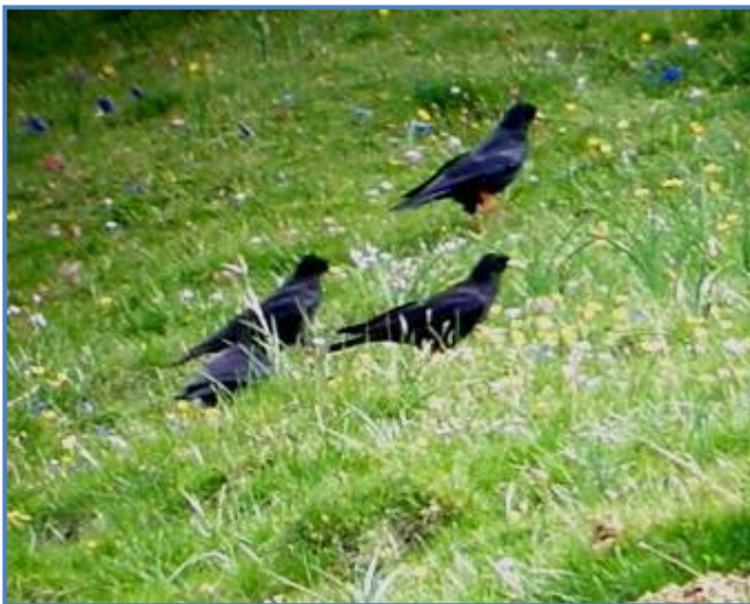
Alpine choughs – red legs, yellow bill – among the alpine flowers; and two inquisitive isards watching them.