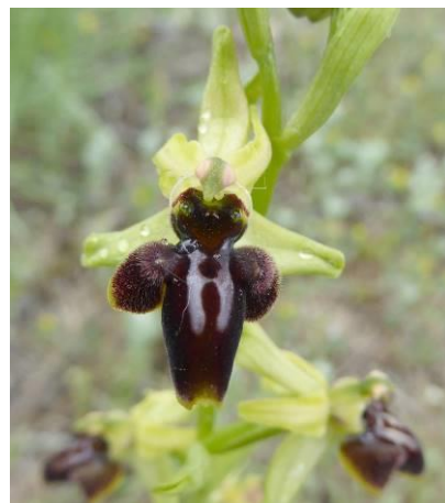
Woodcock, yellow bee and early spider orchids, and below, one of the hybrids. (HC)

Walking along the dry, cobbly, overflow river bed, many of the plants were as found earlier on the Badlands, together with ground-pine, Pyrenean rock-rose, shrubby plantain and dragon's-teeth. Orchids in flower included military, woodcock, early spider and mirror, together with several confusing, probably complex, Ophrys hybrids involving woodcock, yellow bee and early spider parentage. Some resembled 'species' recognised by some authorities, such as O. incubacea , riojana and passionis , but where the species limits sit in relation to intraspecific and hybrid variation is a moot point.