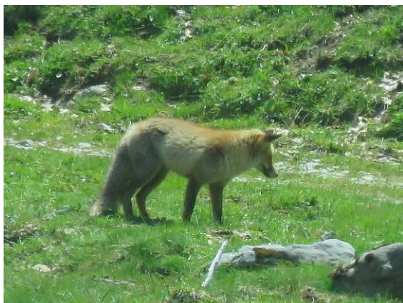
This fox was on the prowl and heading towards the vultures when we arrived at Linza. (CG)