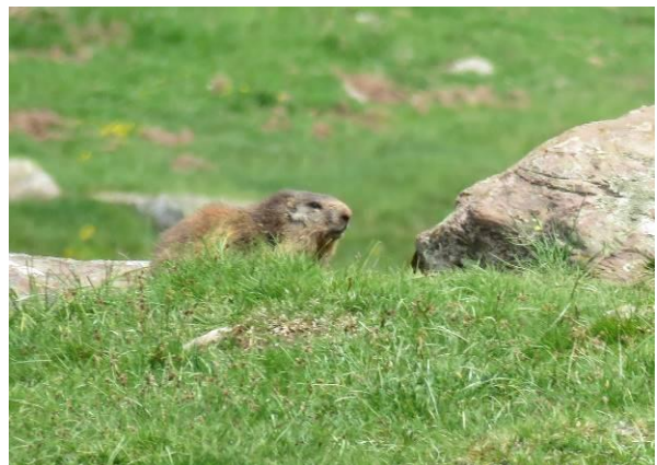
Marmot on the lookout at 'Marmotropolis', upper Hecho valley. (CG)