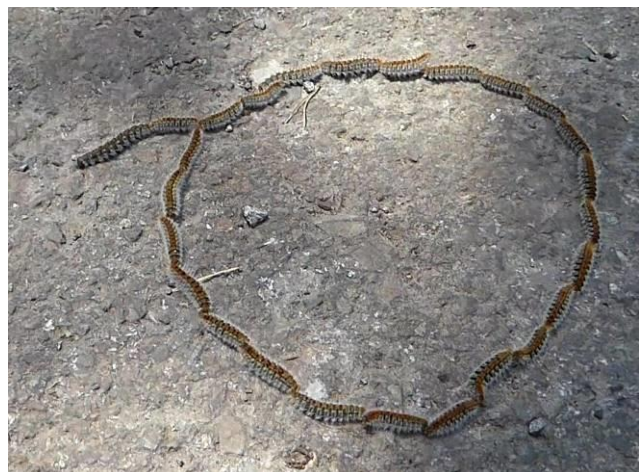
Not on the circle line forever – a new leader emerges. (HC)

In a vain search for a black woodpecker nest, one of which is often to be found around the car park, we came upon another superb photo opportunity, a procession of 26 pine processionary caterpillars edging their way across the road. Bound for certain death if a vehicle had come along, we felt obliged to turn them around, although mindful of the caterpillars' irritant hairs. David and Sue proved to be effective processionary wranglers with their sticks, and coaxed them round, back to safety and fresh food. In doing so, the procession closed into a circle, but they proved the lie to the old Victorian naturalists' tale: after a few minutes of circling nose-to-tail, one rebel broke formation. Perhaps significantly it was the largest of the larvae, although not the original procession leader. Another example of doing good for the natural world, while providing us with photo opportunities and some resolution of our intellectual curiosity.