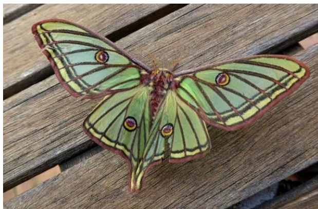
Peter R's photo and tweet; and the cause of our excitement (HC).

Breakfast was enlivened by a termite emergence, but at last it was time for the moth show to begin. It started well with a couple of giant peacocks (at least one being a fresh individual, not one of those from last time). Then the tigers: cream-spot tiger and two chaste pellicles (don't you just love the names?!). Next up the hawks – three small elephants, a spurge and a privet. And finally, the pièce-de-résistance , an icon of the Pyrenees, the lammergeier of the moth world, a living Art Nouveau brooch: a female, near-pristine Spanish moon moth. What a privilege to see one: after numerous photos she was released on a garden pine tree...here's hoping for next year.