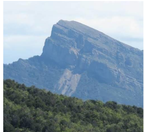
There were many Champagne orchids in the field by the new monastery, and grass-leaved buttercups at the abandoned hermitage of St Theresa, from where the scar on Oroel was clearly visible. (CG)

We had lunch, another tasty picnic from Casa Sarasa, in the pine woods, enlivened by one of the local nuthatches, clearly feeding chicks, which foraged for scraps around our tables, and soon learned to take (unsalted) hazelnuts which Helen wedged into cracks in tree bark. Good for the birds, and a prime photo opportunity for us!