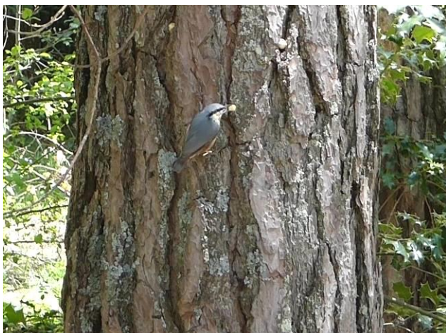
This nuthatch was quick to adapt to an unusual feeding opportunity. (HC)

We had lunch, another tasty picnic from Casa Sarasa, in the pine woods, enlivened by one of the local nuthatches, clearly feeding chicks, which foraged for scraps around our tables, and soon learned to take (unsalted) hazelnuts which Helen wedged into cracks in tree bark. Good for the birds, and a prime photo opportunity for us!