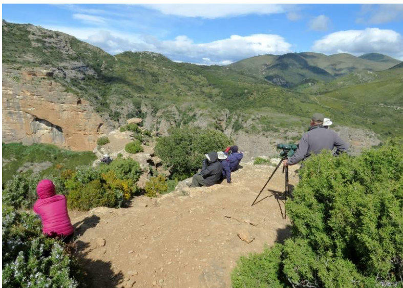
Watching vultures, below us for a change, from a windy precipice high above Riglos. (CG)