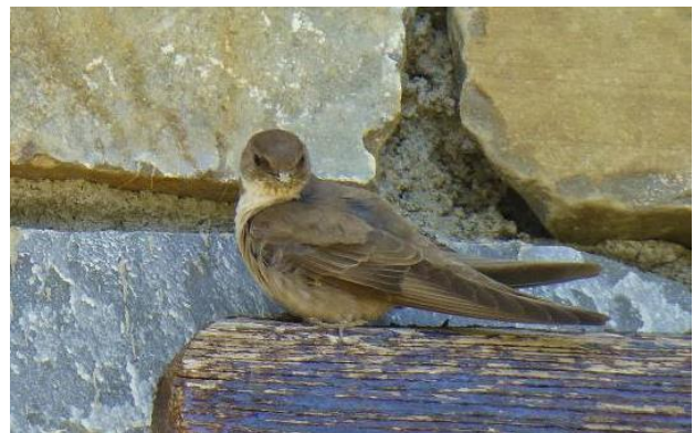
One of the crag martins nesting under the eaves of the refuge building at Linza. (KD)

Back then all the way down the Ansó valley, with just two photostops, one for more of the griffon gore-fest, the other for montane views above Zuriza, before we travelled to within a few kilometres of Berdún, and the start of the Biniés Gorge. A low-level but hugely dramatic gorge, with a quiet road running down it: the recipe for a gentle 3km afternoon stroll. Plenty of grey wagtails were in the river, but there was no sign of dippers, in keeping with most of our recent visits, and in sharp contrast to visits 15 or 20 years ago. 'Citizen science' monitoring of environmental change has now come of age, and our collection of past reports now makes an important contribution to that.