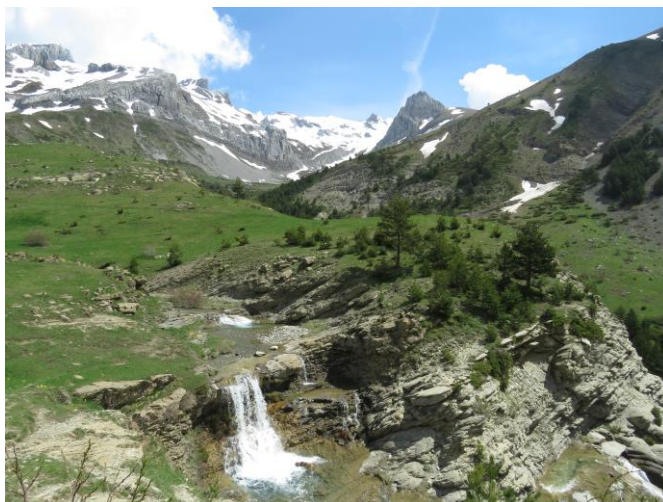
Glorious Aisa valley. (CG)

Dragging ourselves away from the wildlife which came to us, we headed east and up the Aísa valley, in fact straight up to the very top given the forecast of a lunchtime storm. And such a visual feast and delight: outstanding glacial geomorphology; snow-clad peaks, with large pink patches as a result of a recent Sahara dust-fall; and pastures in better bloom than I have ever seen. Gentians, oxlips (and hybrids with cowslips), elder-flowered orchids (both purple and yellow, with a few intermediates), and bird's-eye primroses – the colour-spangled turf seemed to go on for ever. Add to that the less showy plants, such as least daffodil, Pyrenean and yellow rock-jasmines and Pyrenean violet: a true botanical cornucopia.