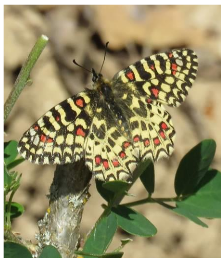
Seen at Atarés junction: southern grizzled skipper (KD); large psammodromus – the scales are keeled, giving the lizard a spiny appearance; Spanish festoon. (CG)

Several common buzzards were circling overhead, and the air was full of the trilling song of Bonelli's warblers, while a large psammodromus lizard rested and basked on a rock. Plants included crested cow-wheat, Vicia onobrychoides and some lovely burnt orchids: just in time perhaps, as when we returned to the vans, they were surrounded by local transhumance in action, a large flock of goats and sheep being transferred between pastures. Most of the goats bore bells, the larger the goat the larger the bell; the result was a throbbing polyphonic soundtrack, an almost visceral ululation from the dawn of farming history.