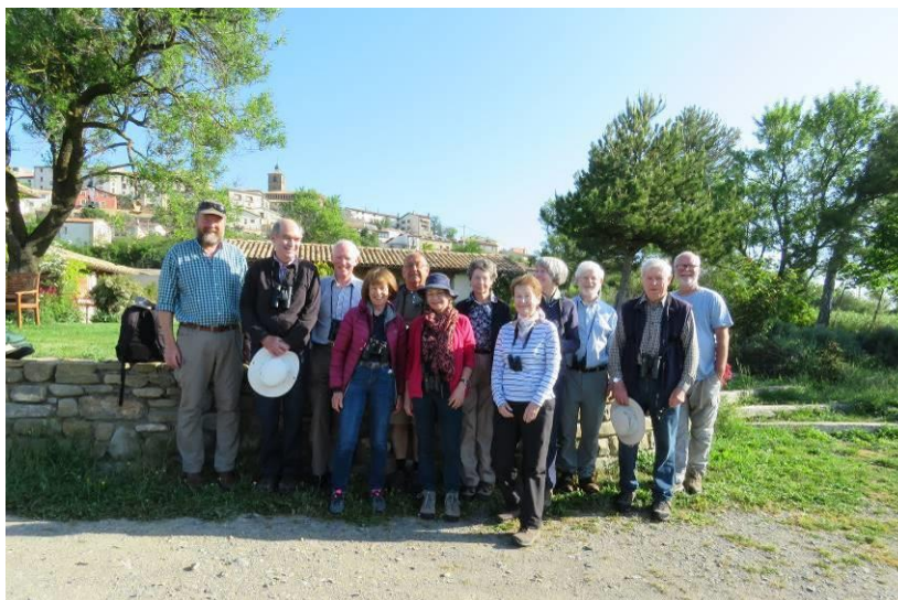
Above: the group at Casa Sarasa, with Berdún in the background. Below: a street in Berdún (KD); giant peacock moth at Casa Sarasa (CG).

Front cover: female Spanish moon moth (CG).