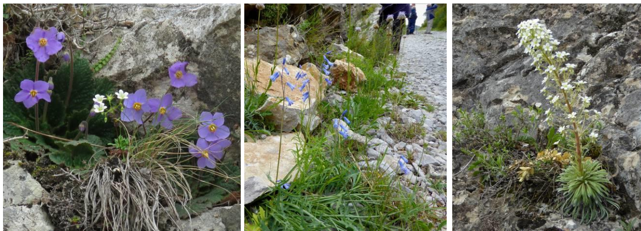
By the dam at Peña Reservoir: Ramonda myconi (CG); Pyrenean hyacinth; Saxifraga longifolia (HC).

After breakfast, we headed south into the Pre-Pyrenees, hoping to make the best of a cold day with a sharp northerly wind. At Peña Reservoir, however, it was still very blustery and felt seriously cold. Nothing at all to be seen on the Reservoir itself, and most of the cliff birds like crag martins were hunkered down in their crevices, but a subalpine warbler was singing and seen briefly in the scrubby slopes next to the dam. However, the plants were simply outstanding: matted globularia, Pyrenean hyacinth and Chaenorhinum oreganifolium on the rocks, with numerous rosettes (some just flowering) of the endemic Saxifraga longifolia , and a more floriferous display of the pre-glacial relict African violet Ramonda myconi than I have ever been privileged to see here.