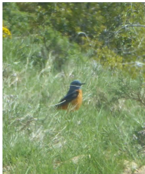
Male rock thrush (through the van window). (HC)