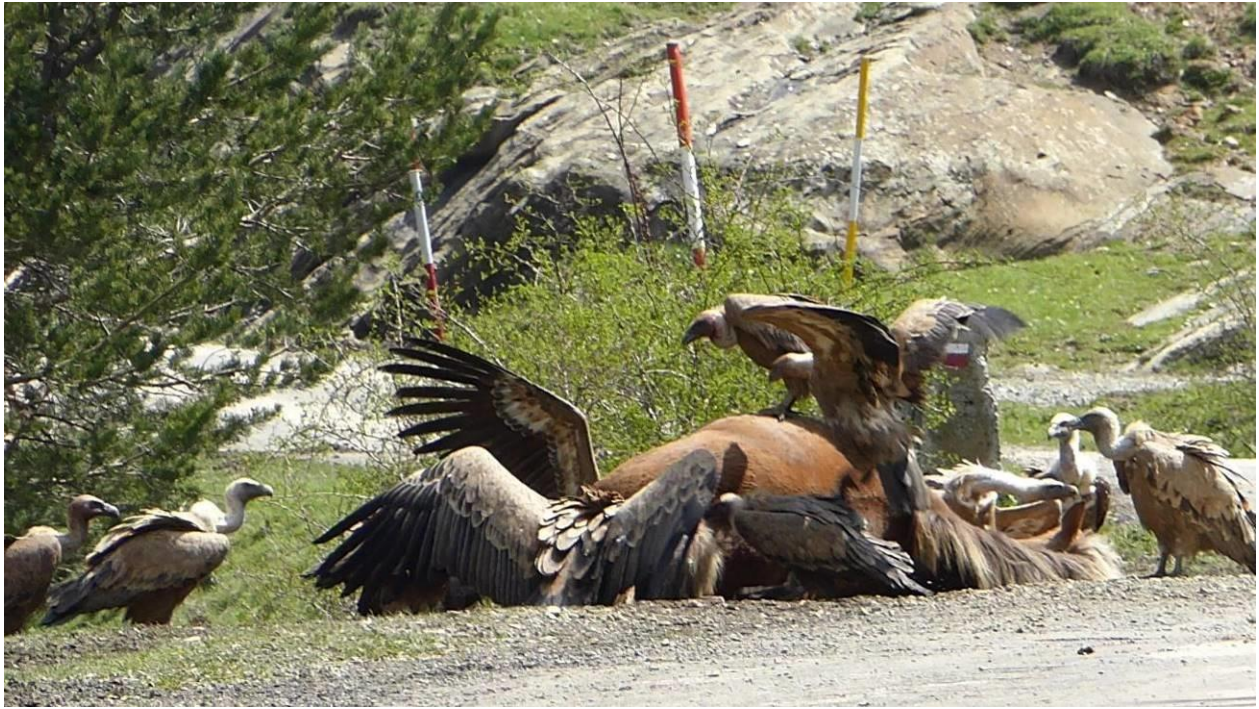
The sight that greeted us just before lunch at Linza refuge. (HC)

...which most managed without too much difficulty despite any lingering sounds, sights and smells. Vast swathes of snow-patched mountainside revealed a trio of izard crossing one of the white patches, and later a dispersed herd of 20 or so grazing lower down below the snow, while a flock of more than a hundred alpine choughs wheeled over the very high tops. A short walk then took us through the grassy pastures, splashed with the eye-arresting colour of spring and trumpet gentians, the blue having a particular vibrancy and intensity in the clear mountain sunlight. Then into the beechwoods, the sun-flecked ground adorned with Pyrenean squill, purple toothwort, yellow anemone, lungwort and two species of cuckoo-flower; a 'black' beetle, when flipped, showed the amazing metallic purple reflections on the underparts of the Pyrenean dor beetle.