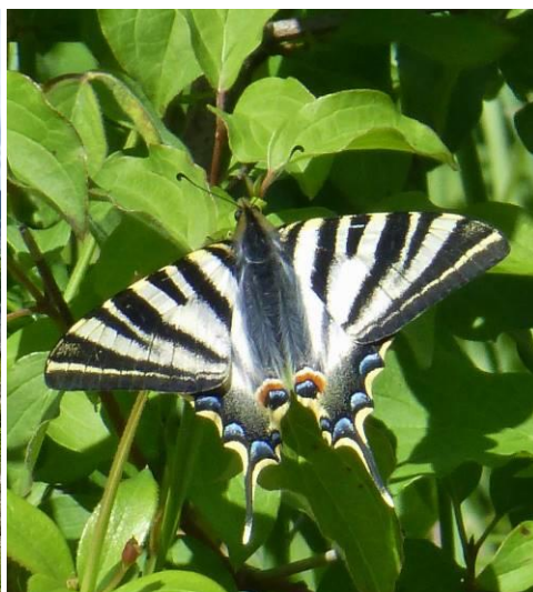
On the Badlands this first, rather chilly, morning. It soon warmed up enough to bring out butterflies, including this Spanish swallowtail. (KD)

As we moved on to the eroded marl landscape of the Badlands, it soon became apparent that these stony, largely soil-less slopes were in fact in profuse bloom: yellow Berdún broom and barberry (mixed with bronzy box, not in flower), pink shrubby rest-harrow, mauve shrubby thyme, and a rainbow of lower growers: white rock-rose, blue aphyllanthes, globularia and beautiful flax, and purple lady orchids. Early spider and bee orchids were also located, while a lower meadow by the river produced yellow bee orchid and the leaves and emerging spikes of lizard orchid. On the richer valley soils, white-flowered shrubs – hawthorn, wayfaring tree, dogwood and fly honeysuckle – were in evidence, and providing both nectar and shelter for several butterflies, including Spanish swallowtail, holly blue and a single Glanville fritillary. Unrecognised at the time, but subsequently identified from photos, the butterfly haul also included a Provençal short-tailed blue.