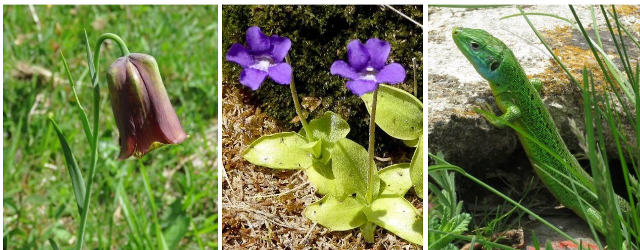
Pyrenean snake's-head fritillary (CG); large-flowered butterwort, with sticky leaves to trap insects, supplementing poor nutrition from the tufa and vertical aspect (HC); western green lizard (CG).

Heading once again to the high mountains, we made an initial diversion across the agricultural plains of the Canal de Berdún towards Santa Engracia to try and locate a black-headed wagtail that Peter had heard about the previous evening. No such luck, but the plethora of corn buntings, together with both skylark and short-toed lark made the dusty drive worthwhile. Then it was up the Hecho valley to our first stop at the start of the Boca del Infierno, if anything our most dramatic gorge so far, and again an easy walk up a very quiet public road. Grey wagtails and a few fleeting glimpses of dipper provided the bird interest, while flowers included bastard-balm, sweet woodruff, fairy foxglove, a single perfect Pyrenean snake's-head in a clearing of the beech forest, and a fascinating vertical water garden, with a substrate of tufa, supporting a lovely colony of large-flowered butterworts.