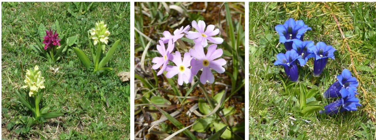
Elderflower orchids (CG), bird's eye primrose and trumpet gentians (HC), flowering profusely at Aisa.

Heading back to the foot of the valley, we stopped off for a bit of history, culture and coffee, with an hour in Jaca as a light rain started to fall. Heading homeward, we diverted up the picturesque Alastuey valley, where even the rain could not diminish our final good birds of the day, a pair of rock thrushes. Finally, a short drive around the top of Berdún village gave everyone the chance to see many of the places we had visited during the week, in a newly familiar context, and it was back to Casa Sarasa just as the heavens opened in a big way.