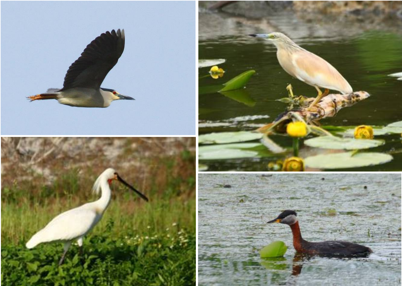
Clockwise from top left: night heron, squacco heron, red-necked grebe, spoonbill.

At every turn there were more waterbirds – grey, purple, night and squacco herons; little and great white egrets; a few spoonbills and glossy ibises, and as we entered a series of reedy pools and channels, pygmy cormorants, red-necked grebes, pochard, garganey and ferruginous ducks, along with a few pelicans of both species. Flying over, out on the water, or feeding on the margins – it was difficult to know where to look next, but all we had to do was sit there and soak it all in. A grass snake was seen swimming in the water, as indeed, bizarrely, were a couple of cattle, and an array of dragonflies and damselflies included banded demoiselles, lesser emperor, and blue-tailed and red-eyed damsels.