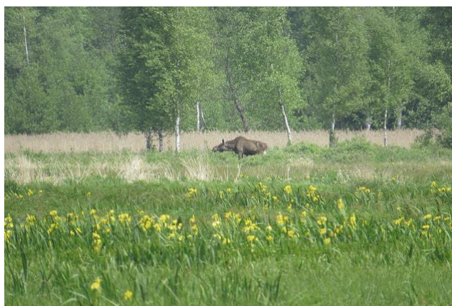
Yellow flag iris with an elk