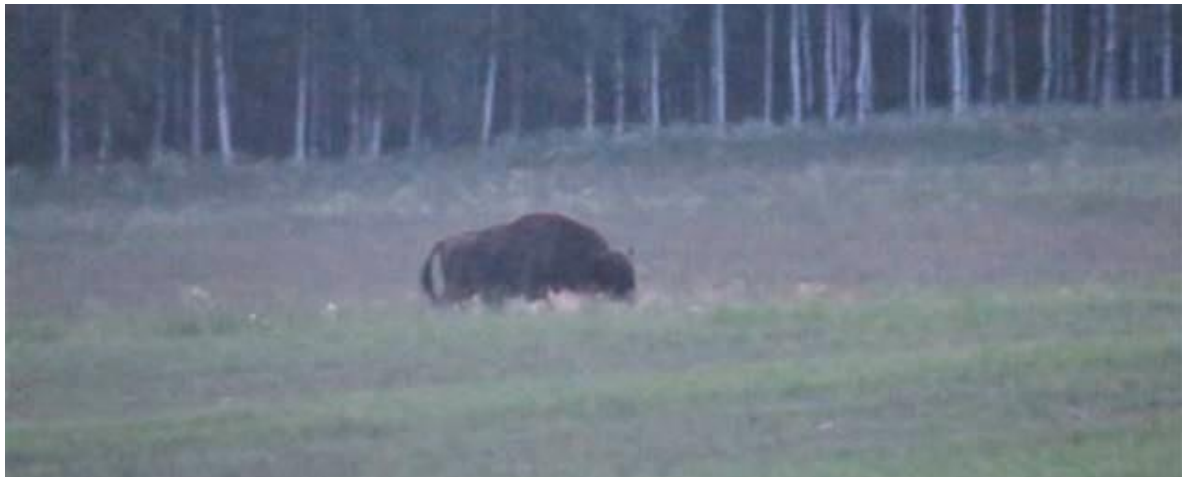
"A bull bison, grazing quietly with swishing tail until the light had gone."

After dinner we drove out to the north edge of the village to some meadows where bison sometimes emerge from the forest to feed at dusk. We waited, while corn buntings sang, great grey shrikes hunted from the overhead wires, a fox stalked through the long grass, a small herd of red deer grazed in the distance, and the calls of corncrake and tree frog grew steadily louder in the fading light. With about a square mile of open ground between us and forest proper it did not seem very hopeful, but then a dark shape appeared at edge of the wood, only 300m away. It was a bull bison, which then wandered slowly out into the meadows, grazing quietly with swishing tail until the light had gone.