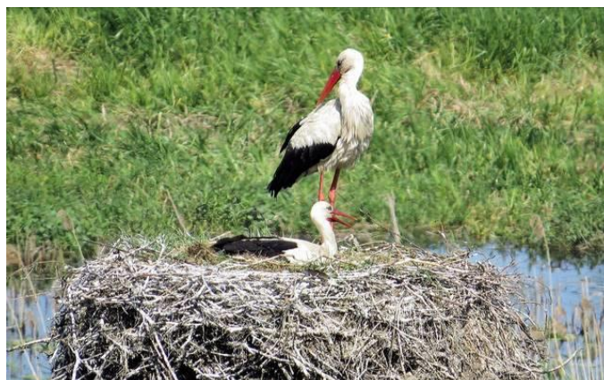
White storks at Goniadz