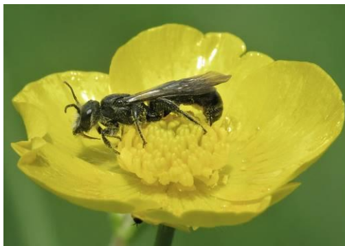
Sleepy Carpenter bee