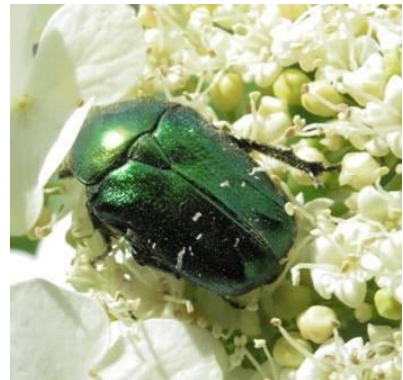
Elk; wryneck; rose chafer.

After dinner we drove south to the Narew river – a good spot for beavers – and walked along an embankment which provided a fine vantage point over the oxbow pools either side. It was a glorious warm evening with just enough breeze to keep biting insects bearable. A chorus of thrush nightingale and bluethroat song entertained us while we waited, and it wasn't long before the first beaver appeared. Soon a second and a third joined it, swimming back and forth, characteristically low in the water, and periodically diving underwater to their hidden lodge. We stood rather conspicuously on the skyline, the beavers curiously watching us as we watched them. As the light faded a spotted crane called close by and as we walked back a corncrake called loudly by the bus.