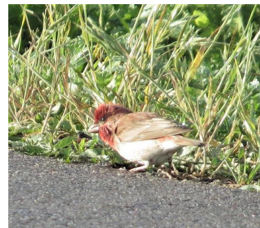
Pronunciation challenge; red-backed shrike, seen daily, and common rosefinch, one of a pair at Dowbarz.