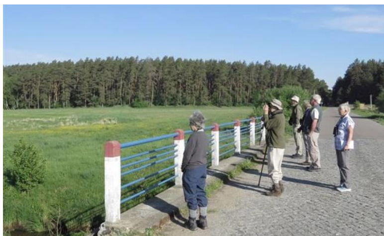
White stork; early morning birdwatching at Dwor Dobarz.