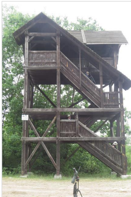
The viewing tower at Siemianowka Reservoir

With bags to pack, only Brian managed a pre-breakfast walk (adding common sandpiper to the trip list) but after loading bags onto the minibus we had time for a final 40-minute walk to the palace park. Here we listened to river warblers for one last time before saying goodbye to Artur and driving on to Warsaw. After a final daily log call at the airport we were soon on our flight back to Luton and onwards to our homes, reflecting on a successful trip, thanks to Artur's skill, knowledge, patience, kindness and homemade cakes, Rafael's steady driving, the hospitality of staff at Dwor Dobarz and Dworek Gawra, Mattheus at Białowieża and all those in Poland who help to protect the wonderful wildlife sites we visited.