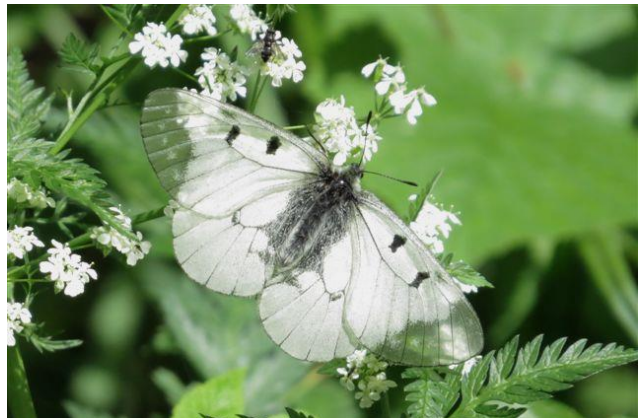
Northern chequered skipper and clouded Apollo.

After lunch we headed south, making a spontaneous pull-off to watch an elk 100m from the road, which led to the discovery of another six clouded Apollos on the verge! Reaching the Narew river we turned upstream towards Cochin and onto a quarry set among rolling arable fields. By now the weather had cooled, rain was threatening, and the hoped-for bee-eaters were not there, so we had to make do with a little ringed plover. Driving back, we stopped at a bridge just inside the National Park. Around 200 terns, mostly white-winged with a few black, hunted insects low over the marsh and nearby fire-bellied toads 'pooped', but the steady rain forced us to move on. Our last stop of the day was at a viewing tower, contemplating the view over another vista of fen and marsh, picking out a distant red deer as snipe drummed overhead.