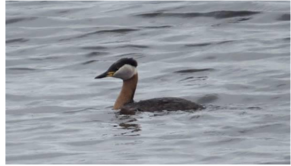
Black-throated diver and red-necked grebe at Białystok fish ponds.

We drove on and by late afternoon arrived at the Dawra Guesthouse in Białowieża village, where we settled in, freshened up and assembled for dinner. Afterwards we were joined by Mattheus, a Białowieża National Park guide, and after a short bus drive and a very short walk found ourselves looking at a hole in a tree where, we hoped, a pygmy owl was nesting. A whistle from Mattheus brought a bird out of the hole and into a nearby tree where we could make out its shape, if nothing else, in the dim light. We then walked to a nearby ride where a different call attracted the male owl, which we saw very briefly flying across the ride.