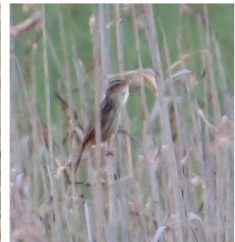
White-tailed eagle; northern dune tiger beetles; aquatic warbler.

After dinner we drove south a little way to Lawaki Fen, 5000 hectares of sedge fen which is home to 2000 pairs (more than 10% of the global population!) of aquatic warbler. The evening was calm, good for aquatic warbler but also good for mosquitoes so repellents and head protection were mobilised. We followed a boardwalk out into the fen and soon heard, low in the vegetation, a song rather like a subdued sedge warbler. The bird crept slowly up the reed stem, showing nicely in the light of the setting sun, before a final flourish of a short song-flight. We heard and saw at least three aquatic warblers near the boardwalk, singing grasshopper and whinchat showed well and a Montagu's harrier drifting across the beautiful sunset ended the day nicely.