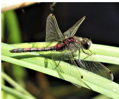
Northern White-faced Darter