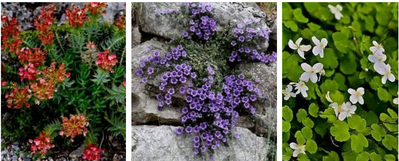
Euphorbia rigida , Campanula andrewsii ssp hirsutula and Thalictrum orientale

Our next stop was in the shadow of a great roadside cliff on the edge of a gorge leading down into Leonidio. Here, where the cliff is predominantly north-facing, we would hope to find a range of specialist plants dependent on the cooler and damper microclimate, seldom if ever subjected to direct sunlight for prolonged periods. This group of plants, chasmophytes, contains yet another collection of endemics as well as more widely tolerant species. It is a wonderful vertical rockery. Both our Golden Drops were there, and Allium subhirsutum . We had close encounters with Jerusalem Sage Phlomis fruticosa and Cistuses not yet in flower, the familiar Salsify and its relative the clear yellow Scorzonera crocifolia . Two beautiful Parnonas endemics, both with silver leaves, would grace any rock garden: the lemon yellow Stachys chrysantha and the grey-blue Campanula andrewsii ssp hirsutula .