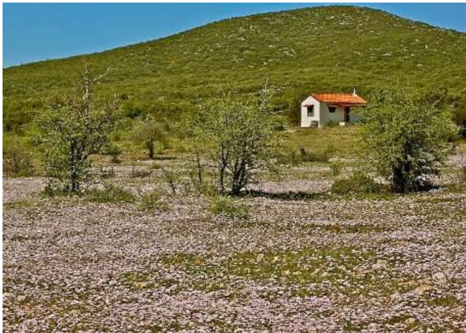
Swathes of Crepis rubra .

A good sized flock of ravens appeared over the hill and we watched them doing aerobatics for a while: how enjoyable it looked! And a short-toed eagle flew over, dangling its feet. Some of the more energetic strolled up the track to where there was an old ruined stone farmstead with threshing floor and vaulted bread oven. There were blue tits nesting in the gable wall. Further along the track Sue stopped again to show us a 'sterna', a sophisticated water catchment system with an ancient vaulted cistern and a drinking trough, built for the roaming flocks of goats which have been an important feature of this landscape for many centuries, and played a major part in creating the ecosystems that we now see. A Peloponnese wall lizard was basking in the sun and seen well and photographed, especially by Susie. The shady wall at the north end of the oldest part of the sterna was a very fruitful place for the botanists, with many species of rocky crevices, including some new ones: a tiny relative of the bedstraws Valantia muralis , a little dark blue speedwell Veronica cymbalaria , a little hairy plantain Plantago bellardii as well as masses of the little Rustyback Fern Ceterach officinarum . Nearby there was a tiny arable field with some oats and barley struggling amongst a wonderful display of arable weeds; Gerald caught a fine specimen of the ascalaphid Libelloides coccajus .