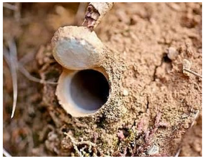
Violet carpenter bee on clover and trapdoor spider's tunnel.

The cliff crevices also brought other pleasing things – clusters of small blue calcite crystals, a blue-flowered shrub Globularia alypum , bright patches of Tassel Hyacinth Muscari comosum , and clumps of a lemon-yellow Golden Drop with orange tips to its flowers, Onosma frutescens , which is endemic to the Aegean region of southern Greece.