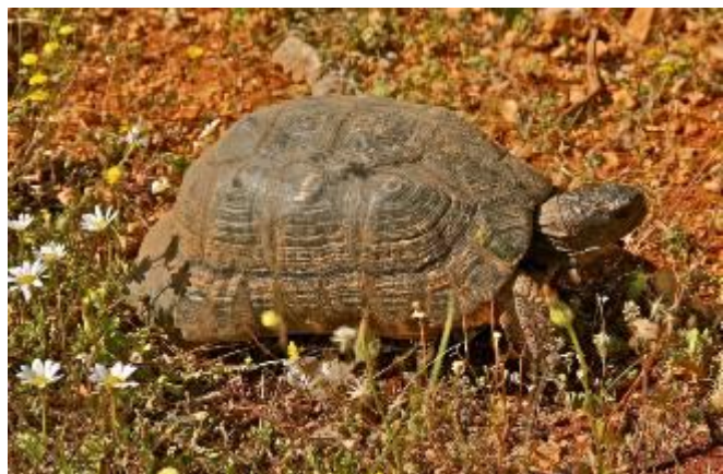
Peloponnese wall lizard and marginated tortoise.