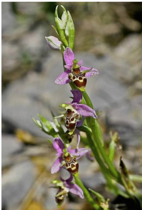
Horned Woodcock Orchid