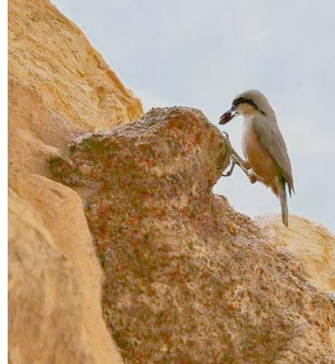
Mycenae: The Lion Gate and rock nuthatch.

There was time for a refreshing drink of fresh orange juice, or a coffee, or an ice cream, then the drive home, and preparation for dinner at a different taverna.