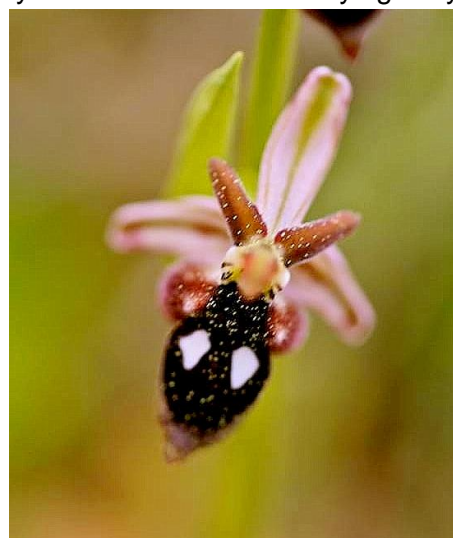
The 'Shaun the Sheep' orchid.

The presence of Sweet Chestnut woods here is accounted for by the ancient soils overlying very localised schistic rocks in the small area around Kastanitsa, so that the influence of the widespread underlying limestone is more remote. Other plants respond to this effect and we found tracts of Bracken Pteridium aquilinum , Algerian Iris Iris unguicularis , a very large and vigorous form of Common Dog Violet Viola riviniana , Leopardsbane Doronicum orientale and Daisy Bellis perennis , none of which would we associate with a free draining limestone soil. At the top of the hill the Sweet Chestnut gives way to the famous Black Pine Pinus nigra and to the Greek endemic Greek Fir Abies cephalonica ; we found several of these almost smothered in common Mistletoe Viscum album , which in Greece, unlike in Britain, is more usually found on conifers. We explored a little at the top of the hill listening to distant goat bells, and found a new orchid, a charming Ophrys, with two white spots on its otherwise almost black lip and which, as Sara pointed out from the photograph she took, bears an uncanny resemblance to Shaun the Sheep! Its identity has yet to be confirmed.