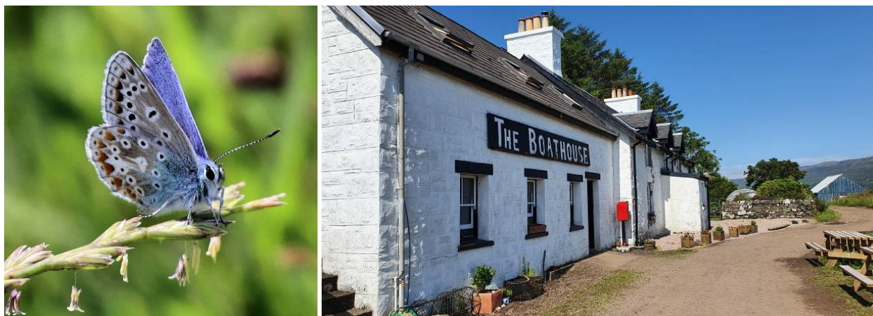
Common blue butterfly on Ulva; The Boathouse, Ulva.