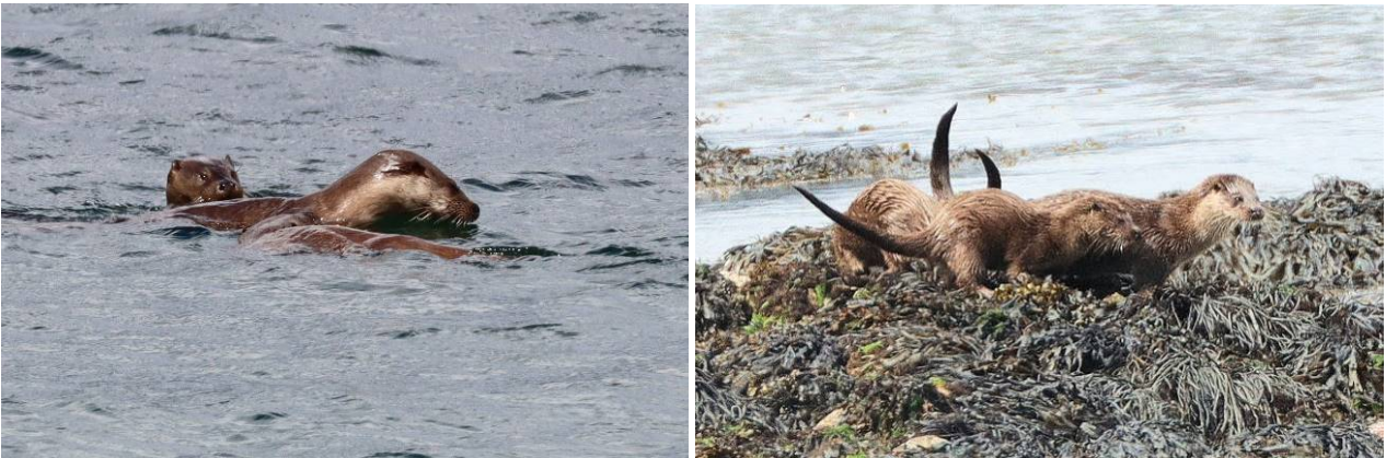
Otters at Craignure.

Common sandpiper and oystercatchers were on the beach at Craignure, plus hooded crow and wheatear. A family party of otters was both on the seaweed-covered shoreline and swimming and fishing in the adjacent sea. Out at sea the group saw two red-throated divers.