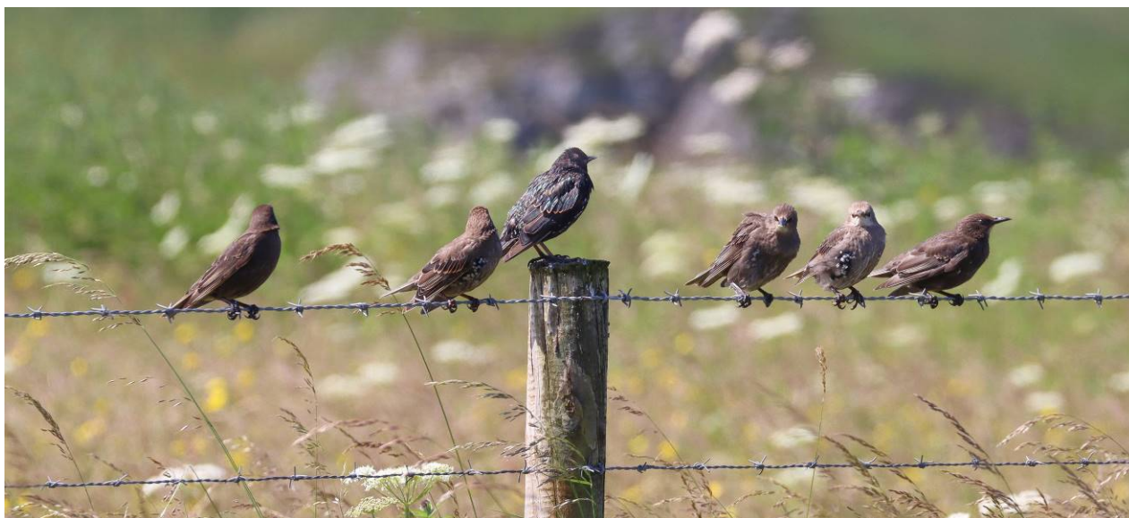
Starlings in a mixture of plumages, Iona.