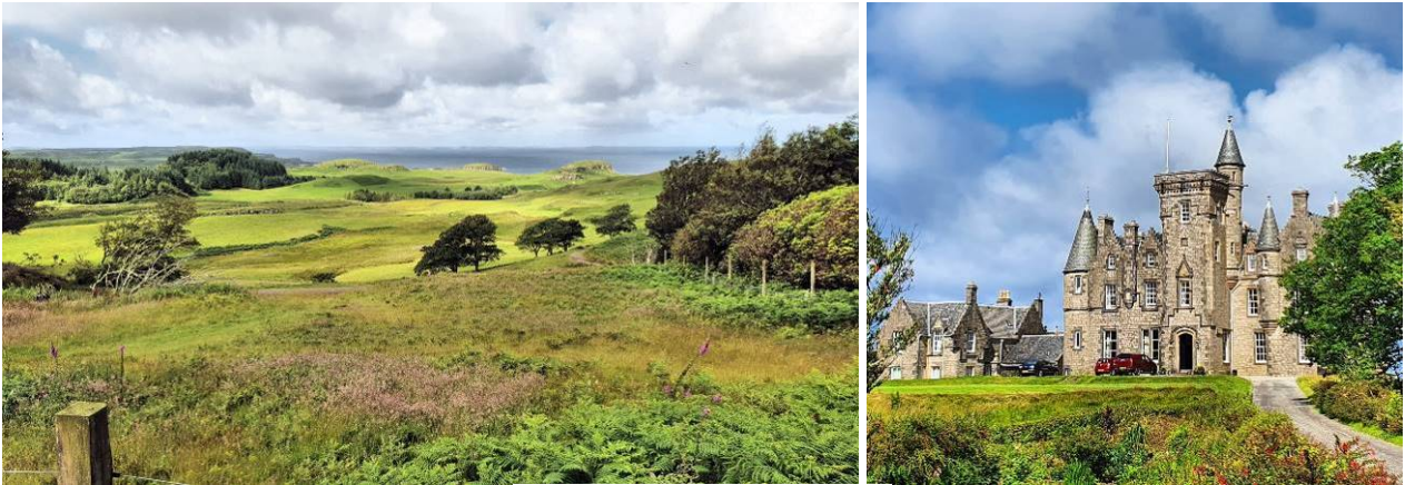
Glengorm, estate and castle.

Today was a short trip to Glengorm Castle and estate, a 19th-century country house just six kilometres northwest of Tobermory.