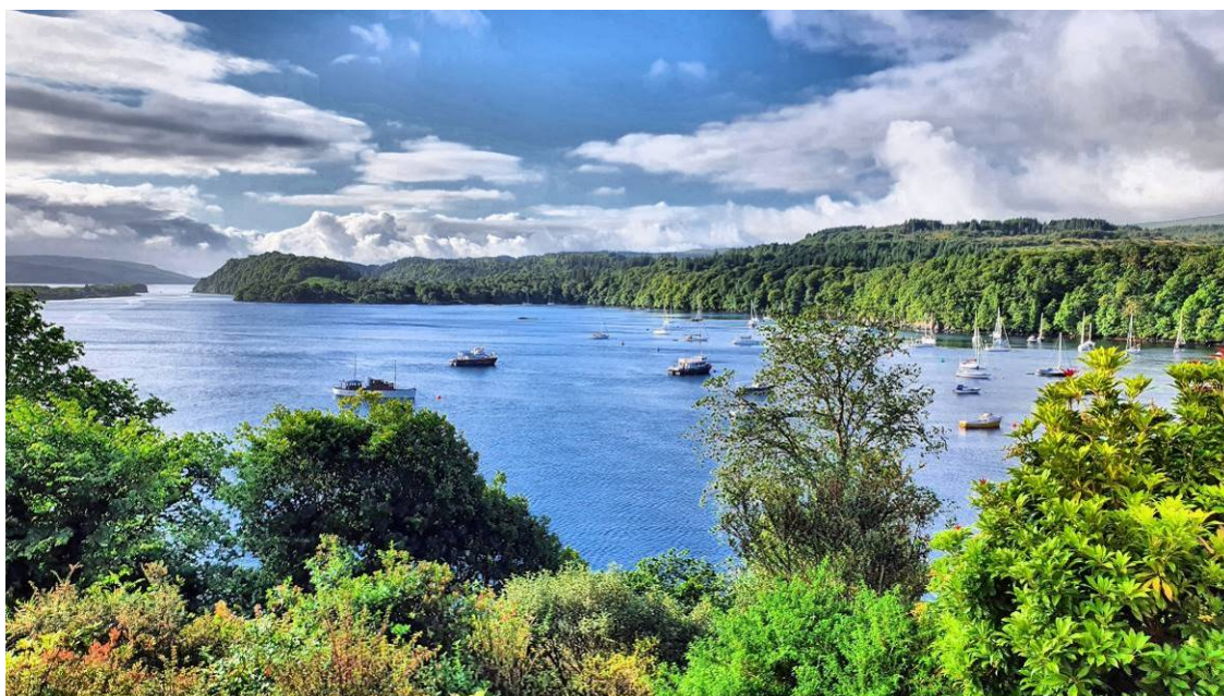
View from Western Isles Hotel in Tobermory (DB).

The holiday was based at the Western Isles Hotel in Tobermory www.westernisleshotel.com