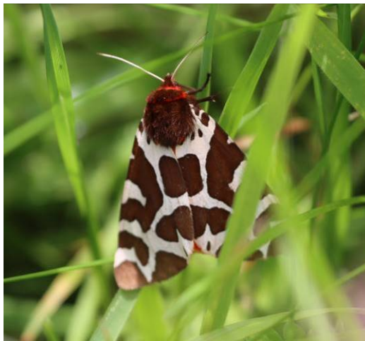
Iona Abbey; garden tiger moth.