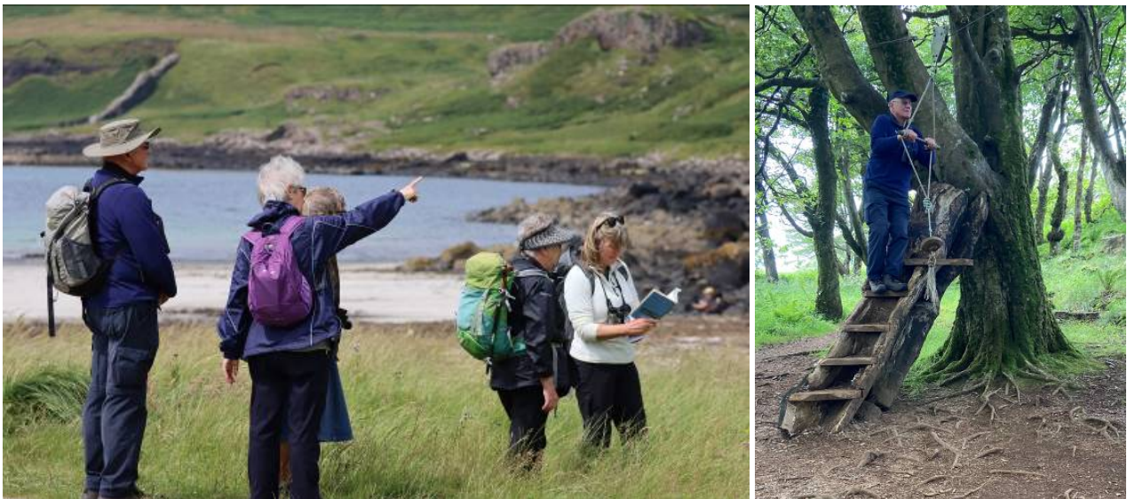
Group members in the field, then relaxing at Calgary.

Later the group was happy to enjoy the Calgary 'Art in Nature' exhibits, natural sculptures set in the lovely landscape here.