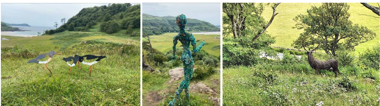
Examples of 'Art in Nature' exhibits at Calgary.