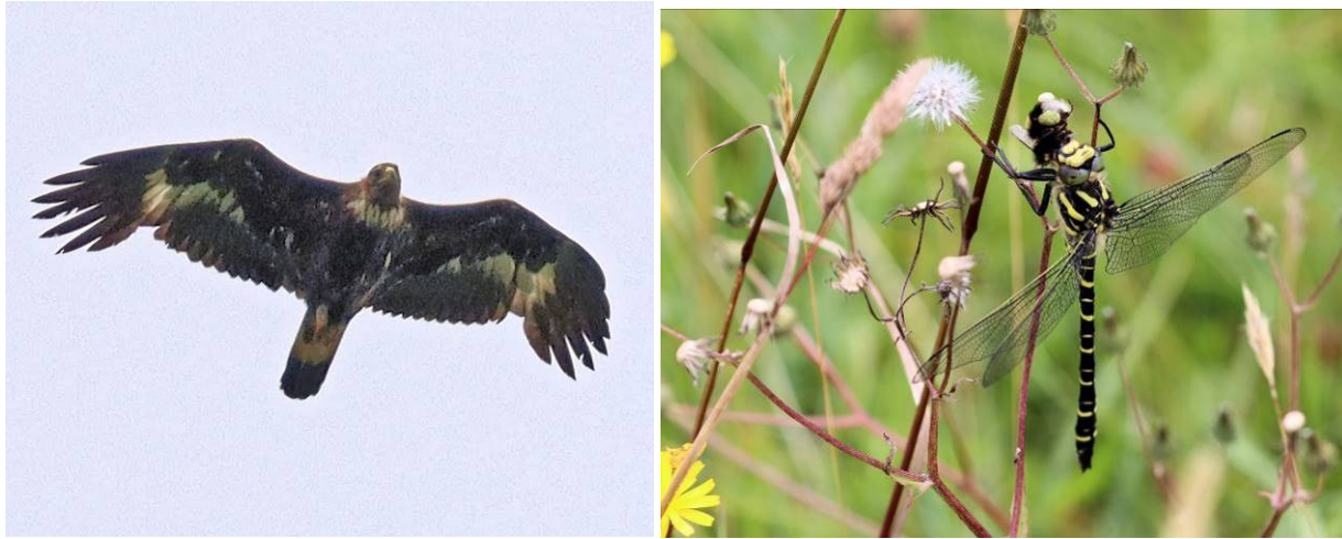
Golden eagle; golden-ringed dragonfly, with a bee.

Later the group was happy to enjoy the Calgary 'Art in Nature' exhibits, natural sculptures set in the lovely landscape here.