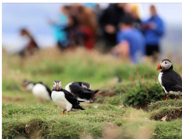
Puffins are very tolerant of people on Lunga; they seem to have learnt that the presence of people helps to keep away predators such as great black-backed gulls.