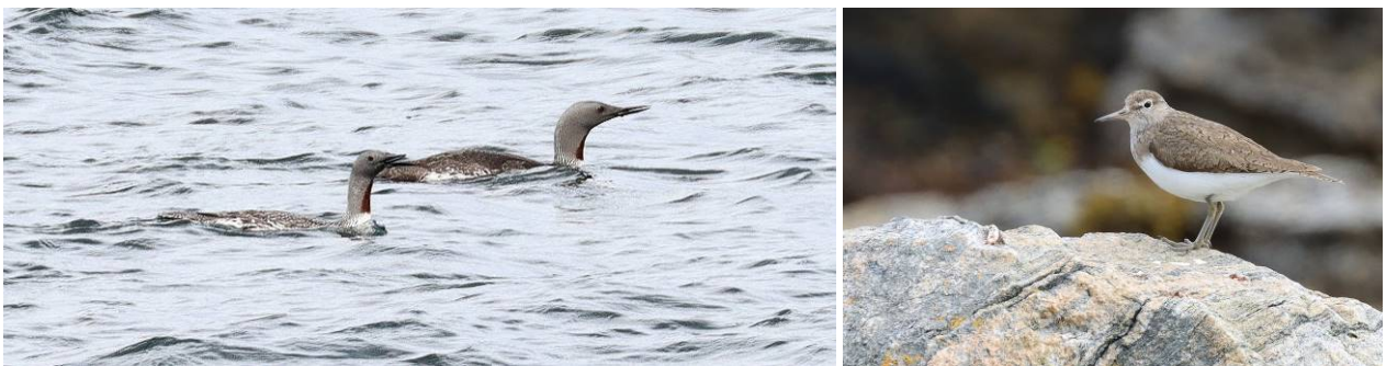
Red-throated divers; common sandpiper.