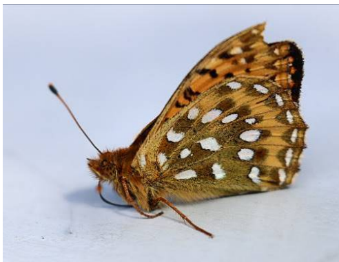
Dark green fritillary, upperside and underside.