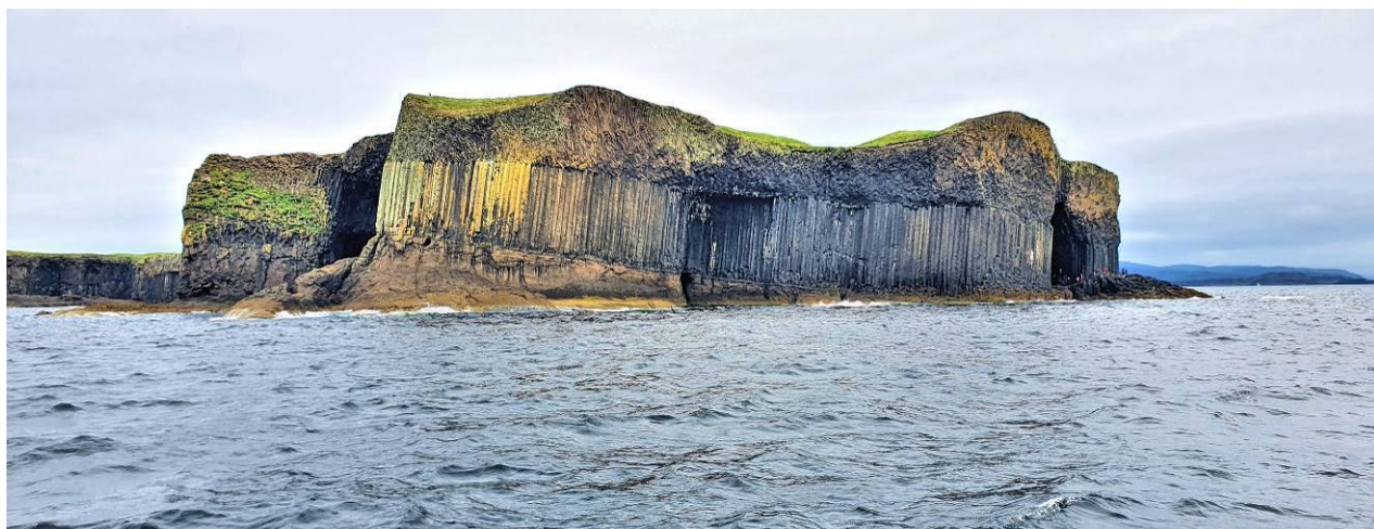
Staffa, from the boat.

Today was the day for the boat trip to the Treshnish Isles on the boat from Tobermory with Staffa Tours. The first visit was to Staffa, including Fingal's Cave, to walk among the amazing volcanic basalt columns.