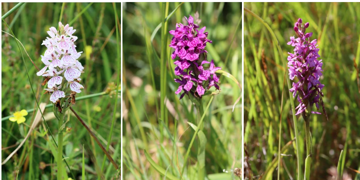
Heath spotted orchid; northern marsh orchid; heath fragrant orchid.