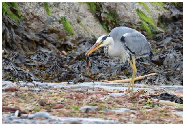
Dunlins and a heron, both at the 'Back of the Ocean' area on Iona.