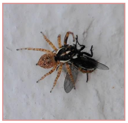
Menemerus semilimbatus, a jumping spider with a hapless fly, by Judith Poyser.