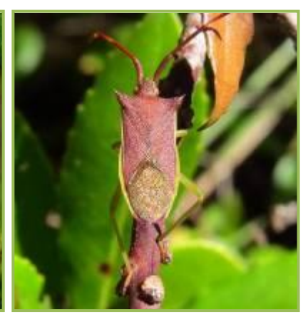
Life cycle of Gonocerus insidiator, a squash bug on Pistacia – from egg, to nymph, to adult.