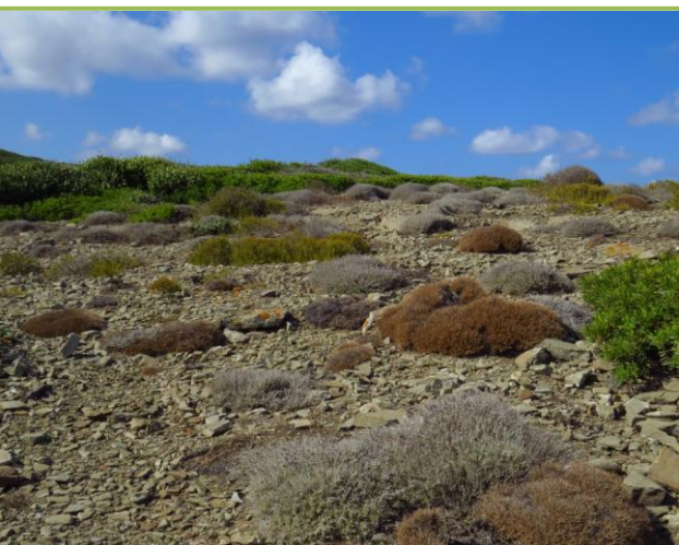
Cap Favaritx and the surrounding 'vegetable hedgehog garden'.