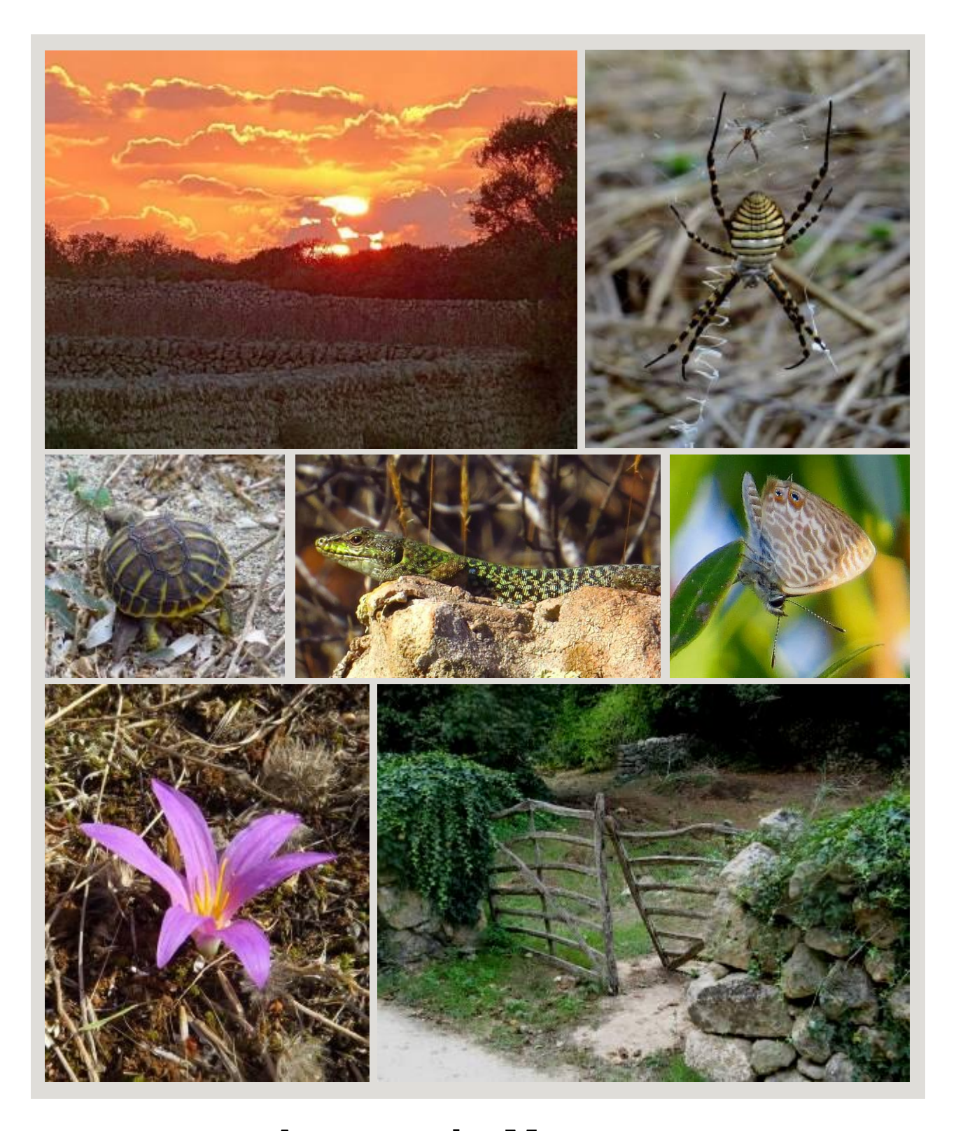
Autumn in Menorca 4 – 11 October 2013