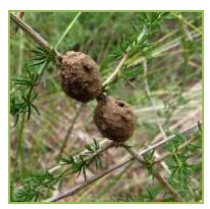
Potter wasp nests.