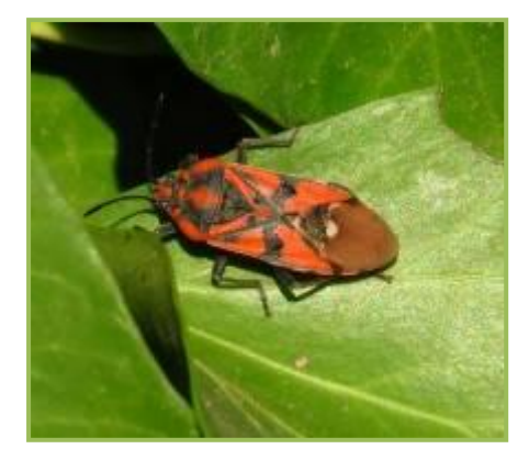
Spilostethus pandurus, a ground bug.