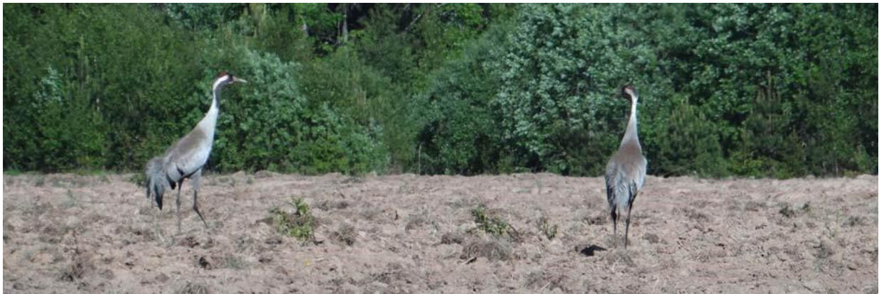
Cranes, near Kolka, 25 May.

Late migration of honey buzzards: around 20 per day, also 30-40 sparrowhawks, some common buzzards. Quail heard and seen in a meadow 15 kilometres from Kolka. Woodcocks and nightjars: several vocalising and one seen in the evening. A stock dove appeared from a nest hole in a pine. High numbers of red-breasted flycatchers in the surrounding areas.