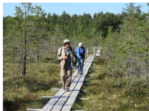
Wood sandpiper, Ķemeri bog, 21 May; group members at Ķemeri bog.

Dunduri fields in the morning: golden oriole, black stork, red-backed shrike, lesser spotted woodpecker drumming. Kalnciems meadows: corncrake calling a couple of metres away, river warbler.