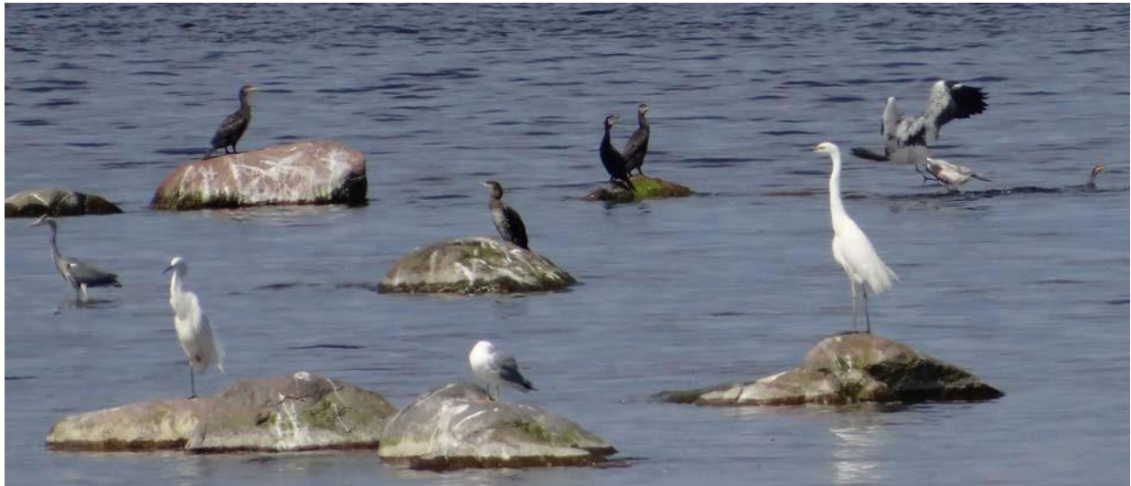
Mersrags beach, 23 May: great white egrets, cormorants and grey heron.

Coast at Mersrags town: hobby landing on beach in front of us; flocks of yellow wagtails.