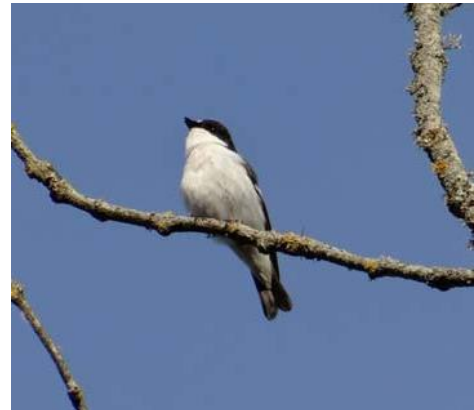
Male pied flycatcher Valguma Pasaule, 21 May

Afternoon in Dunduri meadows and elsewhere in Ķemeri National Park. On the afternoon walk at Ķemeri bog there were wood sandpipers with chicks, cranes, curlew.