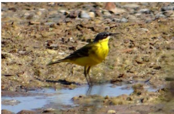
Below: yellow wagtail, grey-headed Scandinavian form thunbergi , Mersrags beach, 23 May.