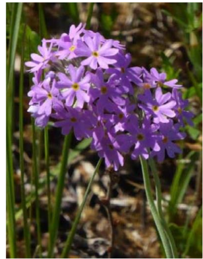
Warty cabbage, alkanet and birdseye primrose.