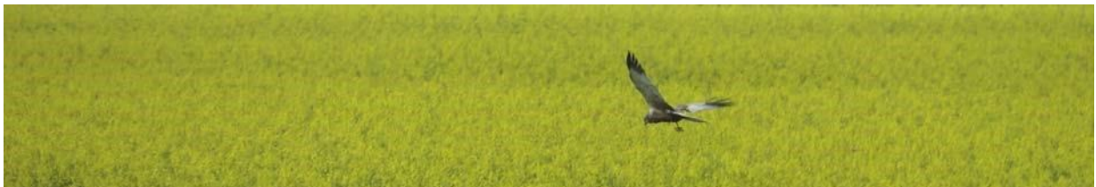
Above: male marsh harrier over a field of oilseed rape, 22 May.