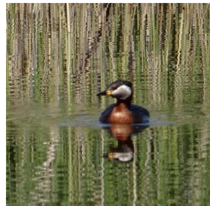
21 May: bean goose, Smarde, red-necked grebe, Kanieris Lake.