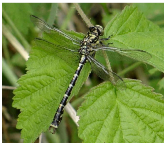
Black-tailed skimmer, Kanieris Lake, 21 May; club-tailed dragonfly, Dunduri meadow, 22 May.