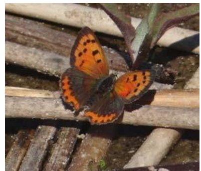
Map butterfly, cemetery near Vidale, 26 May; northern chequered skipper, Sliteres lighthouse, 25 May; small copper, Mersrags beach, 23 May.