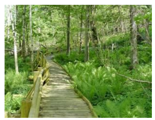
The boardwalk fringed by ostrich ferns (DB)

Most of the group decided to take the circular boardwalk route through the forest where we found a wide variety of plants, typical of old undisturbed forest. Male ferns and common marsh ferns were growing in great profusion but there were also scores of magnificent ostrich ferns with their open demeanour resembling huge buckets. Wood and yellow anemones, ramsons, yellow archangel and woodruff were all in flower and we were delighted to find the pink-flowered perennial honesty, coralroot bittercress, common toothwort, bogbean and yet more delicate birdseye primroses. Wood warblers and blackcaps were in song throughout the walk but the undoubted bird highlight was a splendid male red-breasted flycatcher which David spotted low down in the forest. We didn't actually see any mammals here but did find fresh pine-marten casts on the boardwalk then a much larger pile of wolf dung complete with thick hair, probably from wild boar.