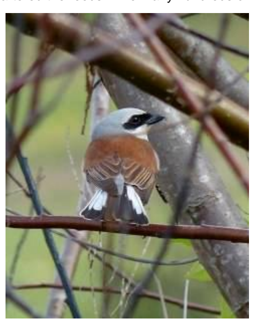
Red-backed shrike (DB)

After all this excitement we drove on towards the observation tower, passing an open meadow where a hunting marsh harrier startled four goldeneye and a male teal. At the tower itself four more great white egrets were feeding in with the Heck cattle and Konik ponies, a pair of buzzards displayed over the forest and a golden oriole sang from the woodland edge. At least seven redbacked shrikes were perched up in full view on a nearby fence but our attention was quickly taken by a black woodpecker in flight across the open fields before disappearing into the forest.