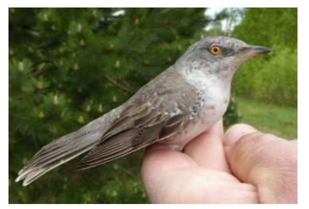
Barred warbler (MC)

A sunny yet cool start to the day, turning overcast with occasional spots of rain but remaining bright with temperatures up to 17C. The pre-breakfast patrol turned up a real goodie in the shape of three bee-eaters over the USI campsite plus ten hawfinches and a female golden oriole, while Susie and Ken spotted eight goldeneye offshore by the hotel. News reached us that a barred warbler had been caught in the mist nets so our first unscheduled stop was back at the Cape to see this bird, a stunning male in the hand showing slate-grey plumage and a striking yellow eye – this a 'lifer' for most of the group. While we were there we also saw another wryneck perched up and in flight, three more hawfinches and 40 yellow wagtails on the short turf.