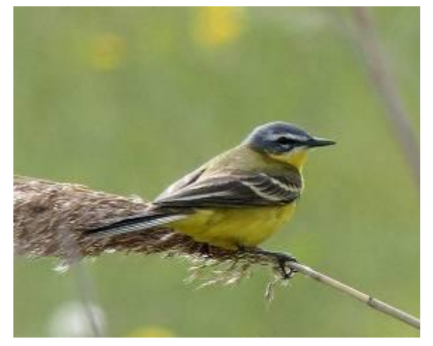
Blue-headed yellow wagtail (DB)

An overcast and chilly start to the day as we left Valguma Pasaule and drove north. Our first stop was an area of marsh and reedbeds on the coast at Mersrags where citrine wagtails had recently been reported.