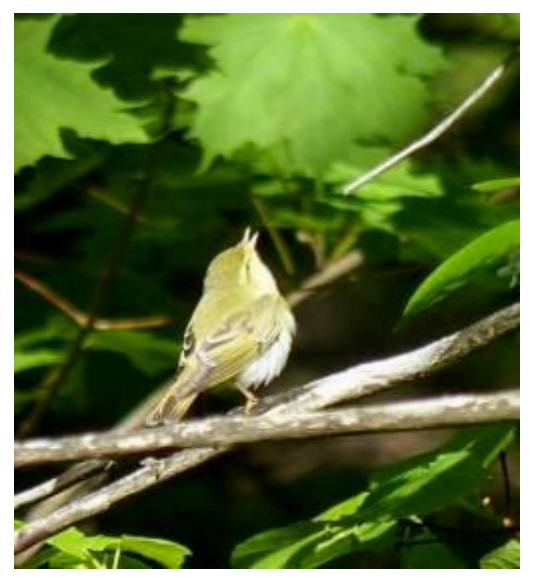
Wood warbler (DB)

Two red-breasted flycatchers were in full song on the woodland edge but proved very difficult to track down in the canopy. Coming out of the wood into an open meadow we were delighted to encounter sheets of flowering oxlips. A common buzzard was hovering over the grassland and we watched it swoop to catch a small mammal and make off with it, probably to feed hungry chicks. Another raptor hoved into view, this one a dark honey buzzard, a wryneck called from the woodland edge and seven more black-throated divers flew over – presumably migrants taking a short cut across the land. Swifts and swallows were hawking insects in the skies above, another majestic great white egret flew over, our first cuckoo called and a woodlark sang alongside a skylark above the meadow. By this time the rain had abated and it was quickly brightening up – time for our first butterfly, a wood white resting and well camouflaged on flowering meadow saxifrage.