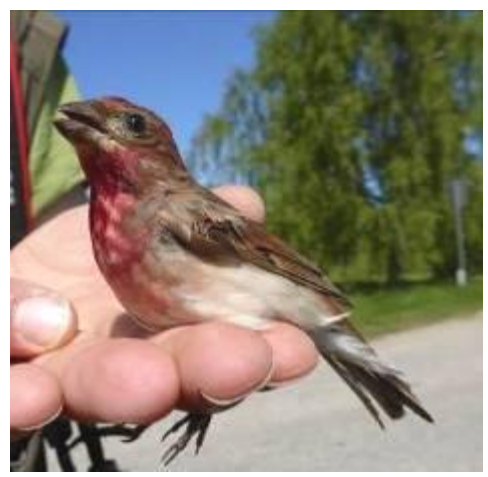
Scarlet rosefinch (HC)

A wet scrub-lined ditch runs through this area of meadow and provides a magnet for migrants but we were still very surprised to hear that Helen had seen a superb adult male bluethroat showing his red throat patch set in brilliant blue. Unfortunately the bird quickly disappeared back into the scrub defying all our attempts to relocate it. Helen and Malcolm later saw both male and a female fly over the meadow and briefly display but that was the last sighting.