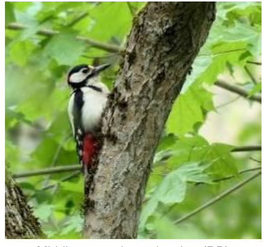
Middle-spotted woodpecker (DB)

We decided to have our picnic where we thought there was a good chance of seeing raptors. Almost on cue a female lesser spotted eagle flew out of the trees, over our heads and, amazingly, was joined by the much paler male as they soared together before drifting out of view. A white stork was joined by its mate on a huge nest by a local farmhouse, at least two cuckoos were calling over the meadows and two yellowhammers perched obligingly on nearby telephone wires. The fields here were well known to the leaders and supported many flowering clumps of globeflowers (now really rare in UK) plus a few early purple orchids.