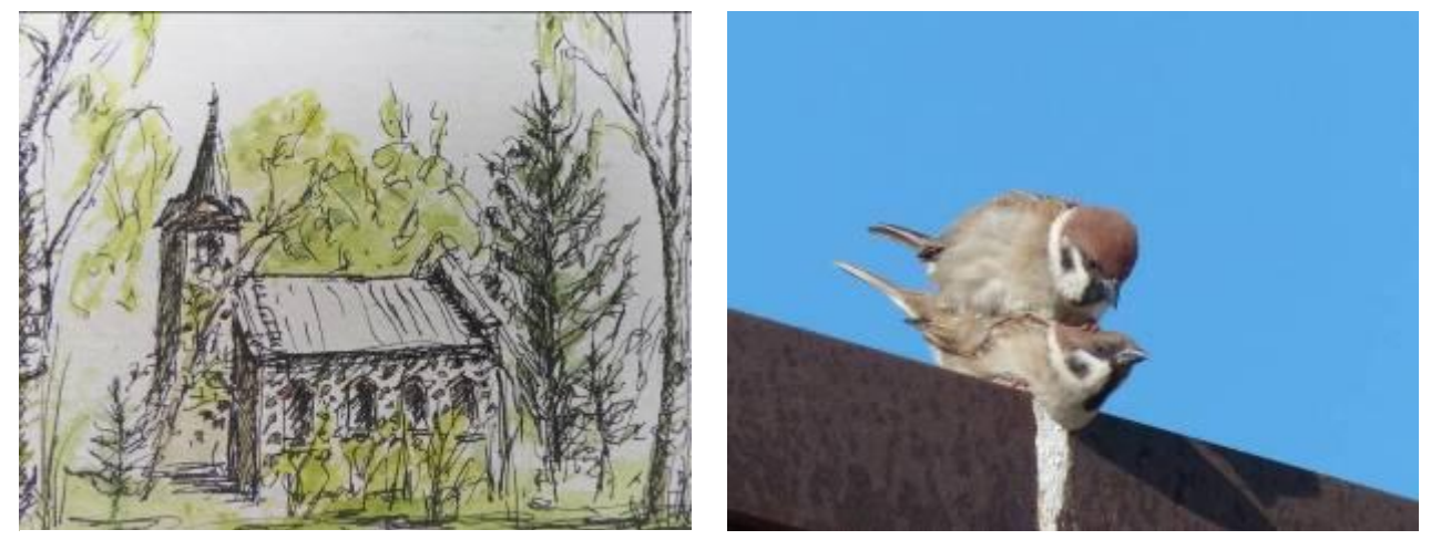
The Lutheran church in Kolka (ST) and tree sparrows (DB)

Well before breakfast Karlis and Colin went up to the Cape to open the mist nets and see what migrants were passing through. A golden oriole was singing from the trees around the Lutheran Church and a hoopoe was seen disappearing into a ruined building. Back at the hotel Susie found two tree sparrows on a neighbouring roof, ably captured on camera by David.