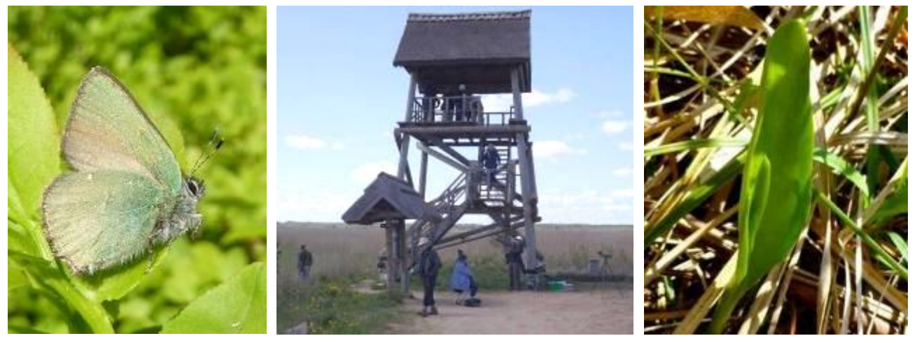
Green hairstreak (HC)

We decided to have lunch at one of the observation towers overlooking Lake Kanieris and Rob drove the bus to the tower to unload the lunch and chairs. On the walk in from the road and through the shelterbelt there were yet more wood warblers, chiffchaffs and willow warblers in song while a bittern boomed loudly from the reedbed. The track was lined with flowering oxlips, Solomon's seal, white and yellow anemones plus ramsons or wild garlic, while attending butterflies included wood white and green hairstreak. On the edge of the reedbed an area of drier grassland was being invaded by juniper scrub (rare in the UK) and growing under the scrub were delightful stands of birdseye primrose and common milkwort. A large number of dragonflies were on the wing, mostly brilliant emeralds, but also four-spotted chasers and a single ruby whiteface.