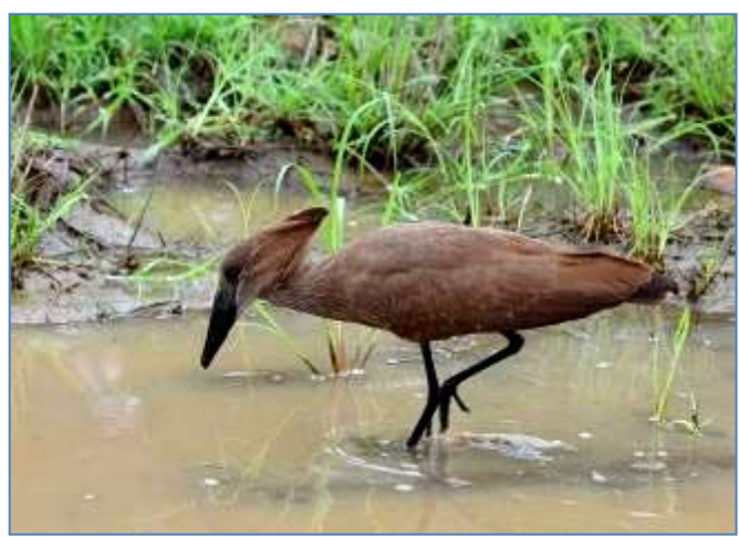
African Fish Eagles and Hamerkop.

Up until now we had been having a wee bit of meal disruption due to a restaurant staff strike in the Park, so we opted for a picnic lunch on the stoop of my cottage. After lunch we spent a couple of hours in the afternoon at the Lake Panic bird hide. Goliath, Grey, Green-backed and Squacco Herons were seen as well as African Jacana, Black-crowned Night-Heron, Little Egret, Hamerkop, Grey-headed Gull, Malachite and Pied Kingfishers, and a couple of Bushbucks with their young.