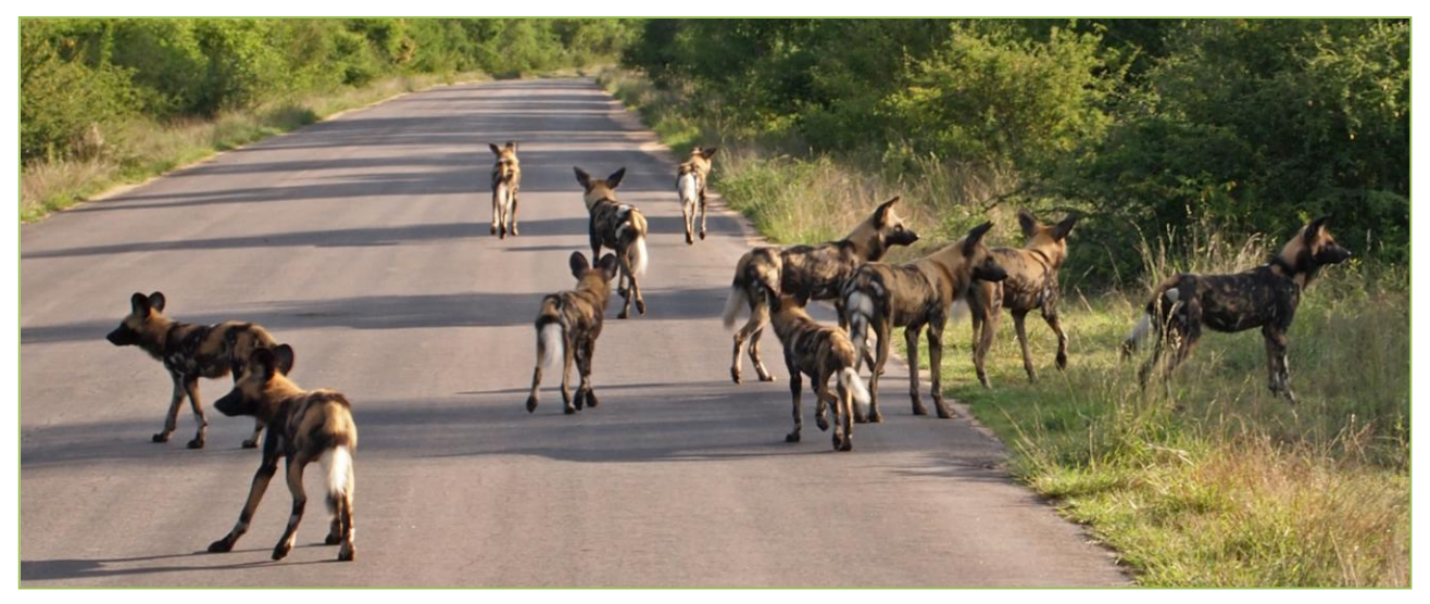
African Wild Dogs on the hunt.

Our Wild Dog sighting was over a forty five minute period as we followed the pack of 11 dogs down the road. They were actively hunting, and as soon as a Kudu was flushed from the bushes, off they went in pursuit. Our Leopard sighting was also an extended viewing, which was great. The old male Leopard was hunting along the road verge until he gave up and settled down in the shade of a Natal mahogany tree. Just after we left the Leopard we came across a large herd of Cape Buffalos wallowing at a waterhole.