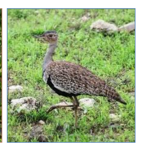
White-backed Vulture, Yellow-billed Hornbill and Red-crested Korhaan.

After breakfast we went for a birdwatching walk around the camp and some of the birds that we saw were; Chinspot Batis, Burchell's Starling, African Hoopoe, Grey Turaco, Grey-headed Sparrow and their overseas friends the common English Sparrow, Red-billed Buffalo Weaver, Dark-capped Bulbul, White-breasted and Scarlet-chested Sunbird, Little Swift, Natal Francolin, Yellow-billed Kite, Bateleur, Diderik Cuckoo, Golden-tailed Woodpecker, Crested Barbet and Lesser-masked Weaver.