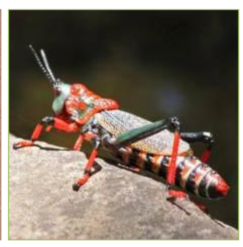
Tree Agama Acanthocerus atricollis , Dung Beetle (crucial to the Park's ecosystem), and Milkweed Locust Phymateus morbillosus