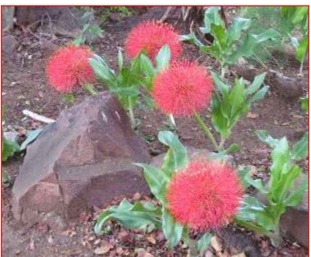
Baobab tree Adansonia digitata and Fireball lilies Scadoxus multiflorus.

We sat and soaked up the magnificent view from the restaurant deck at Olifants Camp, watching the river below.