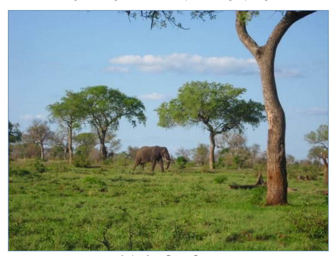
A view from Satara Camp.

On the way out of the Mount Sheba Reserve we saw some Oribi and a Common Duiker as well as a few wild/feral horses. We drove through to Dullstroom for our lunch at Harry's Pancakes and then went through to an area of wetlands, trout ponds and mountain grassland. Yellow-billed Duck, Red-knobbed Coot, White-throated Swallow, Buff-streaked Chat, Bokmakierrie, African Stonechat, Grey Heron, African Spoonbill, Yellow-rumped Widow, Fiscal Shrike and a couple of Grey Rheboks were seen. From Dullstroom we drove through to J'Burg's International Airport for the group's flight home.