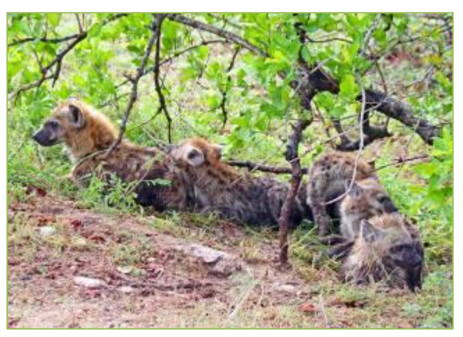
Spotted Hyena pups and 'babysitter'.

We had a good breakfast at the Afsaal picnic spot, where we saw Southern Masked Weavers building their nests and Yellow-billed Hornbills watching out for unattended plates. En route back