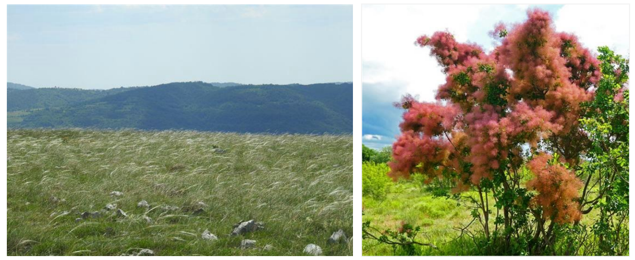
Sub-Mediterranean dry grassland near Movraž (DS); smoke bush (JC).

From here we moved to the very open area of the dry grassland, the landa carsica of Kuk. Mid-May is an excellent time of year to see the flora of this habitat before it dries up, and we saw the goldendrop Onosma stellutata (formerly O. javorkae ), more silky greenweed, Jurinea, horseshoe vetch, dittany and common rock-rose, swallow-wort, smokebush, rue, rock buckthorn, Dorycnium, white wormwood, cypress spurge, three-toothed orchid, mountain kidney-vetch, and the tiny but abundant umbellifer honewort.