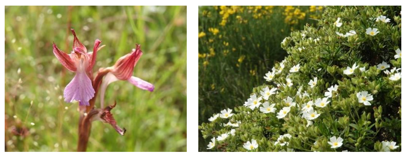
Pink butterfly orchid Anacamptis papilionacea; Montpellier cistus (DS).

The bird fauna on Kamenjak is not particularly abundant, but tawny pipit, wheatear, and red-backed shrike were all seen well as we arrived, together with a few pallid swifts which were seen racing around close to their colony in a sea cave, though they were not seen visiting the site. Winter storms seem to have swept away the old nests from the exposed cavities in the cliff-face, dumping large cobbles, some weighing the best part of a kilogramme, onto ledges five metres above the sea. Barn swallows were evidently nesting in the old military bunkers close to our van while cirl bunting, nightingale and subalpine and Sardinian warbler were seen and heard in the Phillyrea and prickly juniper scrub that covers much of the peninsula. Several Mediterranean shags and a few yellow-legged gulls were almost the only birds seen on the sea. Butterflies on the wing included common swallowtail, wall brown, painted lady, marbled white and eastern baton blue.