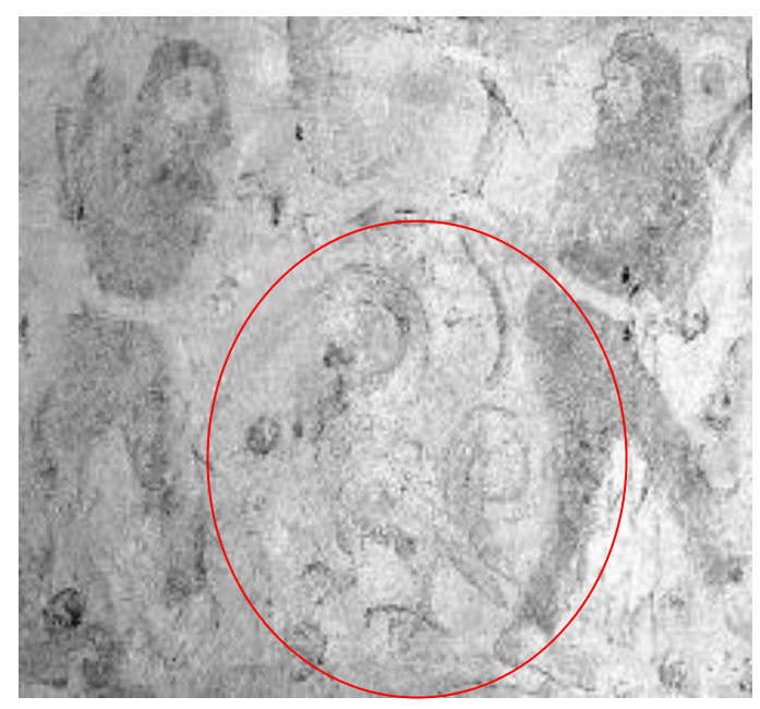
The badly deteriorated image (here ringed in red) of what appears to be a Bald Ibis ( Geronticus eremita ) on the wall of the church at Hrastovlje.

Our first stop was at the Romanesque church at Hrastovlje (the village has only a Slovene name as it never had an Italian minority during its history and falls outside the bilingual area), one of the most famous cultural sites in Slovenia which draws thousands of visitors a year. Dating back to the late 15<sup>th</sup> century, the tiny