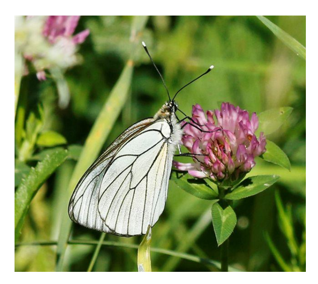
Black-veined white Aporia crataegi (JC).