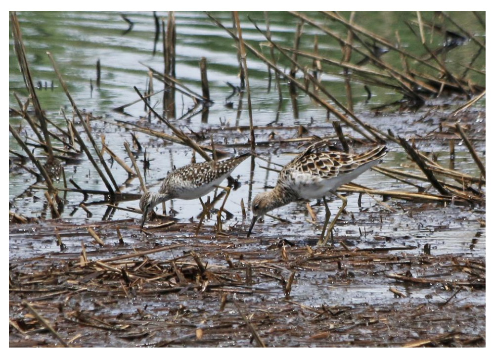
Wood sandpiper and ruff, seen at the Škocjanski zatok/Val Stagnon reserve on 15 May (JC).

By now it was time to make our way to the airport just a quarter of an hour away to catch the late afternoon flight back to London from Trieste. 'Working' the weather had not made things easy during the week, with hail and heavy downpours inland but we had managed to avoid getting caught out in any of them, taking advantage of the decent dry weather that is usually to be had on the coast.