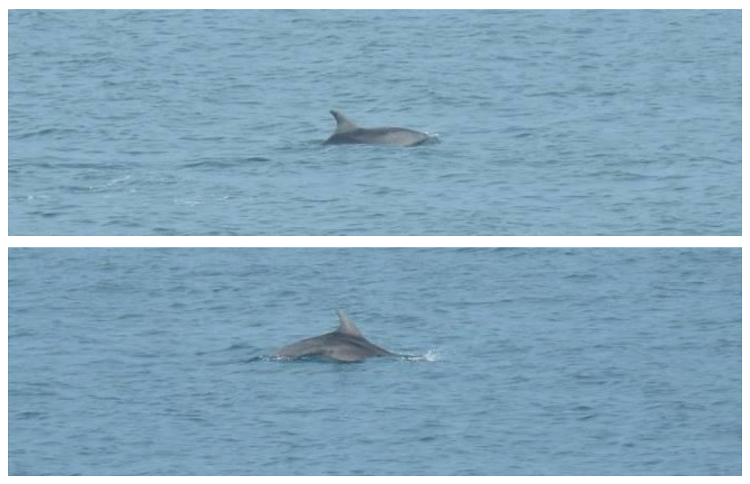
Two views of bottle-nosed dolphins offshore (DS).

Other birds were seen and heard as we walked through the scrubland beside the sea including red-rumped swallow, bee-eater, corn bunting, tawny pipit and Sardinian warbler. Perhaps the most spectacular and exciting sighting, however, was of bottle-nosed dolphins, at least two passing close offshore. This species is increasing in number around the Northern Adriatic and is being closely monitored by photography, with subsequent identification of individuals and family groups, although unfortunately our photos were not sufficiently detailed to allow us to identify the individual dolphins involved.