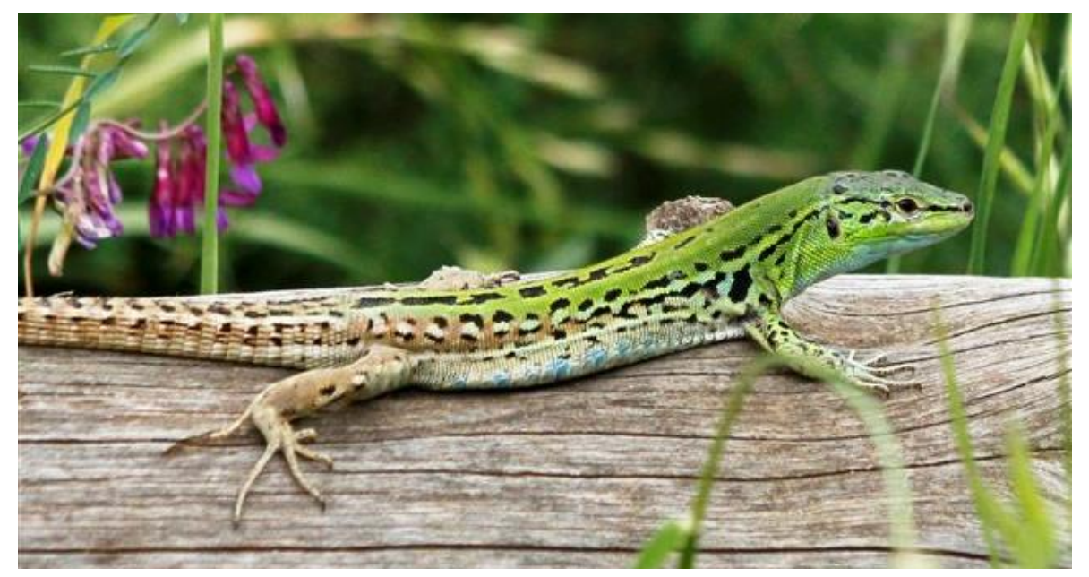
Dalmatian wall lizard, "probably well-habituated to the many people who frequent the site" (JC).

Wild sage, white horehound and the very attractive canary clover were also seen as well as lots and lots of large quaking and hare's-tail grasses, both favourites in dried flower arrangements, although here they were looking nice and fresh and green. Beside the sea there were stands of rock samphire. Invertebrates of interest included several carpenter bees Xylocopa sp. and the common Egyptian grasshopper Anacridum aegyptium in the scrubland. The scrub close to the sea held several tame Dalmatian wall lizards, probably well-habituated to the many people who frequent the site, especially during the summer months.