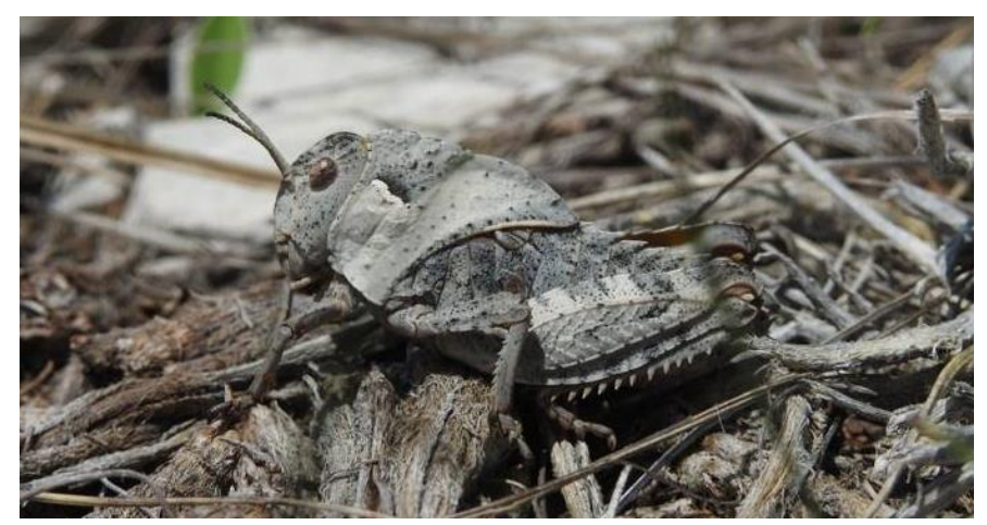
Eastern stone grasshopper Prionotopis hystrix (DS).

Birds were rather again rather scarce but included skylark, woodlark and whinchat as well as northern wheatear and mistle thrush. The most interesting element was searched for high and low until we finally came across one – a rare grasshopper, the spectacular but threatened eastern stone grasshopper Prionotopis hystrix . This species is widespread on the steppe in Asia but survives only as a relict in various dry grassland habitats in central and southern Europe including the Karst. The butterflies and moths seen included Berger's clouded yellow (much commoner here than pale clouded yellow as the former's larval food plant of horseshoe vetch is abundant), scarce swallowtail, small heath and Adonis blue.