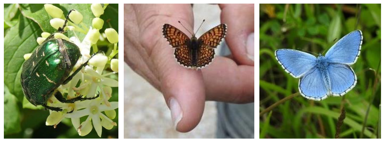
Rose chafer (JC), a tame Glanville fritillary (DS) and Adonis blue (DS).

Among them were a couple of very attractive hybrids with the green-winged orchids on the site. Recent systematic changes have seen both species moved to the genus Anacamptis . A. morio usually completes its flowering period a month earlier than A. papilionacea but the specimens of A. morio in deep shade at the base of the scattered prickly juniper had only just finished flowering, therefore overlapping with the first blooms of A. papilionacea .