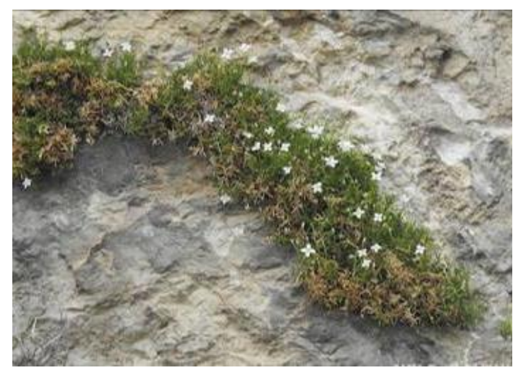
Tommasini's sandwort Moehringia tommasinii (DS).

The pair of ravens on the large rock above the hotel had two very large chicks in the nest, close to fledging, together with 'wild' rock doves on the rock-face and serins in the cliff-face scrub. Blackcap, nightingale, melodious warbler, red-backed shrike and cirl bunting were all seen or heard in the rough grassland and scrub on the ground east of the hotel itself. Adriatic lizard orchids were coming into full flower on the hotel's crazy golf-course. Moving round past the pumping station on the River Mirna it was pleasing to note the large numbers of house martins back at their nests. These returned rather late to the colony this spring. Moving on past the woodland beside the river we hit a lucky streak with both lesser spotted and middle spotted woodpeckers seen in quick succession. The latter are fairly recent colonists of the Mirna Valley having spread from further east in recent years. Hawfinches and golden oriole were also seen, but poorly.