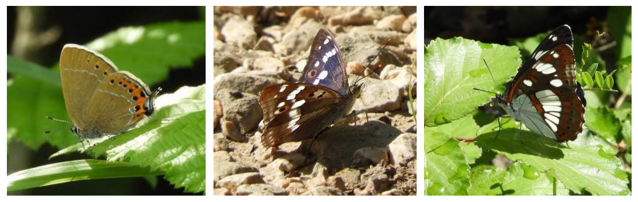
Black hairstreak, lesser purple emperor and southern white admiral (DS).

Our last full day in Istria and although the changes to the programme during the week as a result of the weather had played havoc with our programme, Saturday started sufficiently fine in the morning for us to visit the subalpine Karst grassland above Buzet. Initially we headed back into Slovenia to visit the interesting area close to the village of Movraž, in particular the flat and overgrown area of farmland between Movraž and the village of Dvori on the border with Croatia. This is a polje , a very flat area of hot and fertile soil covering about 100 hectares left behind by the erosion of the overlying limestone. Like much of Istria, Movraž has suffered depopulation but is rather closer to Koper-Capodistria and has managed to maintain a semblance of an agricultural community, its hay cut and wheat fields cultivated. This said, parts of the polje are now covered with blackthorn Prunus spinosa and poplar Populus sp. scrub. The bird community thus includes scrubland species such as red-backed shrike, melodious warbler, cuckoo and nightingale (heard) and agricultural land with species such as corn and cirl buntings, white wagtail and turtle dove.