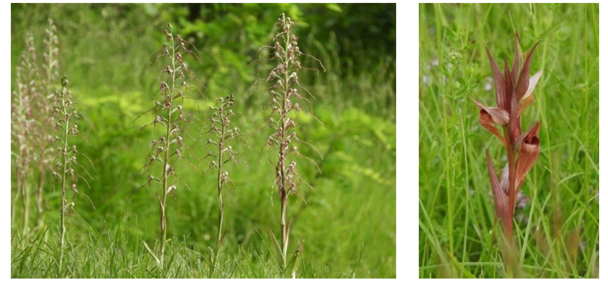
Adriatic lizard orchids and long-lipped tongue orchid (DS).

The rocky verges along the track were rich in wild flowers including yellow vetchling, spiny asparagus, dittany, silky greenweed, basket-of-gold alyssum (going over) and the occasional slender broomrape. We also saw the the cow-wheat Melampyrum carstiense and Adriatic lizard orchid. The latter is spreading and is becoming ever-commoner in recent years.