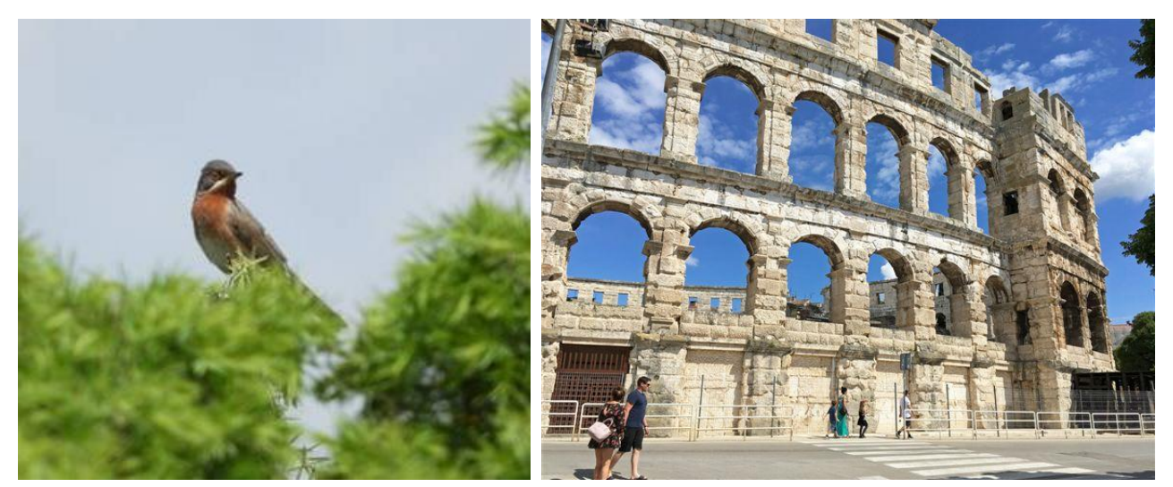
Subalpine warbler (DS).