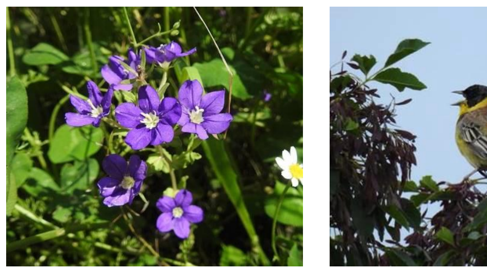
Large Venus's looking glass; black-headed bunting (DS).

Returning towards the hotel we walked up by the Mirna River from the coast inland. Birds seen on the lagoon near the mouth of the river included yellow-legged gull and Mediterranean shag of the desmaresti subspecies, the juveniles of which have white bellies, and the birds may eventually be elevated to full species status.