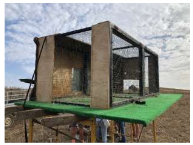
Original Andalucian model

Back at the rescue centre the incubated eggs begin to hatch and the rescued chicks are hand reared. Volunteers feed them tiny lumps of meat. When old enough they will be taken to the hacking area.