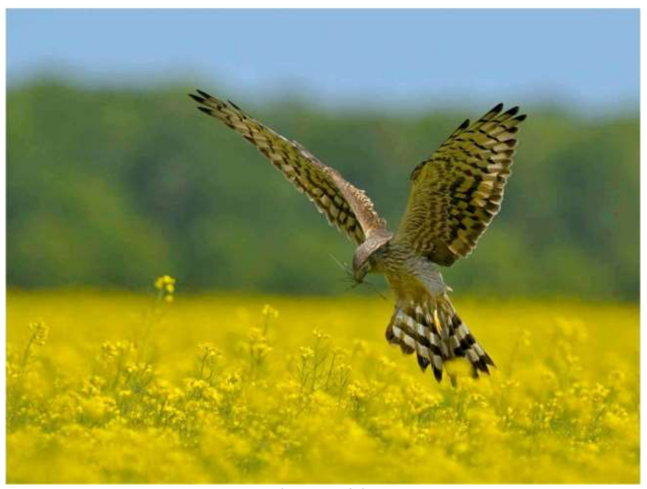
Female montagu's harrier

...and more so when a male brings prey for the female, which he drops and she captures in mid-air before taking it to the ground to prepare for feeding.