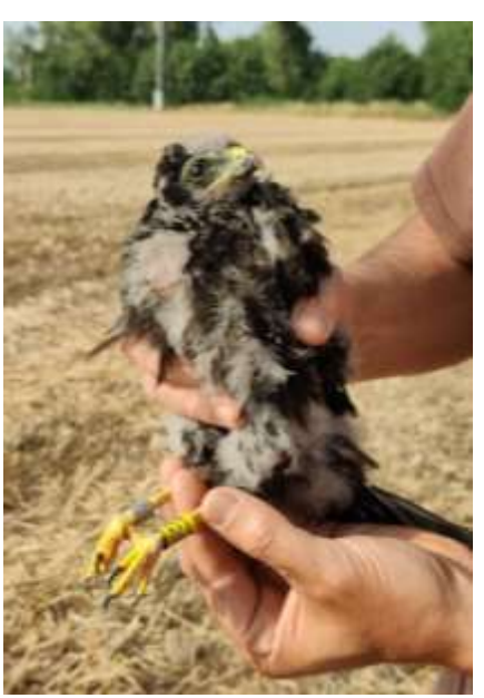
Hen harrier chick