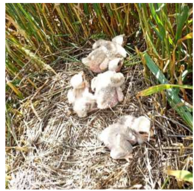
Hen harrier chicks