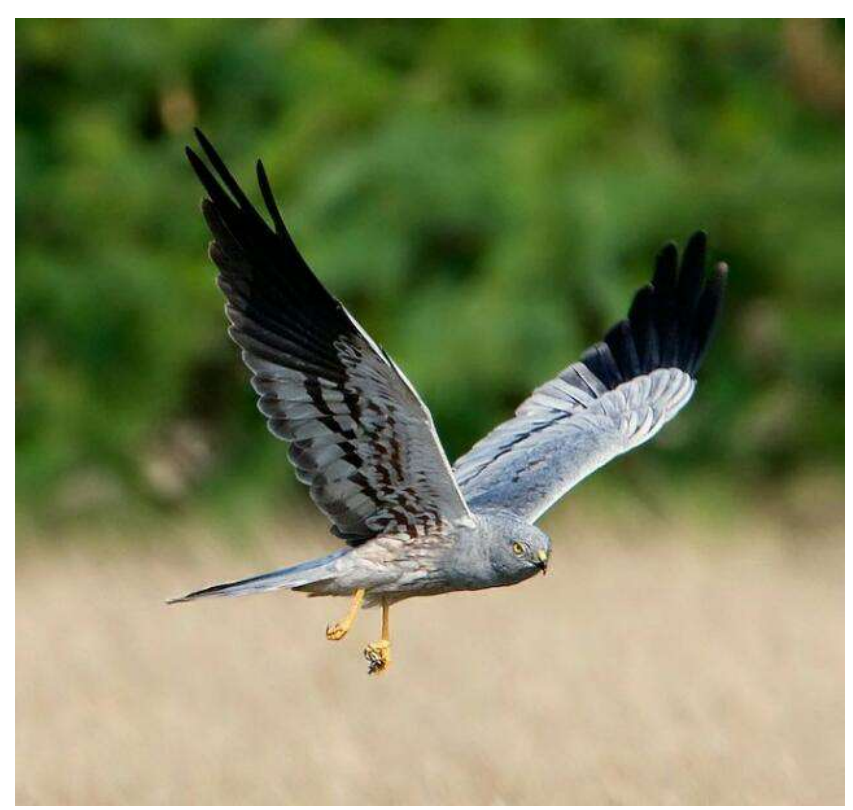
Male Montagu's harrier