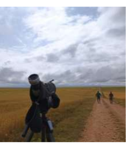
So far it has been a very dry spring and the cereal is low and sparse. Disappointingly, some of the past breeding areas have already been reaped, for use as forage.