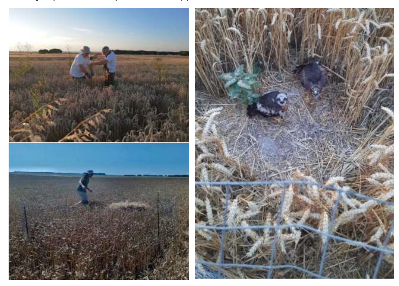
Meanwhile several volunteers begin building a large holding structure for the hacking, modelled on one used by colleagues in Andalucia.

Farmers are contacted to ask when they plan to harvest, and to negotiate their collaboration. In June and July volunteers fence off nests which require protection. They step lightly to avoid trampling the crop, before surrounding the nest with protective fencing. By now it is very hot: mid or upper 30s.