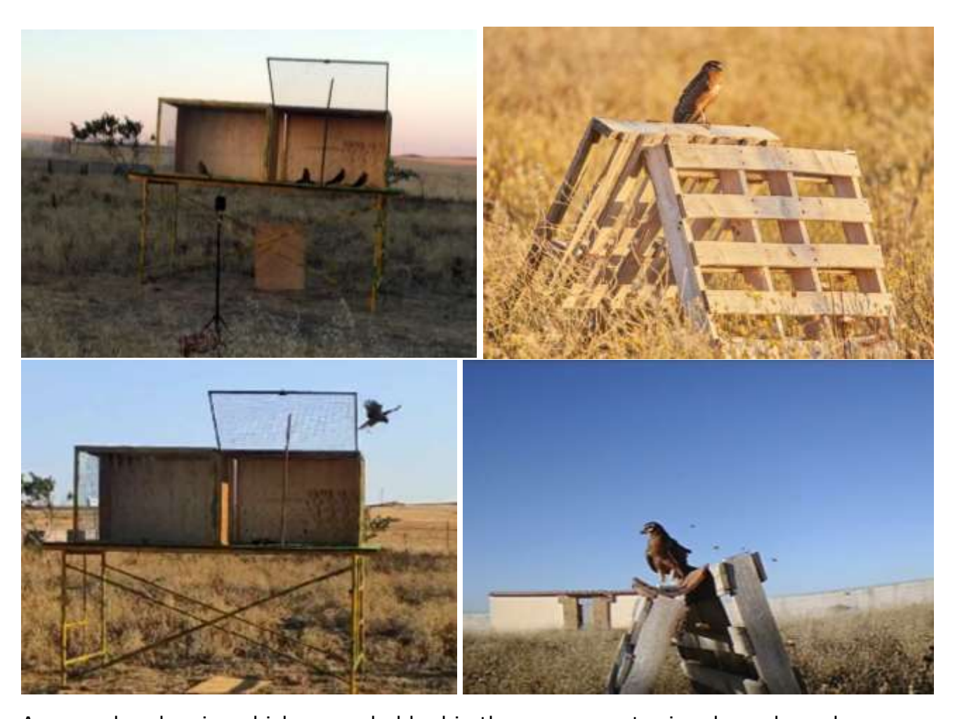
A young hen harrier which was rehabbed in the rescue centre is released nearby.