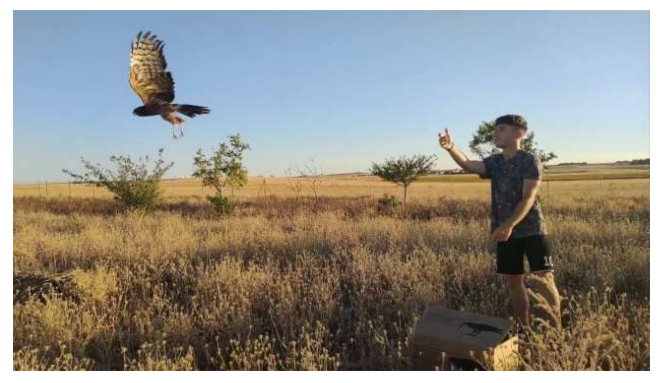
The 2023 Salamanca SEO Harrier Campaign comes to an end.