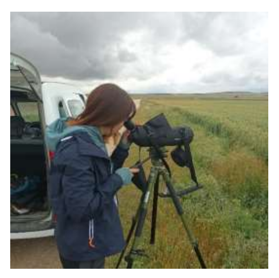
These territories become apparent when either female or male are seen in the area with nesting material...