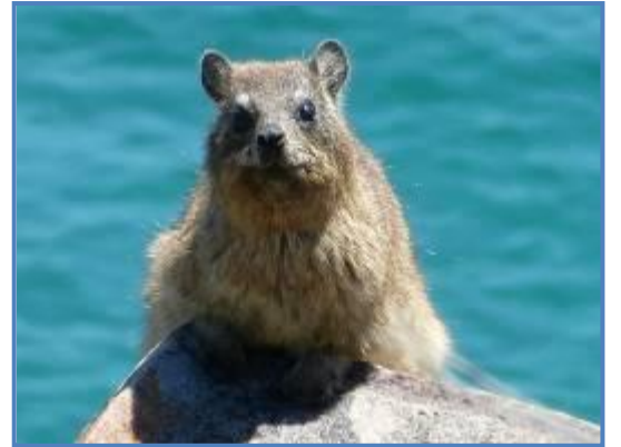
Rock Hyrax or 'Dassie'.

Fortified for our last full day on the Garden Route by another great breakfast, we set off for the Robberg Peninsula. The day was promising to be sunny, and proved to be the hottest of our time here reaching the low 30°s (Celcius). As the terrain along Robberg is uneven, some opted to walk from the peninsula along the beach towards Plett. The others set off together around the peninsula seeing several new birds: Cape Grassbird, Neddiky, Cape Rock Thrush, Bar-throated Apalis and Southern Boubou among the scrub and rocks, Swift Tern, Grey and White-fronted Plovers and Cape Cormorants along the shoreline. We looked down on the Cape Fur Seal colony with Southern Rock Agama, Cape Skink and Rock Hyrax on the warm rocks. There were also plenty of plants in flower: Cobra Lily Chasmanthe aethiopica , Pig's Ears Cotyledon