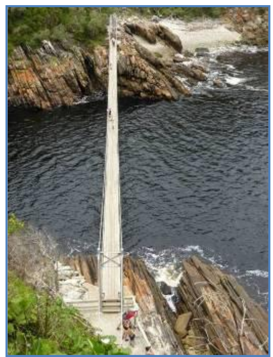
Storms River suspension bridge.

Moving on to the Tsitsikamma National Park we drove down to the coast where, checking through a flock of roosting terns, we found Swift, Common and Sandwich Terns while a family of Rock Hyraxes were sunning themselves on the rocks below us. Leaving the minibus we walked the trail to the suspension bridge over the Storms River, seeing Blue-Mantled Crested Flycatcher and the misnamed Lemon Dove. We had a picnic lunch by Thunderbolt rocks, where huge waves crashed onto the shore, sending up great clouds of spray. We were entertained by Humpback Whales breaching and spouting just offshore before we departed for the drive to the Zuurberg Mountains and the Eastern Cape for the second part of the two week trip.