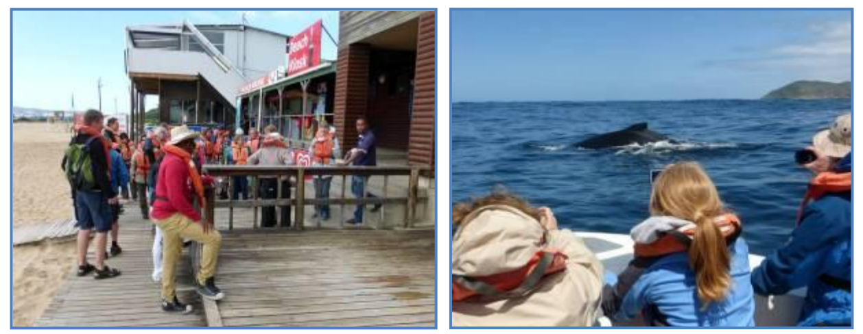
Preparing to board the boat; and watching Humpback Whales.

We awoke to a glorious day and another delicious breakfast! As this was our 'free' day, some took a long walk down the main beach at Plettenberg Bay and others joined a whale-watching boat trip which was launched off Plettenburg beach by tractor. A highlight of this was a Humpback Whale with its calf alongside the boat for many minutes. The mother emerged to blow every second or third rise of her calf and every 75-80 of our own breaths [counted by Jenny]. Sooty Shearwaters skimmed the waves and terns flew out to the Robberg Peninsula, where we saw the large Cape Fur Seal colony and an unexpected Elephant Seal, a rare visitor to these shores. After the boat returned, by speeding up onto the cleared beach, our group met and we had a café lunch by the beach – giving whale-watchers time to find their land legs again!