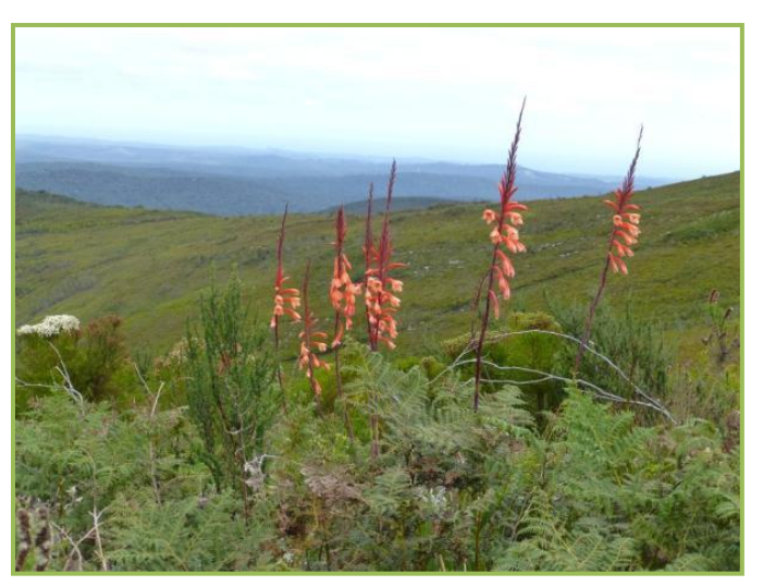
Some of the pink Watsonias.