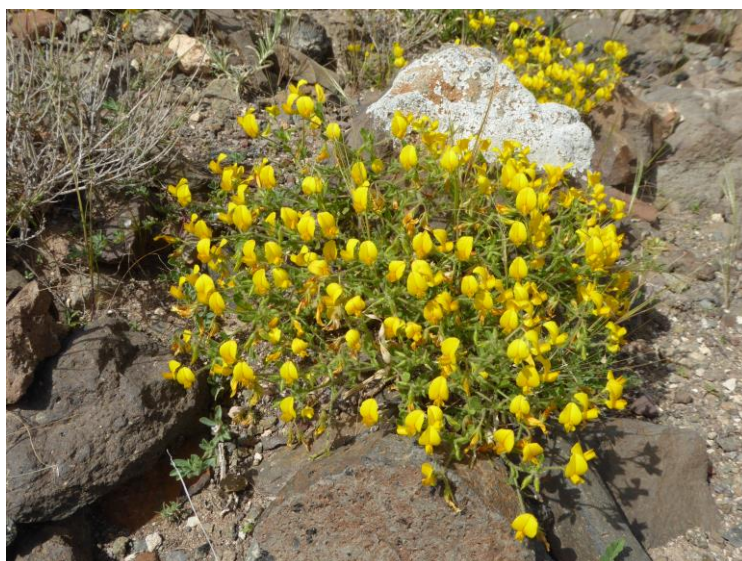
Lotus lancerottensis (DC).