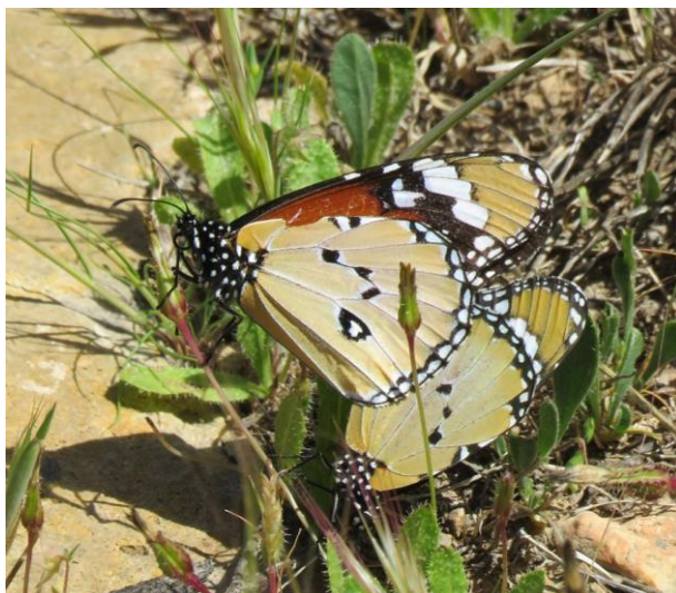
African blue tit and plain tiger butterflies.

After lunch we drove a short distance to the next valley, this one with much introduced acacia (hence known to me as Acacia Valley). Wintering blackcaps and resident Sardinian warblers were common, and there were lots more plain tiger butterflies. We could again hear canaries singing high above us, but none showed properly. There was a surprising abundance of flower spikes of Dipcadi serotinum , a somewhat underwhelming member of the lily family resembling a brown-flowered bluebell. Having seen this plant only once before on the island, I was surprised to see so many in one place.