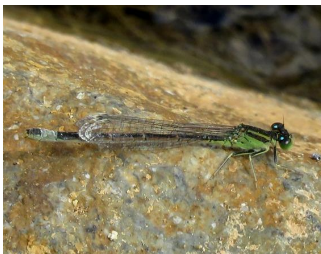
Saharan blue-tailed damselfly (TW).