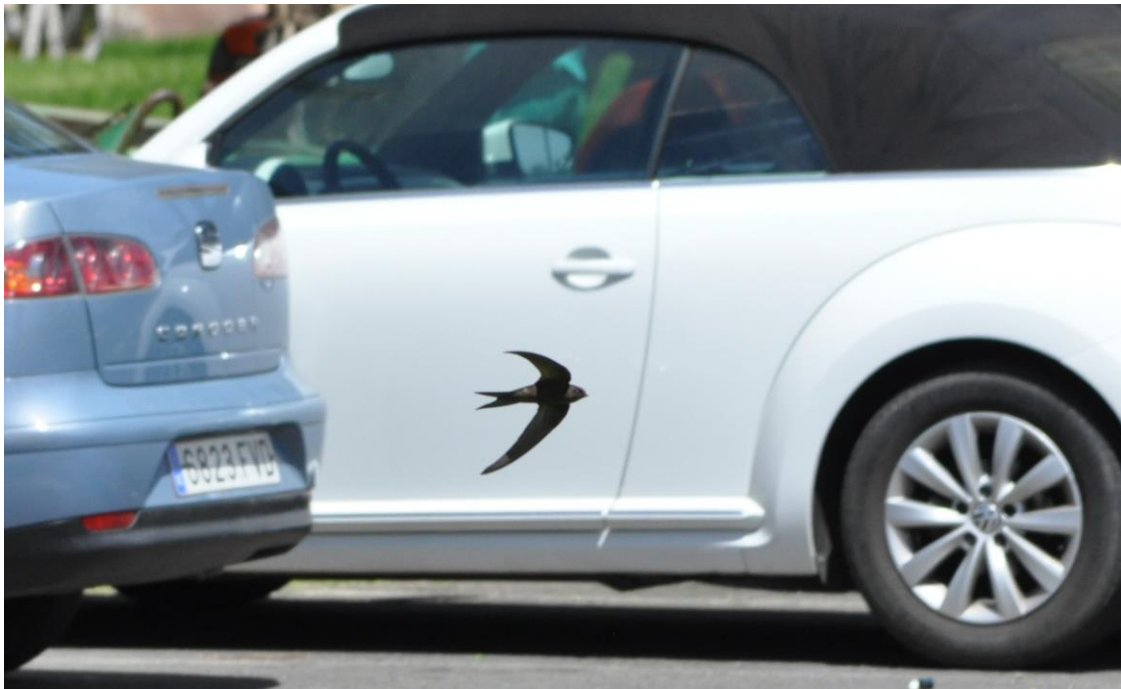
Plain swift dodging the traffic in Jandia resort (DC).

We lunched in the shade of the palm trees, to the squawking of parakeets. There were no less than four hadada ibises, and several pairs of sacred ibises were nesting in a tall palm. This species is also introduced but has now been admitted to the official list of wild birds on the island as it seems to have a self-sustaining population. Not quite done yet with exotic animals, we stopped off at the car park at La Lajita zoo to look for red-vented bulbul, another species that has established itself on the island. No luck unfortunately, but there were more hadada ibises and a giraffe came into view briefly!