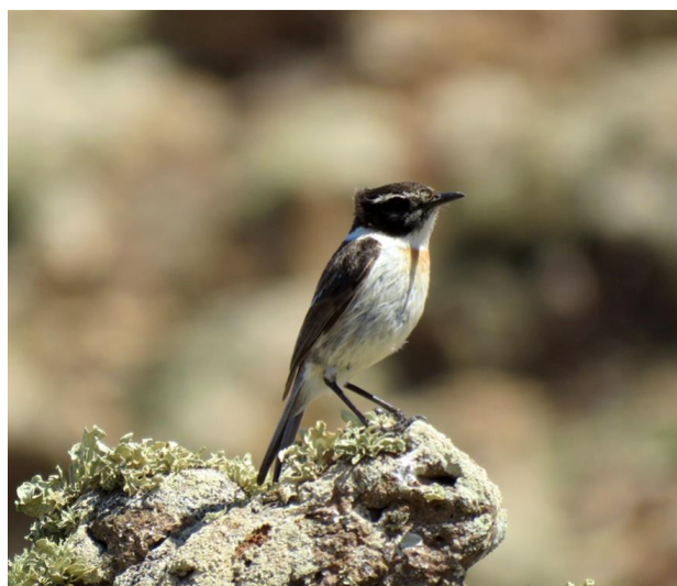
Laughing dove and Fuerteventura chat (TW).