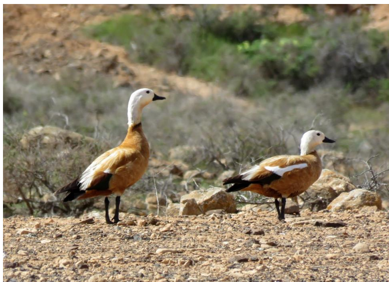
Ruddy shelducks (TW).

We enjoyed a leisurely lunch on the sun-loungers under the shade of the palm trees by the villa's swimming pool. Suitably refreshed we then drove south through the village of Tetir and parked near the end of a desolate track. From here we walked a few hundred yards to the edge of the canyon at Barranco de Río Cabras where we could look down over a small wetland with its marsh and tamarisks.