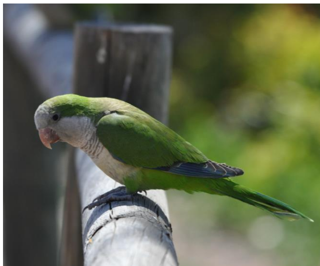
Ground squirrel and monk parakeet.

As soon as we had parked at the head of Verdant Valley we noticed a bird of prey quartering the barren hillside high above us. It was clearly a ring-tailed harrier, but of which species? It seemed rather elegant and lightly built, suggesting a Montagu's rather than a hen harrier. However, Montagu's harrier is a very scarce migrant to the island, and given the general lack of migrants this week, it seems unlikely to have been this species. So it went down on the list as a hen harrier, which is a scarce winter visitor.