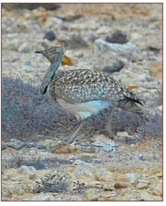
A rare and elusive Houbara bustard.

The sandgrouse and stone-curlews would have made an excellent end to the day, but I was determined to have another try for houbara bustard on the way home. Before reaching the hotel we turned off on a narrow road that crosses the extensive coastal plain west of Tindaya. We stopped and scanned from various vantage points, but only succeeded in spotting another pair of black-bellied sandgrouse and a group of lesser black-backed gulls (our only ones of the week). After an hour or so the lure of a cold glass of beer was starting to overcome our interest in seeing a houbara, so I turned the bus round and stopped for one last look. Eureka! Two houbaras were feeding on the margin of a dry 'field' about a hundred yards away. If we had got out of the bus they would have run off, but by staying inside we all had great views of them feeding undisturbed. When we were all satisfied, we headed back towards the hotel, but we had barely gone five hundred vards when another houbara ran across the road in front of us. We ground to a halt and watched as it walking past us, allowing Lesley to photograph it at close range.