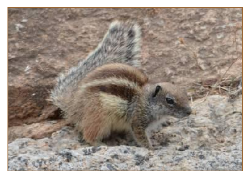
Barbary ground squirrel.

We drove south through the mountains, stopping briefly at a viewpoint high above the Río Palmas valley, from where we could look down on the tamarisks and palm trees at the dry reservoir we had walked to earlier in the week. As usual, tourists were busy photographing the tame Barbary ground squirrels, and there were equally tame Berthelot's pipits.