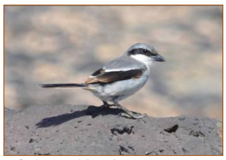
Southern grey shrike – a few were seen every day.

and linnets came to drink from the tiny inlet stream, giving good close views. But best of all was a magnificent male white-spotted bluethroat, which came out of the marginal vegetation to feed in full view on the mud just in front of us. When he turned towards us the shining blue upper breast, white spot and red line beneath were quite dazzling, and gasps of admiration were frequent. But he was not the only handsome bird on display. In the false tobacco behind him a fine male redstart same into view from time to time, and as we were about to leave a male woodchat shrike put in an appearance. It was a very colourful combination indeed.