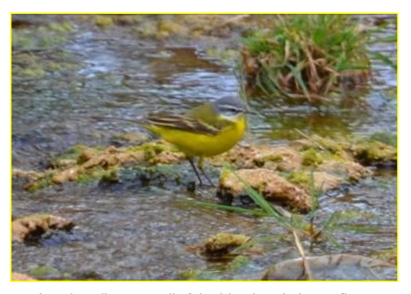
A male yellow wagtail of the blue-headed race flava .

After breakfast we drove south to the mountain area around Betancuria. We spent the morning in the relatively lush Río Palmas valley, with its palm trees and tamarisk groves. We parked by the barranco and walked down to the Las Peňitas Reservoir. Although the reservoir is almost always dry now (as it was today), there is always a trickle of water in parts of the barranco, and the thick growth of tamarisks and palm trees is attractive to a range of birds. No sooner had we left the van than we had great views of our first African blue tit of the holiday. With its deep blue back and black cap it is quite a different bird to the normal blue tit we are so familiar with at home, and it made quite an impression on the group.