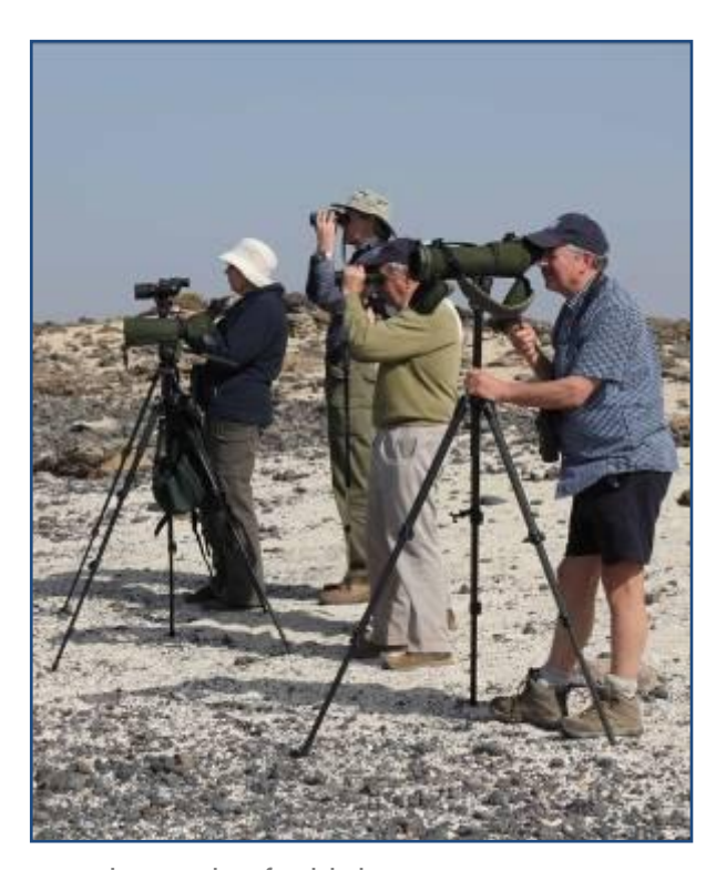
Cream-coloured courser; and scanning for birds.

After yesterday's long day, today we made sure we were back in time for the braver (female) members of the party to have a quick dip in the hotel pool. Then we met in the bar a little earlier than usual based on the meagre excuse that we had two days' log call to complete.