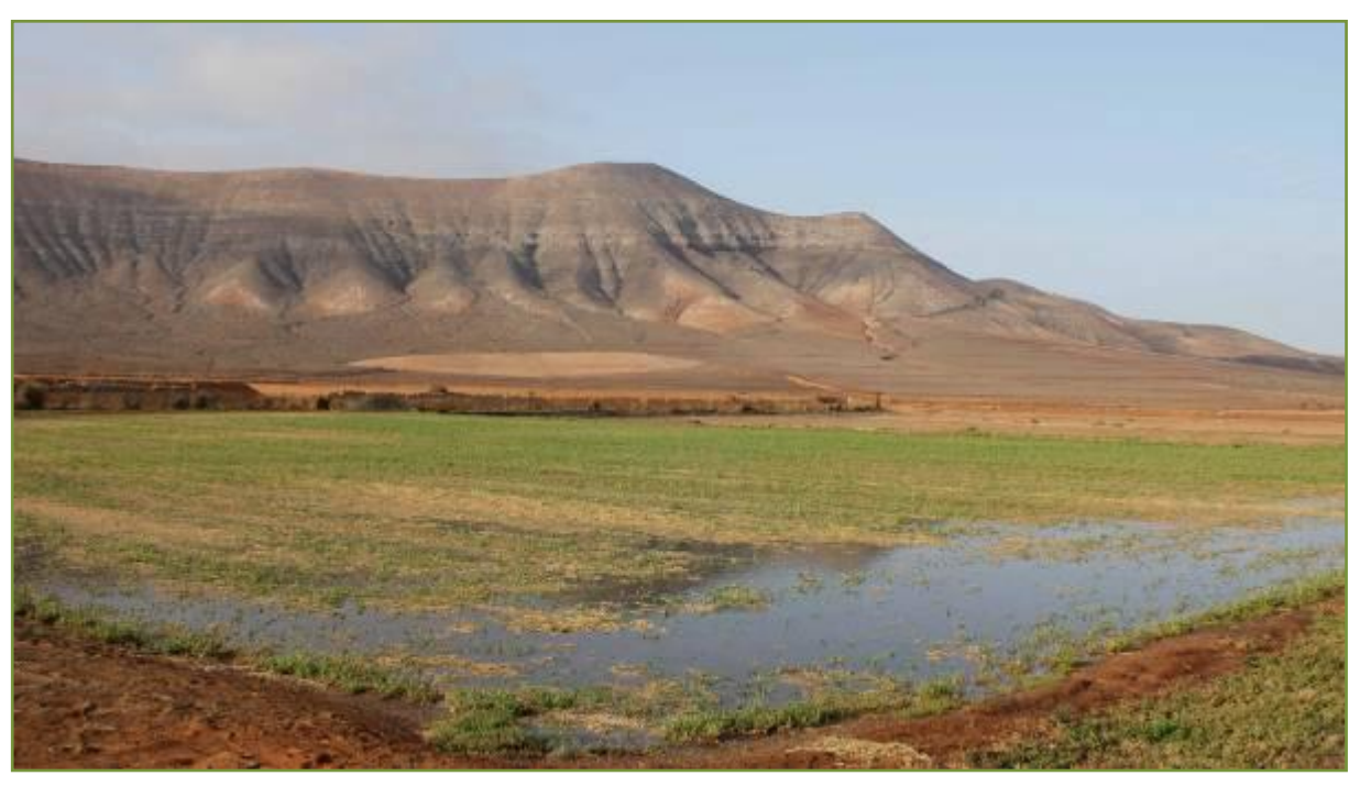
La Olivia fields and mountain.

On the southern edge of La Oliva there is a farm which always has a few green fields and is highly attractive to birds. It was just a few minutes' drive from our hotel, and we planned to visit it regularly before breakfast. This morning we spent a rewarding hour familiarising ourselves with more of the local birds. Most surprising, perhaps, was a pair of ruddy shelducks, which were present throughout the week. Although the first ruddy shelduck in Fuerteventura was only found in 1994 (by yours truly), it is a common bird on the island these days and is to be found in the most unexpected places.