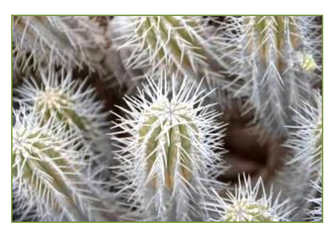
The very rare, cactus-like, Jandía spurge.