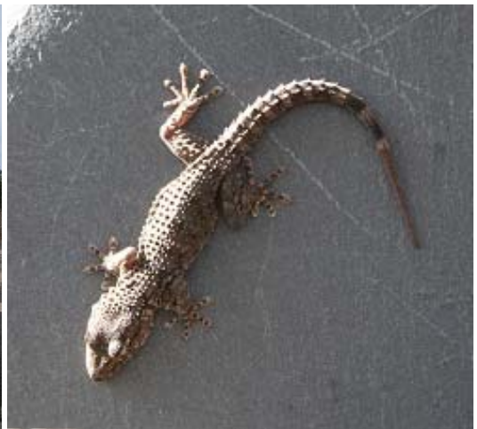
Monfragüe National Park, overlooking Peña Falcon; Moorish gecko.