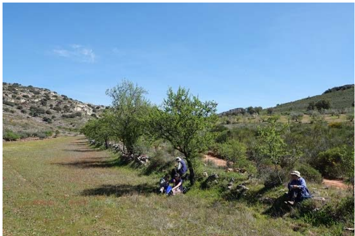
Iberian fritillaries; Jabata valley.

We then returned to the Alange reservoir, eventually finding some rather distant Collared Pratincoles. Onwards to Mérida where we visited the Roman Bridge. Here we had excellent views of Pallid and Alpine Swift, a wonderfully concealed Little Bittern, as well as Black-crowned Night Heron, Glossy Ibis and Purple Swamphens.