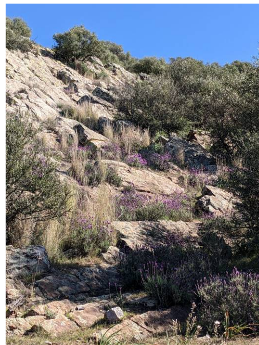
French lavender (RD)