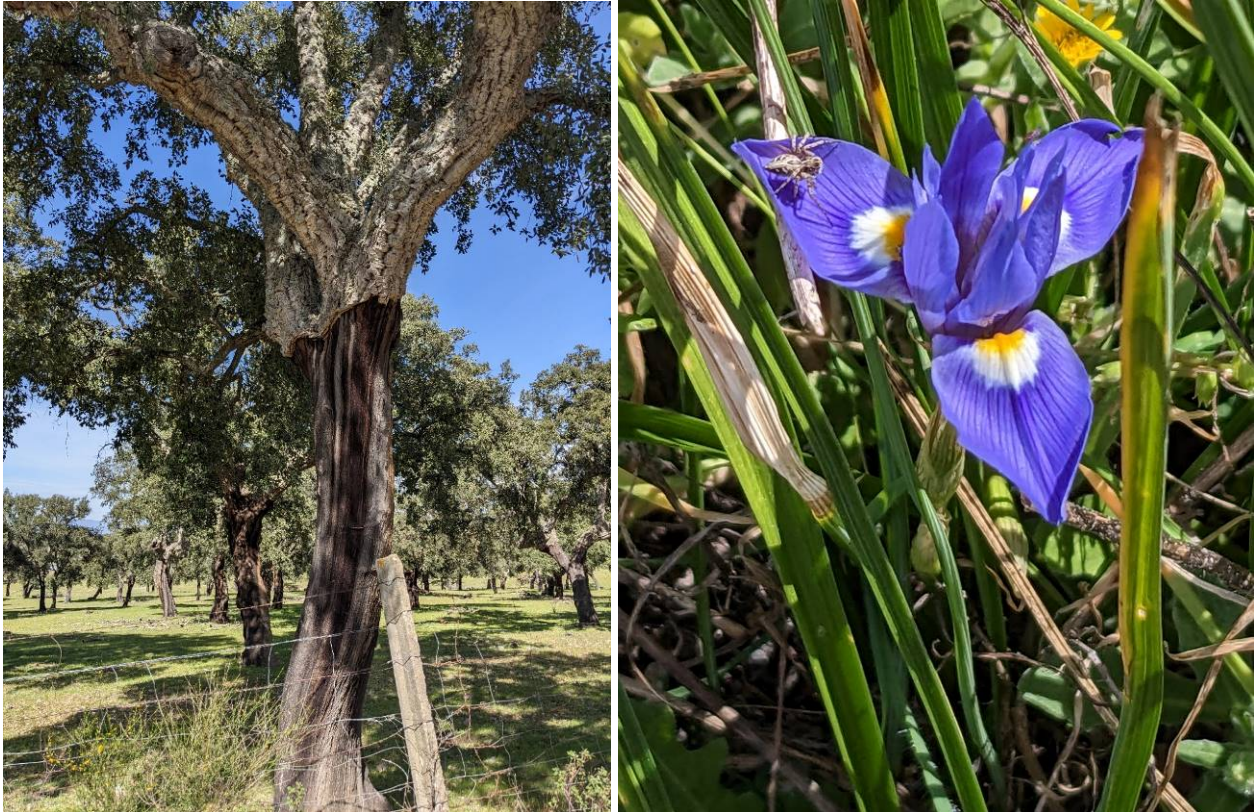
Cork oak, Barbary nut iris.

We continued to visit a cork oak dehesa and then turned around to make our return through the park. We stopped to admire more Angel's Tear Narcissus and then again beside the Tagus River where three Moorish Geckos were enjoying the afternoon sunshine on a slate notice board.