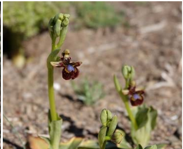
Sage-leaved cistus (RD); mirror orchids.