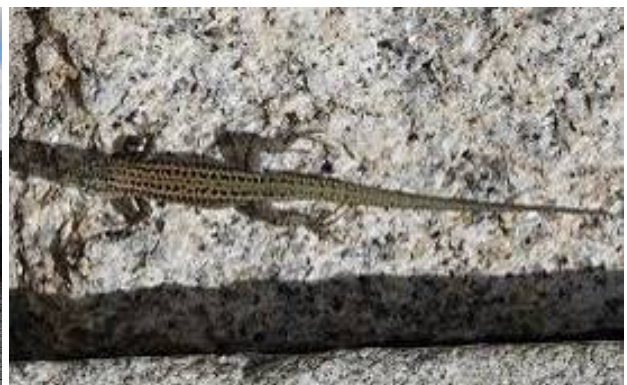
River Almonte; Geniez's Wall Lizard.

We spent the afternoon visiting the historic town of Trujillo, moving from the 16 th century Main Square up to the oldest part, the Moorish castle at the top of the town, working through the early medieval walled city and then back into the Main Square. Our journey through history, embracing two continents was accompanied by Crag Martins and White Storks, a Geniez's Wall Lizard, a Fire Bug and wonderful views of the surrounding landscape.