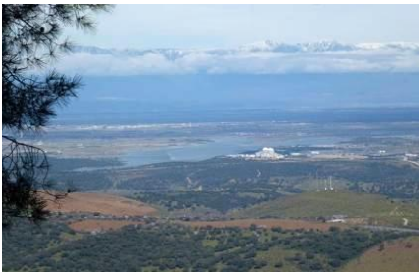
Almaraz and the snow-capped Gredos mountains from Miravete Pass.

Three lesser spotted woodpeckers together before breakfast highlighted what a remarkable week it had been for this species that is now so hard to find in the UK.