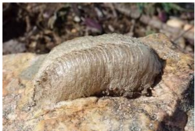
Praying mantis Mantis religiosa egg case