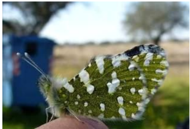
Portuguese dappled white