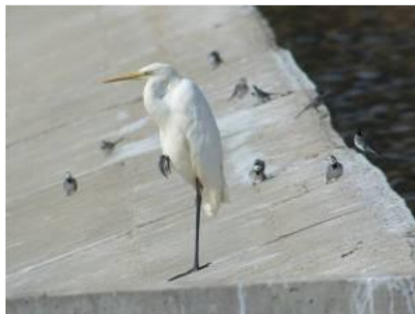
Birdwatching at Alcollarín reservoir; great white egret and white wagtails.

We returned along the reservoir's side and drove over the dam wall and as far as the track allowed along the other side. On this side were heard then found wigeons, a dozen or so shelducks and couple of pintails, though the best sighting was probably a dense and mobile flock of Spanish sparrows. We returned across the dam where a swallow and a crag martin flew over us.