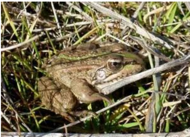
Iberian water frog