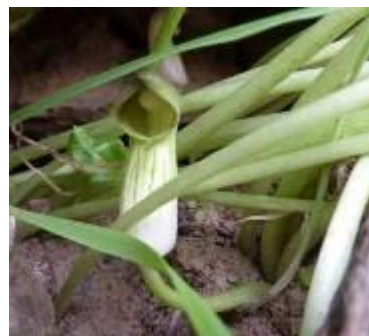
L to R: Wall pennywort (navelwort) growing in a cork oak's bark at the Finca; henbit deadnettle; friar's cowl Arisarum simorrhinum

It was my first visit to the new reservoir at Alcollarín, and what a great place it is – and very easy to enjoy. The first small car park was right by the dam wall, and immediately there were dozens of great crested grebes, lots of black-headed gulls and many hundreds of shovelers on the water. Close in there were noisy dabchicks and better still were three black-necked grebes: the one we had in the scope showed its fiercely red eyes. Crested larks foraged on the stony ground in front us, and other birds putting in an appearance included stonechats, black redstart, several chiffchaffs and the greenest of greenfinches. There was a constant movement of white wagtails over the water and two marsh harriers came past from opposite directions.