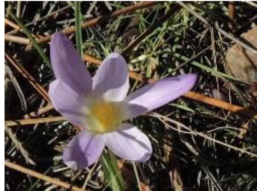
Crocus carpetanus (MP)