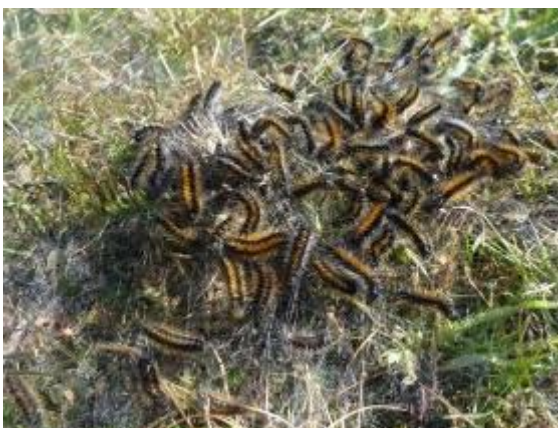
Caterpillars of the tiger moth or winter webworm Ocnogyna boetica