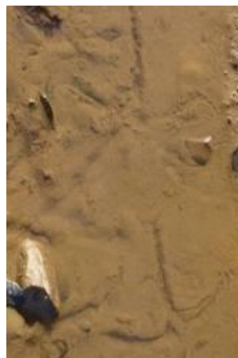
Cranes, and crane footprints in a puddle.