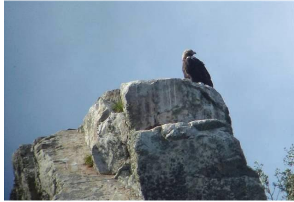
Azure-winged magpies are returning to the picnic site in Monfragüe NP. Spanish imperial eagle.

Our final stop was at the Portilla del Tiétar, another impressive set of cliffs beside the flooded Tajo. Alongside the road were dozens of pale yellow angel's tears narcissi: in the scrub were flowering pink-coloured Spanish heath and rosemary. There were the inevitable griffons and two high-flying black storks and we found the tiny crucifer shepherd's cress. Then an eagle flew in: a fine Spanish imperial eagle landed on a rock on the top of the Portilla del Tiétar, allowing lots of time for excellent views for everyone. After enjoying another distant blue rock thrush, and once Jan had enthused some local visitors about the eagle, we set off back towards home. There were a few cranes in the dehesa along the way.