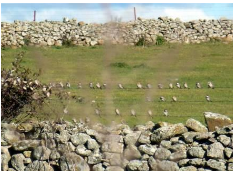
Spanish sparrows – a holiday highlight.

We stopped at a service station to fill the minibus's tank and grab a quick coffee, and were soon back at the airport with a splendid week and 1302 kilometres behind us. There was time to drop bags and eat our picnics before going through security for a smooth and on-time easyJet flight home.