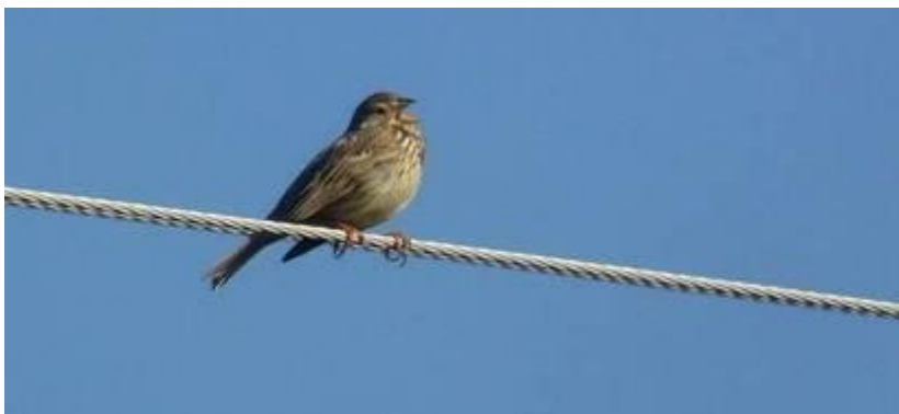
Corn bunting at Madroñera.

Remarkably, before breakfast on this frosty morning, there were two lesser spotted woodpeckers on view. While four of us were down the lane getting brilliant views of a drumming male, the others were watching another one in the car park area.