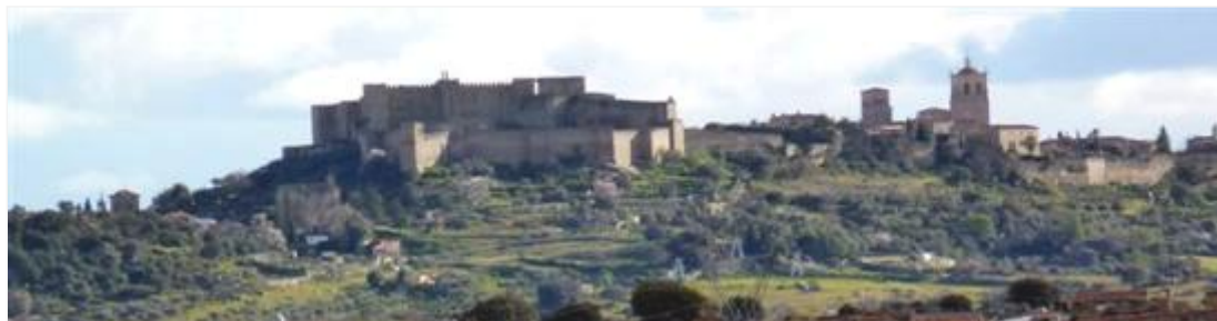
Trujillo from the granite Berrocal.

Heading east, our luck was in again as a great spotted cuckoo flew through the scrub on the right of the minibus. We stopped to search for it: Howard seemed to have a great knack of finding wherever it perched in the mixed cork oak and retama scrub. A little farther along the same road we paused to admire a large flock of Spanish sparrows on fence wires and bushes. Our final stop was in the Berrocal , the area of granite outcrops on which Trujillo is built. Pink patches of storksbill were as expected, but Mavis also found some early blooms of the unusual star-of-Bethlehem Ornithogalum concinnum .