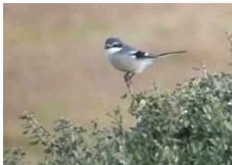
Iberian grey shrike

Happily, the cloud lifted almost magically as we took the first turn off the motorway towards Cáceres. At our first stop overlooking the plains some birdwatchers were leaving as we arrived and they helpfully pointed us in the right direction for some little bustards. There were six birds just in front of the first ridge, in and out of some retama scrub. We also had an excellent view of an Iberian grey shrike, and a crested lark posed on a post so we could examine its beak shape compared with that of the Thekla lark we'd seen a few days ago. A flock of dumpy, fast-flying birds must have been pin-tailed sandgrouse, but it wasn't a good view.