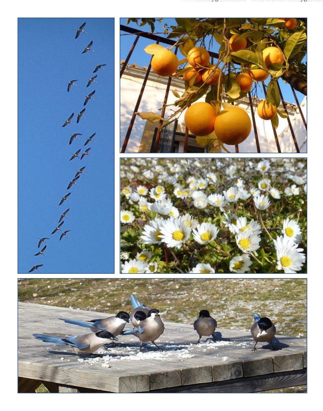
Extremadura 14 – 21 February 2012

36 Thunder Lane, Thorpe St Andrew, Norwich NR7 0PX Telephone: 01603 300552 www.honeyguide.co.uk E-mail: chris@honeyguide.co.uk