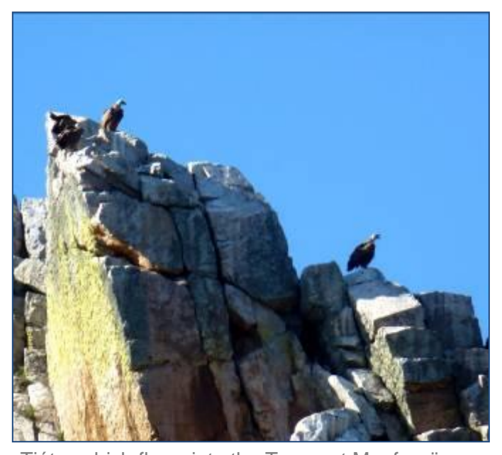
Peña Falcón crag, overlooking the river Tiétar which flows into the Tagus at Monfragüe; and griffon vultures at Portilla del Tiétar.

We descended and drove to the viewpoint of Peña Falcón, facing the impressive cliff bearing the same name. As we got out of the vans a Spanish imperial eagle appeared briefly among the circling vultures near the cliff top, and barely seconds later an Egyptian vulture, a newly arrived summer visitor, had also made an appearance. Shortly afterwards an Egyptian vulture was watched being mobbed by a peregrine. An obliging male blue rock thrush gave us superb views, perched on a