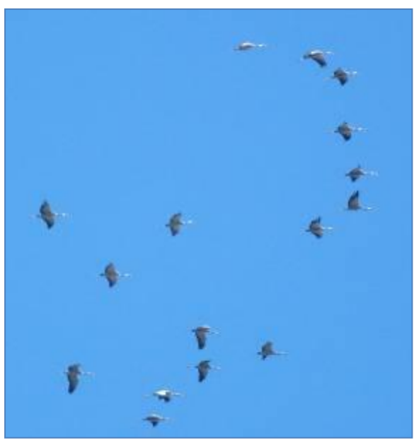
Cranes in the distance at Campo Lugar, heading north on migration and passing overhead.

Gradually, fewer groups of cranes were passing and the wave of migration was coming to an end. A couple of skeins of greylag geese had also passed over, in more defined 'V's and on a slightly different route-bearing. We climbed back into the vans and continued to Campo Lugar for coffee, all of us feeling that we had shared a moment of magic.