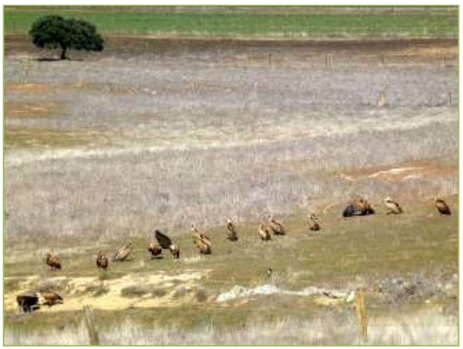
Fun in Trujillo's plaza major, and vultures with a carcass on Belén Plains.