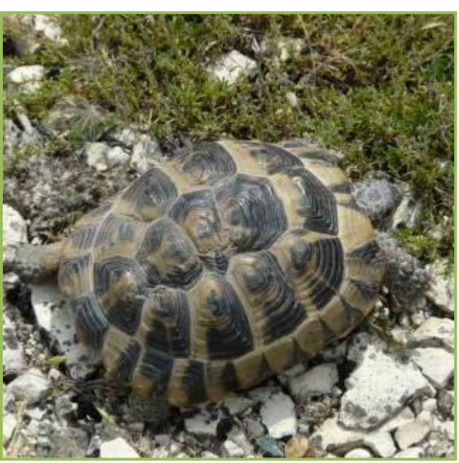
Spur-thighed tortoise showing its single tail plate.