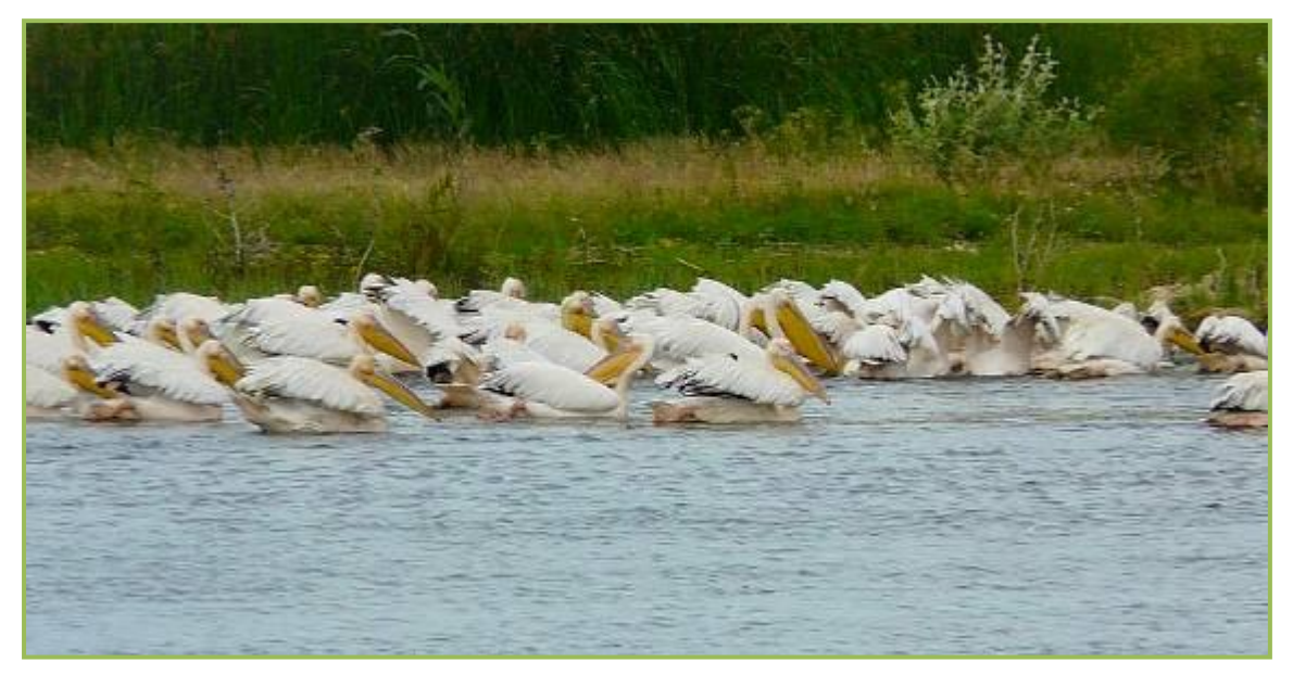
A flotilla of white pelicans.

Once again we set off through the narrow waterways into the heart of the delta, to just soak up the atmosphere of place and take our fill of the wonderful selection of birds on offer, many of which we probably wouldn't see again after today. As over the past few days, the sheer number of waterbirds often took our breath away. It was good to know that someone with Eugen's enthusiasm is working so hard to ensure that the bird interest of the delta is being maintained.