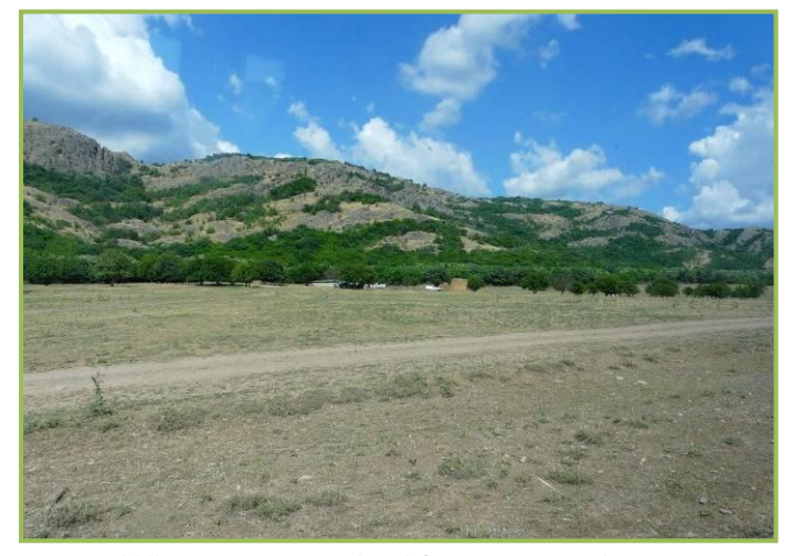
Where we searched for stone-curlews.

A scattering of waders on the mud included two smart marsh sandpipers in summer plumage, rather like small and dapper greenshanks; another nice bird to see as most would have passed through by this time. Searching revealed yet more black-tailed godwits and our first redshanks of the trip. I was confused for a bit by a summer plumaged sanderling but by a process of elimination it became clear what it was. Other waders included our first Kentish plover, some lapwings, groups of black-winged stilts and avocets. Top marks though went to the hawking collared pratincoles that treated us to their wild aerial displays – clearly several were breeding here. Here too we saw our only Caspian tern of the trip, a single bird in flight. There were common terns and among them we found a couple of little terns, again the only ones seen. Toes dipped in the Black Sea for some and we were on our way back to the minibus via some shelducks, a few hoopoes and a tawny pipit.