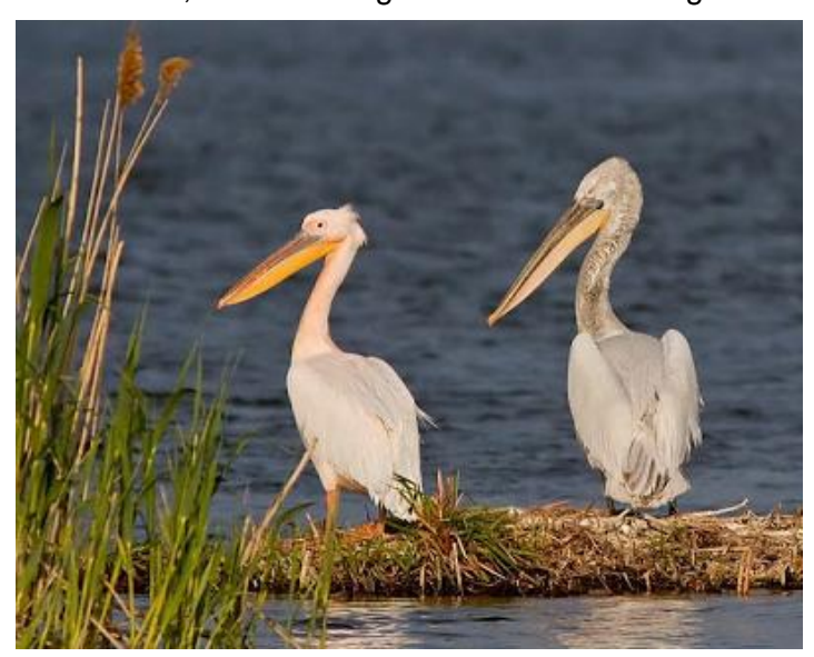
White pelican (left) and Dalmatian pelican (right).

flooded marshes. They were everywhere it seemed, as were night herons, grey herons, a few purple herons and a number of little egrets. As we passed flooded marshland both glossy ibises and spoonbills flew up, giving us excellent close views. Pygmy cormorants and great cormorants added to the variety, as did Dalmatian pelicans that were found in small numbers in similar situations. Eugen carefully pointed out the differences between white and Dalmatian pelicans, the former often overhead in large numbers or feeding in tight groups on the water just ahead of us. Great white egrets were seen in several places, dwarfing the little egrets and squacco herons. A real highlight was our first view of a white-tailed eagle. Later in the day we saw several more and when we added them up at 'call-over' at the end of the day we came to the