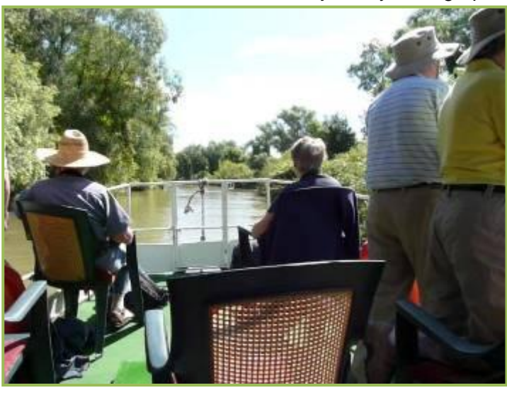
Exploring side channels on the day launch.

of the delta. Within minutes we had spotted kingfishers in several places and had distant views of white pelicans soaring high in the sky. The riverside trees and scrub held an interesting collection of birds including nightingales, redstarts, chaffinches, lesser whitethroats and garden warblers - all very common, it seemed. The fluty song of the golden oriole was also heard but few got good views: just fleeting glimpses, so typical of the species. As we progressed deeper into the delta, a goldeneve was flushed from the water, not a bird I had expected to see at all but Eugen told us that they are becoming increasingly common in winter. I suggested putting up nest boxes in the hope that they might stay to breed.