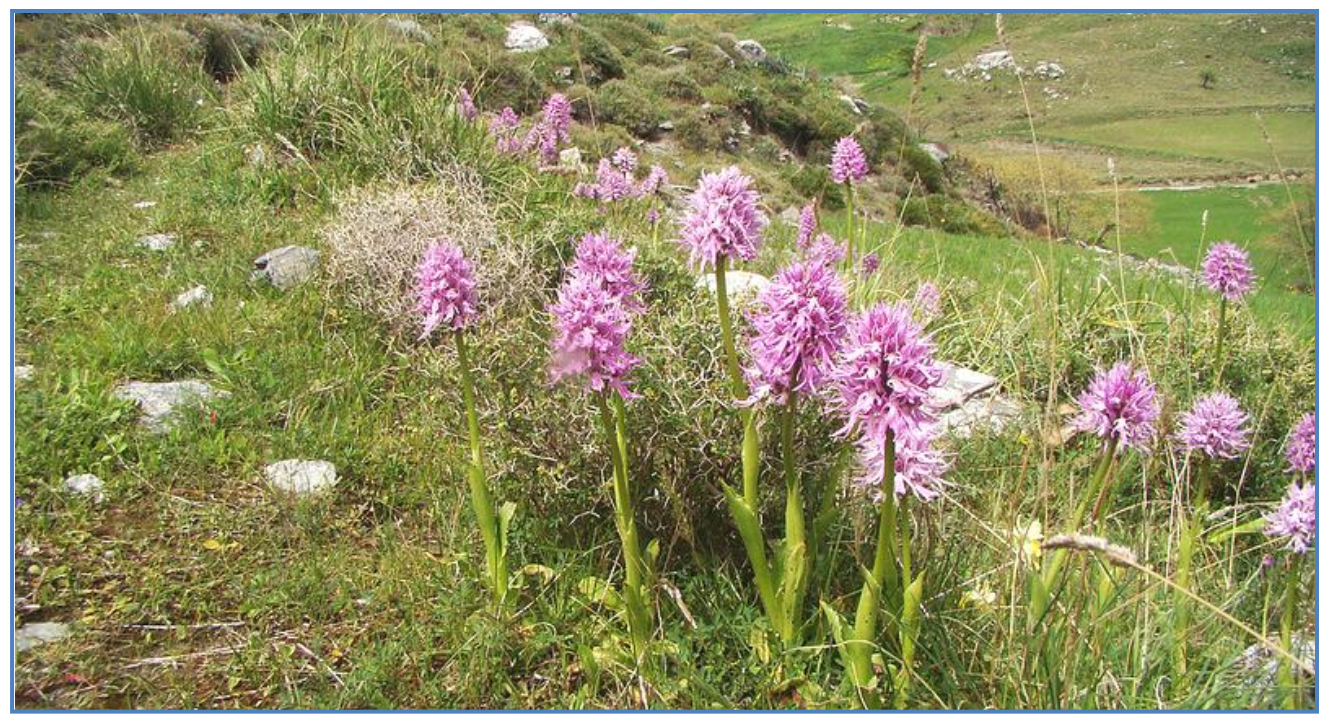
Italian man orchids at Spili.

Then it was off to the 'Bumps', or more formally, the foothills of Mt Kedros. Just past a deserted taverna, a small lay-by was heaving with parked cars, testament to the popularity of the place. And fully justified popularity: a track through arable fields studded with deep red Tulipa doerfleri led us to a rocky hillock covered in orchids! Although not quite as impressive as in some previous years, given the late spring, we still found some 15 'species' (at least in the view of the predominantly German orchid 'splitters'), and some particularly showy displays of purple Orchis boryi and yellow fewflowered orchid. And so much more – Iris cretensis , crown anemone, friar's cowl, Gagea graeca and a whole host of other flowers added to the floral landscape, a treat for botanist and photographer alike, the latter benefiting from a veil of cloud starting to diffuse the strong sunlight (and as a consequence lifting humidity levels).