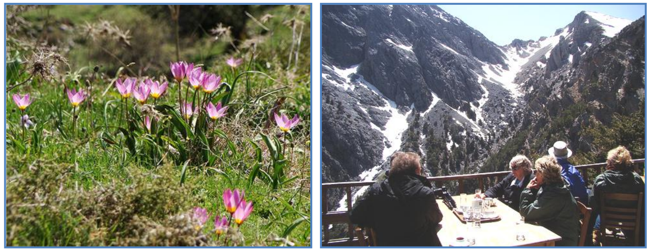
Tulipa bakeri at Omalos.

So began the long winding drive up: the road was good, the hairpins tight, but the views (for those who dared to look!) were amazing! Pausing in the sparse pine woodland near the top, the songs of cirl bunting, firecrest and wren accompanied our lunch. A Cretan festoon played hide-and-seek with the photographers; the flowering aubrieta by the road was a much more amenable subject! The rocks were also home to a myriad of small, white, cylindrical, truncated snails, the name of which thus far remains a mystery. A few minutes and several more hairpins later, we finally dropped down onto the Omalos plateau, a flat, stony plain surrounded on all sides by mountains, used for grazing sheep but studded with bright pink tulip flowers and crown anemones.