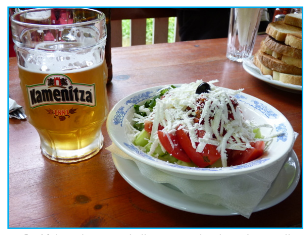
Café lunches and dinner at the hotel usually include salad – fresh, inventive and delicious.

Going out from the gorge, on the way to the museum of the Bear we saw a black woodpecker, alpine swifts, black redstart, wren, dipper and ravens.