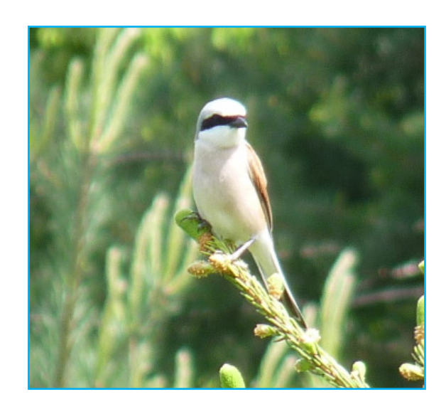
Red-backed shrike (adult male) – a fairly common breeding bird around Yagodina.

Walking up the gorge, Vlado pointed out some plants growing from the limestone cliff, including the Rhodopes endemic Haberlea rhodopensis , a pre-glacial relict (photo and more information in plant list), and Balkan endemic plants Saxifraga stribryni and Valeriana montana . In the gorge we saw leaves of throatwort, Trachelium rumelianum , and close to the tunnel, near the wallcreeper nest, Bulgarian figwort, Scrophularia bulgarica , both Bulgarian endemics. All of these species are included in the Bulgarian red data book of protected plants.