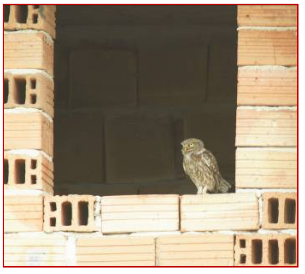
A little owl in the window opening of an unfinished building near Burgas