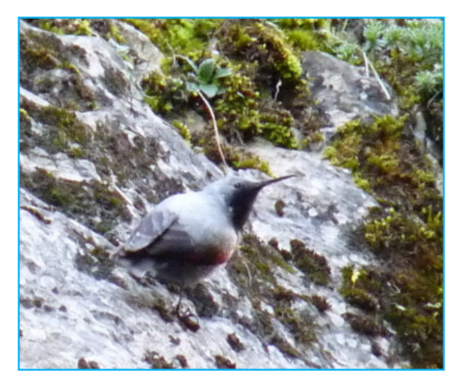
Closely related to the nuthatch, the wallcreeper's long probing bill is developed for finding insects among the vegetation of the rock face, and its strong feet for climbing and clinging on.

We assembled at 8am for our first tasty and sustaining breakfast at the Hotel Yagodina. Our destination today was Trigrad Gorge; target species, the wallcreeper. It was a short drive to the gorge where there is a known wallcreeper nest in the rock face just by the entrance to the road tunnel. We waited in the small layby while peregrine, crag martin and swifts were all seen flying above. A male wallcreeper was spotted on a distant rock face and came towards us, with raptors in attacking flight, straight to the nest. Very good and close views were had several times.