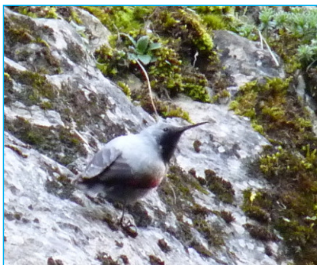
Closely related to the nuthatch, the wallcreeper's long probing bill is developed for finding insects among the vegetation of the rock face, and its strong feet for climbing and clinging on.

We assembled at 8am for our first tasty and sustaining breakfast at the Hotel Yagodina. Our destination today was Trigrad Gorge; target species, the wallcreeper. It was a short drive to the gorge where there is a known wallcreeper nest in the rock face just by the entrance to the road tunnel. We waited in the small layby while peregrine, crag martin and swifts were all seen flying above. A male wallcreeper was spotted on a distant rock face and came towards us, with raptors in attacking flight, straight to the nest. Very good and close views were had several times.