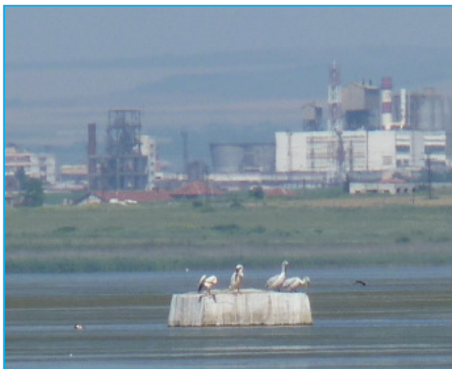
Two white and two Dalmatian pelicans with the industrial city of Burgas in the background

We drove north towards Burgas, stopping at the Poda protected area, and then revisited Lake Vaia to see little bitterns and both species of pelicans again. From there we drove to the Izvorska and Fakiiska rivers and had close views of a white-tailed sea eagle in flight above ibises and spoonbills.