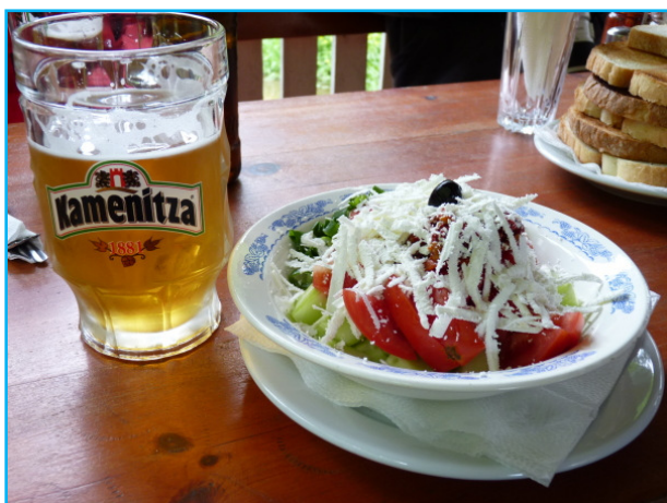
Café lunches and dinner at the hotel usually include salad – fresh, inventive and delicious.

Going out from the gorge, on the way to the museum of the Bear we saw a black woodpecker, alpine swifts, black redstart, wren, dipper and ravens.