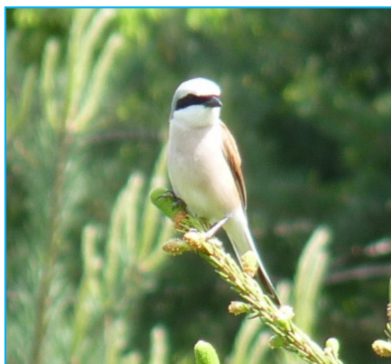
Red-backed shrike (adult male) – a fairly common breeding bird around Yagodina.

Walking up the gorge, Vlado pointed out some plants growing from the limestone cliff, including the Rhodopes endemic Haberlea rhodopensis , a pre-glacial relict (photo and more information in plant list), and Balkan endemic plants Saxifraga sibirica and Valeriana montana . In the gorge we saw leaves of throatwort, Trachelium rumelianum , and close to the tunnel, near the wallcreeper nest, Bulgarian figwort, Scrophularia bulgarica , both Bulgarian endemics. All of these species are included in the Bulgarian red data book of protected plants.