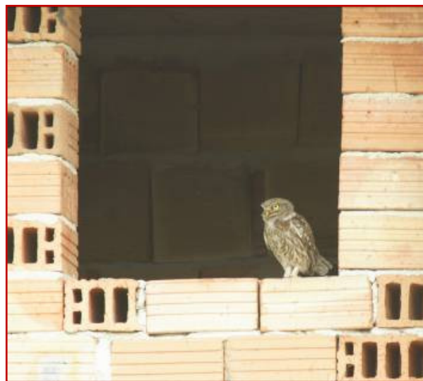
A little owl in the window opening of an unfinished building near Burgas